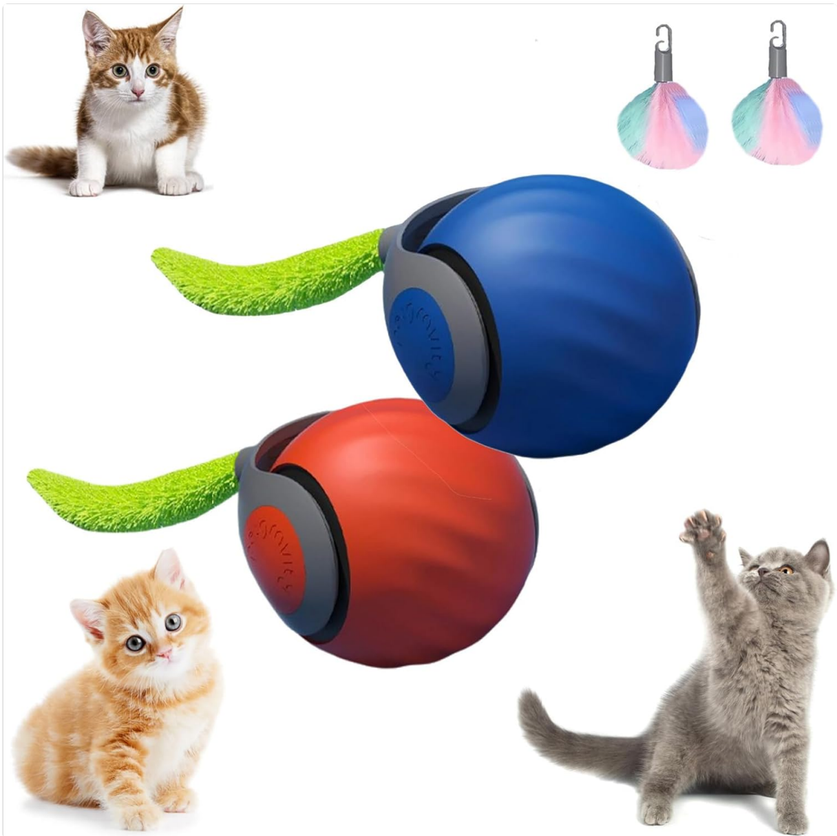
Figure 4.2: The cat toy with its attached tail, ready for play.