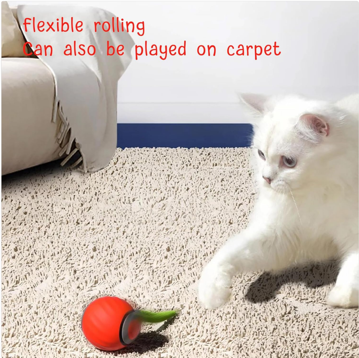
Figure 5.4: Designed to roll flexibly, the toy can be used on both hard floors and carpets.

flexible rolling Can also be played on carpet