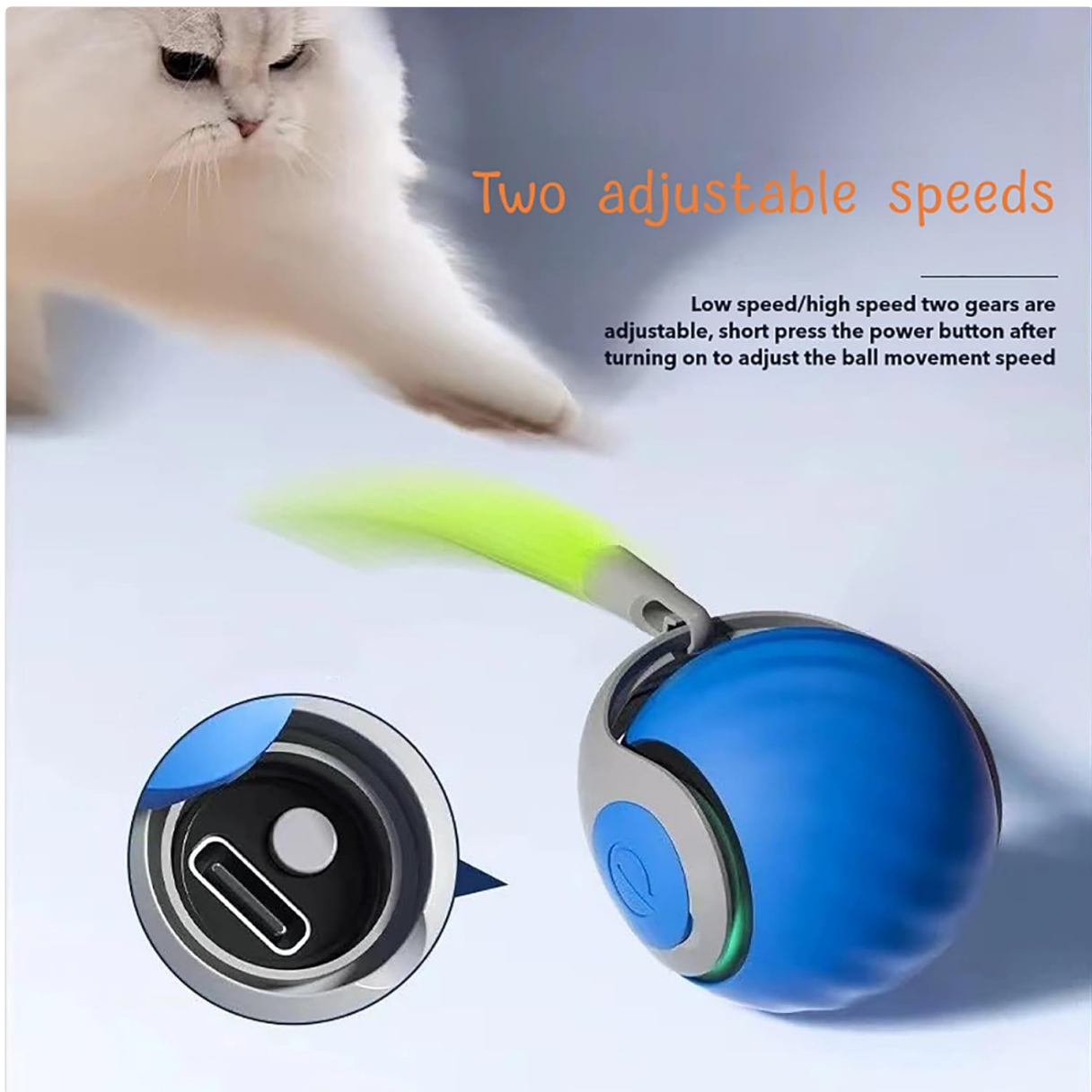
Figure 5.2: Press the power button briefly to switch between low and high speed settings.