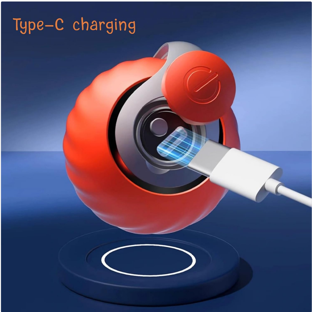
Figure 4.1: Connect the Type-C cable to the charging port for power.