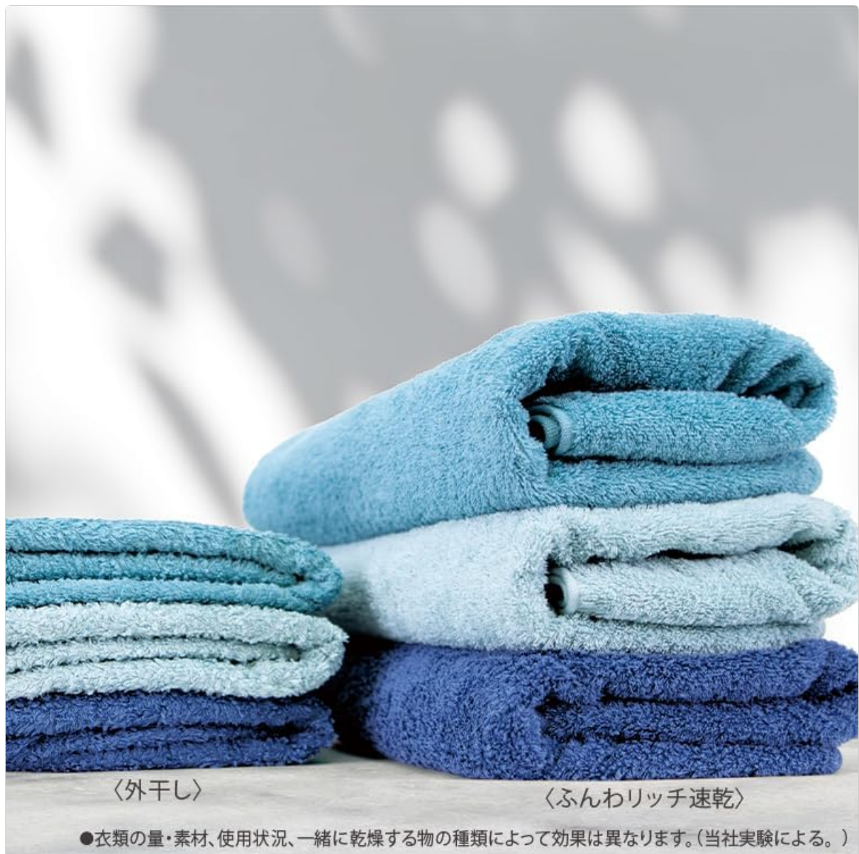
Figure 6: Towels demonstrating the fluffy finish after drying.