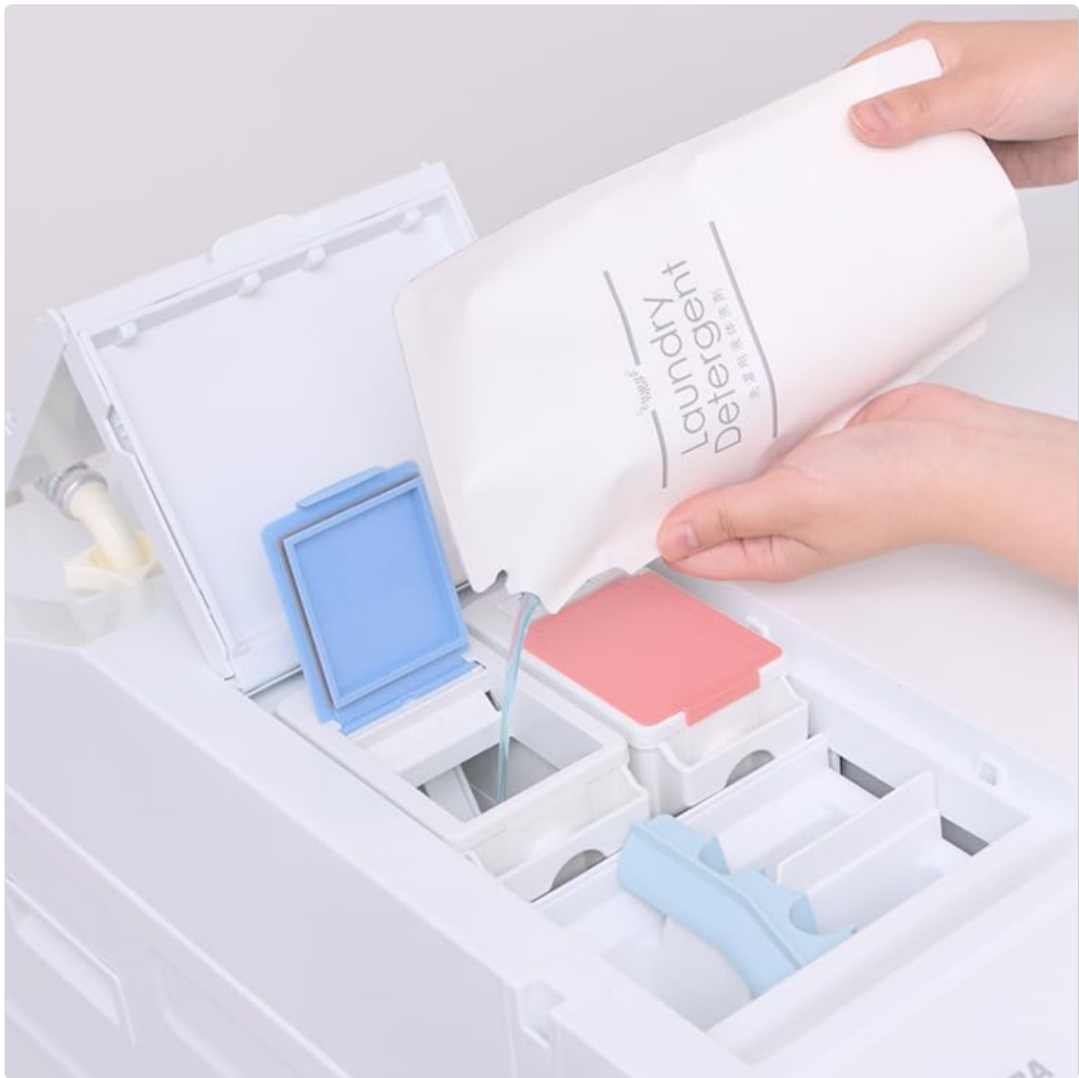
Figure 3: Filling the automatic detergent and softener dispenser.

Watch the video below for a demonstration of the automatic detergent dispensing feature: