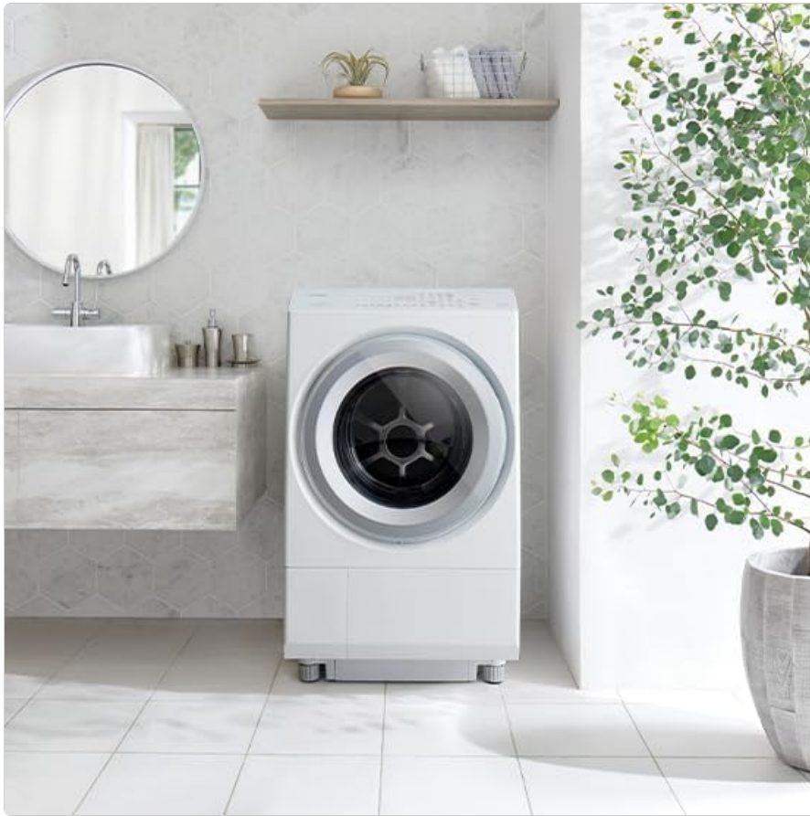
Figure 2: Example placement of the washer dryer in a laundry area.