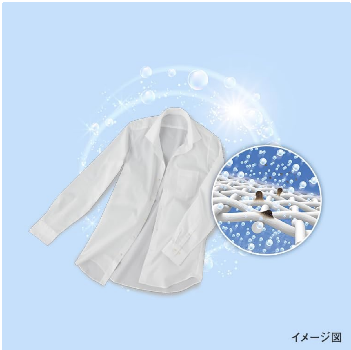
Figure 4: Illustration of ultra-fine bubbles penetrating fabric for deep cleaning.

See the Ultra-Fine Bubble Wash in action: