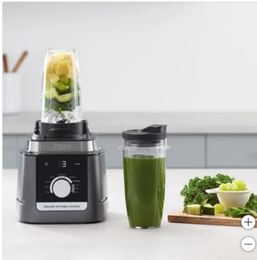
Figure 4: Single-Serve Cup in use. A 24-oz. single-serve cup is shown on the motor base with a green smoothie, alongside another cup with a spout lid.