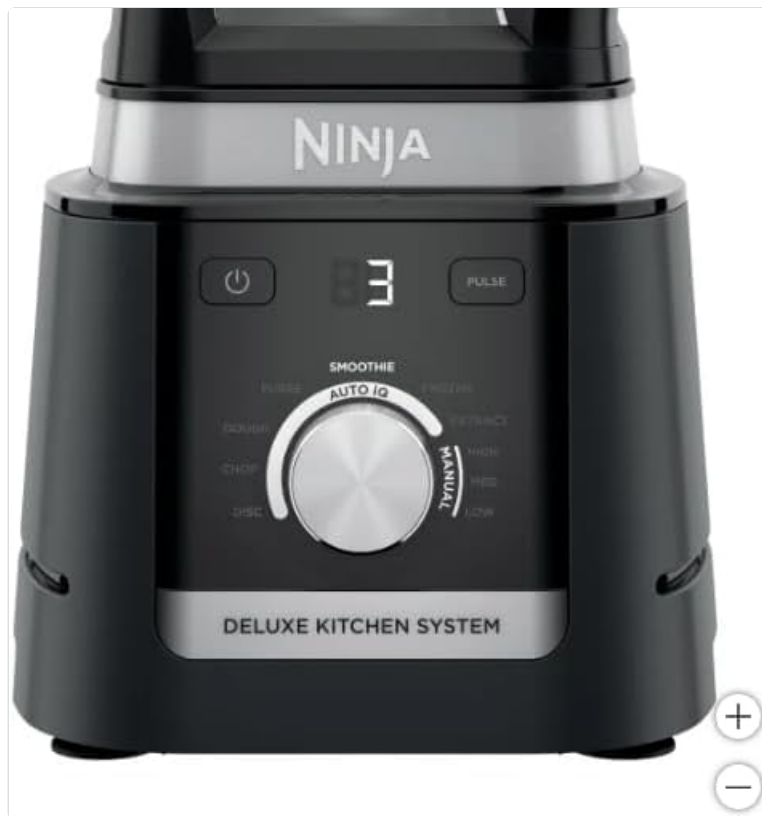
Figure 2: Control Panel. This image shows the motor base's control panel with power button, pulse button, and a central dial for selecting Auto-iQ programs (Smoothie, Frozen, Extract, Dough, Chop, Disc) and manual speeds (Low, Medium, High).