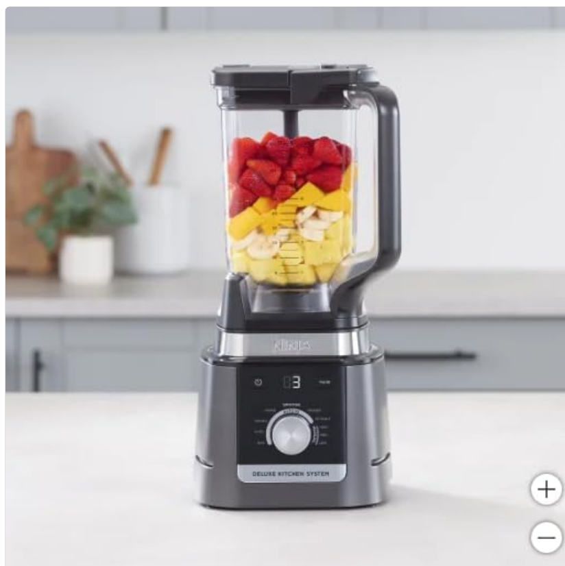
Figure 3: Total Crushing Pitcher in use. The 88-oz. pitcher is shown on the motor base, filled with various fruits for blending.