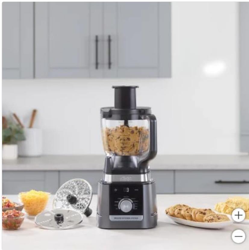
Figure 5: Precision Processor Bowl in use. The 9-cup processor bowl is shown on the motor base, containing dough, with various discs and blades nearby.