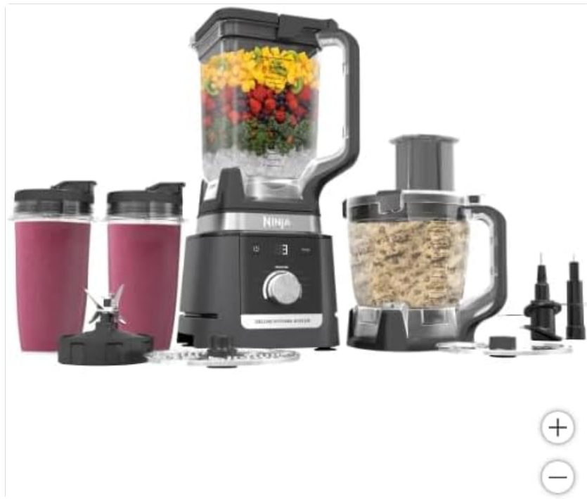
Figure 1: Complete Ninja Deluxe Kitchen System. This image displays the main motor base, the 88-oz. Total Crushing Pitcher with lid, two 24-oz. Single-Serve Cups with spout lids, the 9-cup Precision Processor Bowl with lid, and various blade assemblies including the Total Crushing Blades, Dough Blade, and reversible slicing/shredding and grating discs.