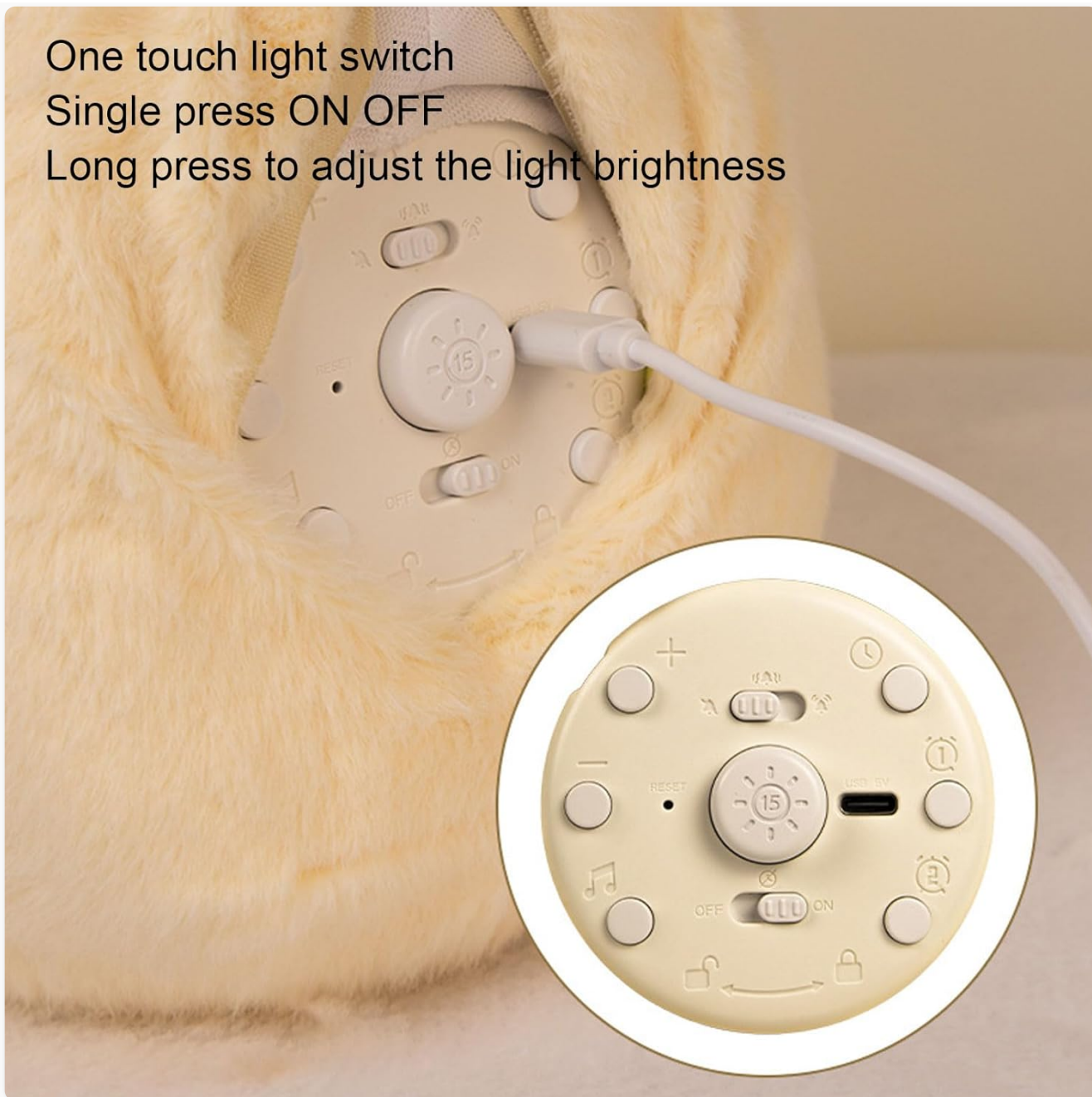
Image 4.1: Rear view of the alarm clock with control buttons and charging port.

One touch light switch Single press ON OFF Long press to adjust the light brightness