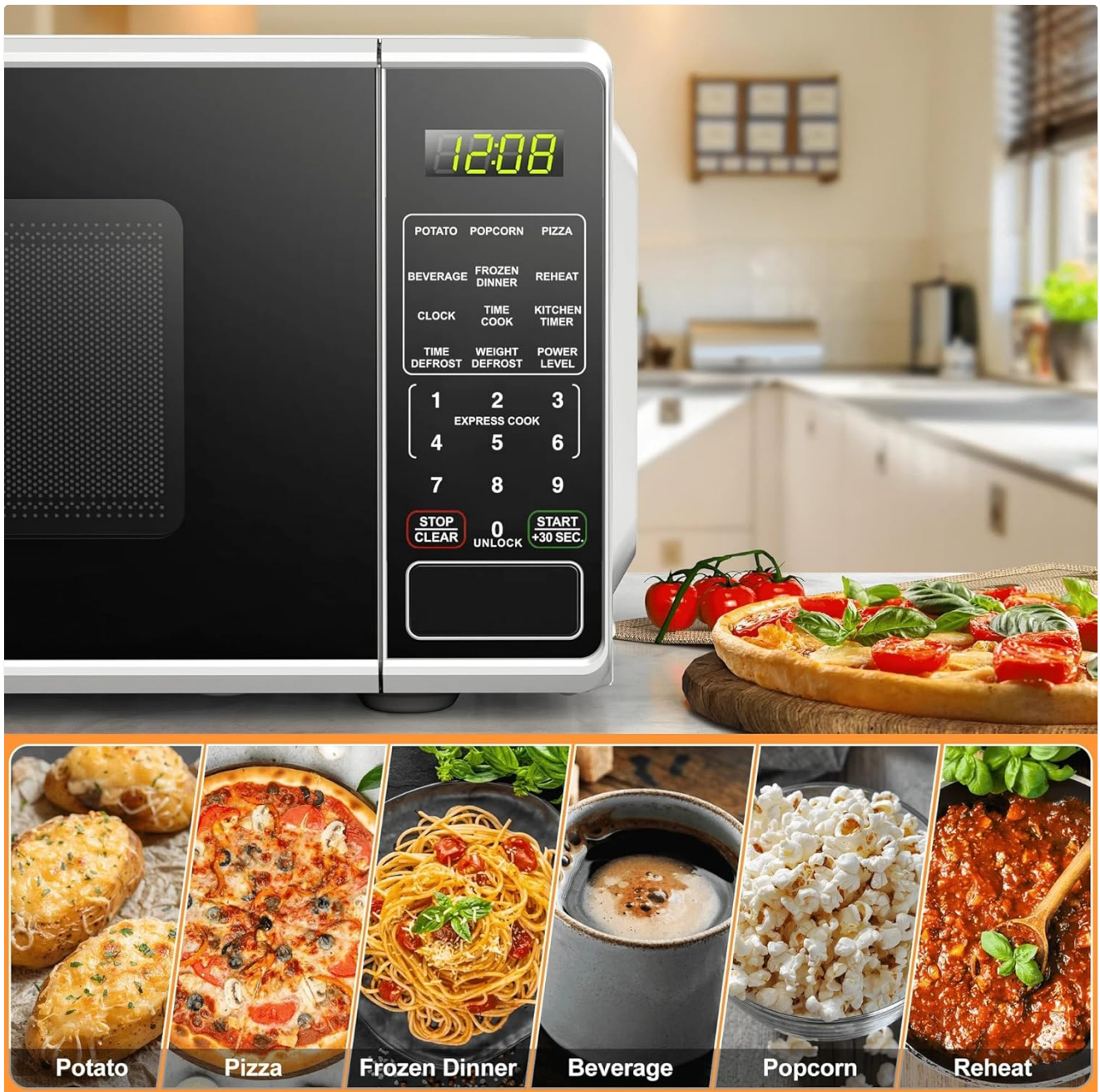
Figure 4: Control Panel Layout. This image highlights the buttons for quick-set menus (Potato, Popcorn, Pizza, Beverage, Frozen Dinner, Reheat), time/weight defrost, power level, clock, kitchen timer, and numerical keypad.