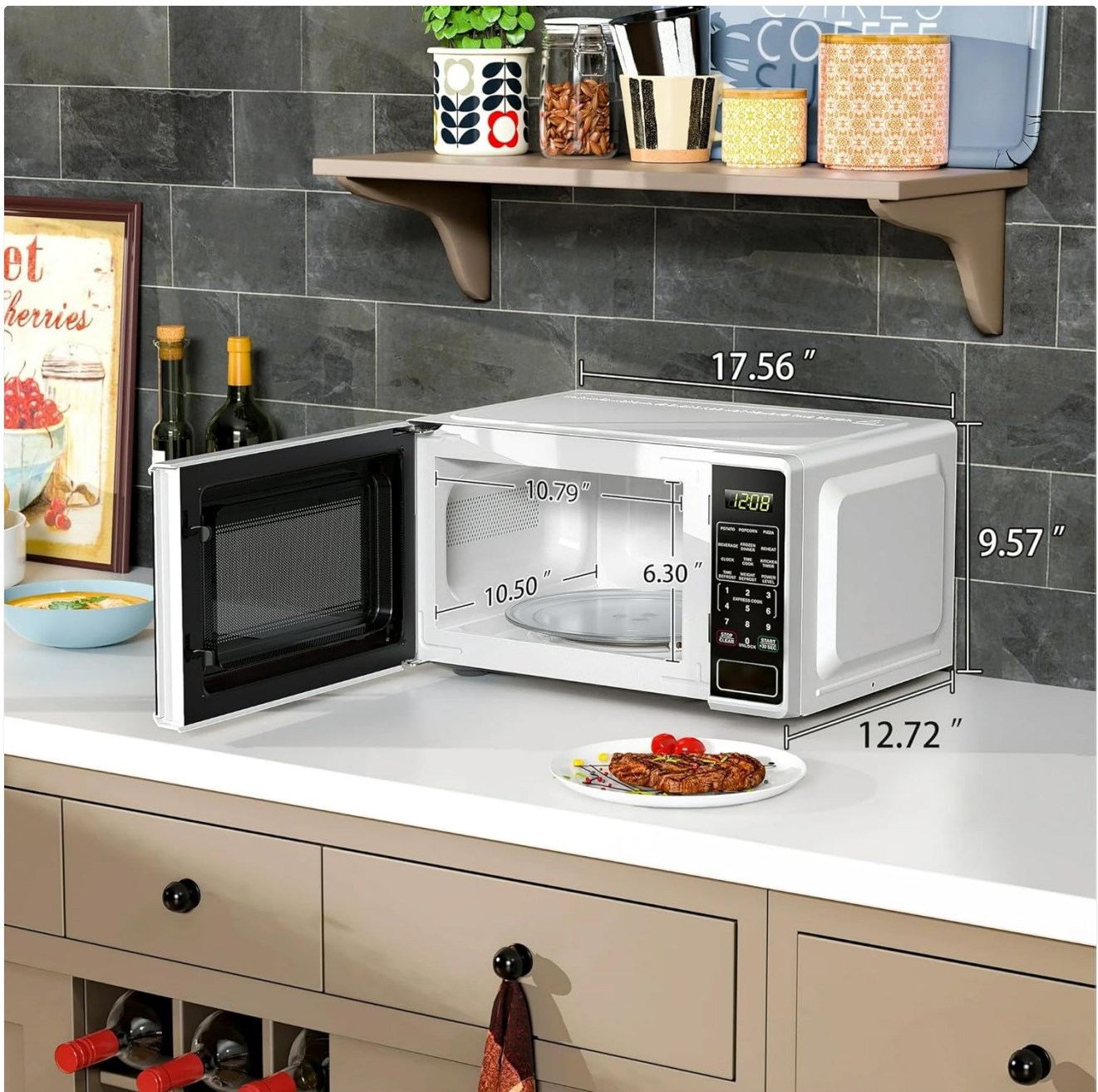
Figure 3: Microwave Oven Dimensions. This image provides a visual representation of the microwave's external dimensions: 17.56 inches (width), 12.72 inches (depth), and 9.57 inches (height).