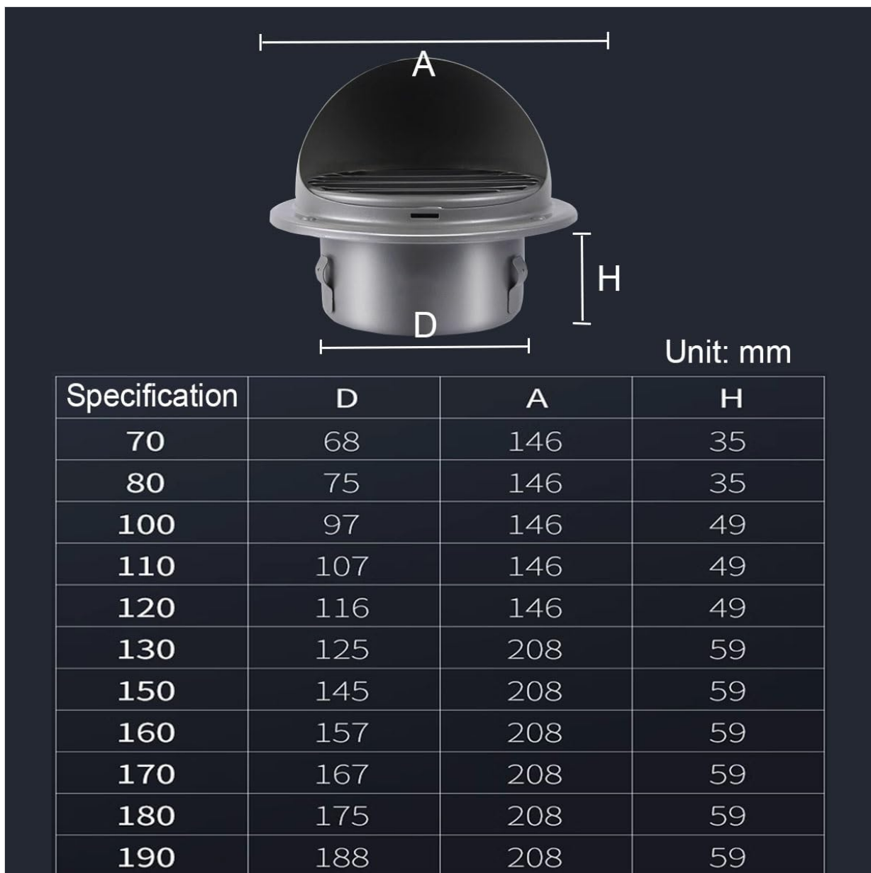
Image: Dimensional specifications for various vent cover sizes. This model corresponds to the 110mm specification.