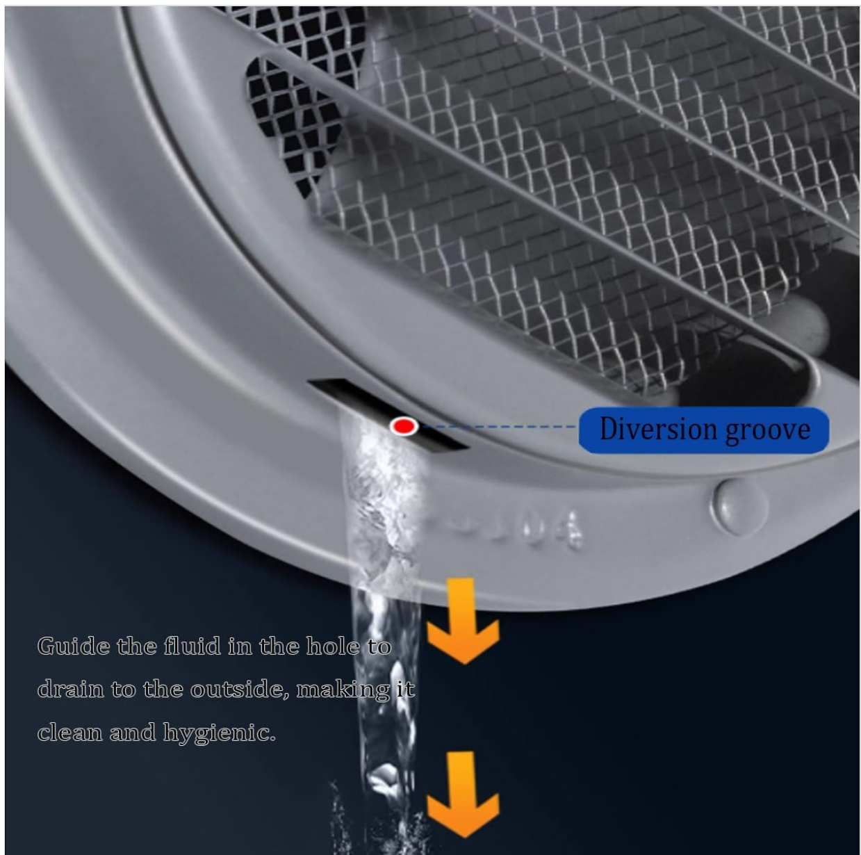
Image: The diversion groove guides fluid away, keeping the vent clean.