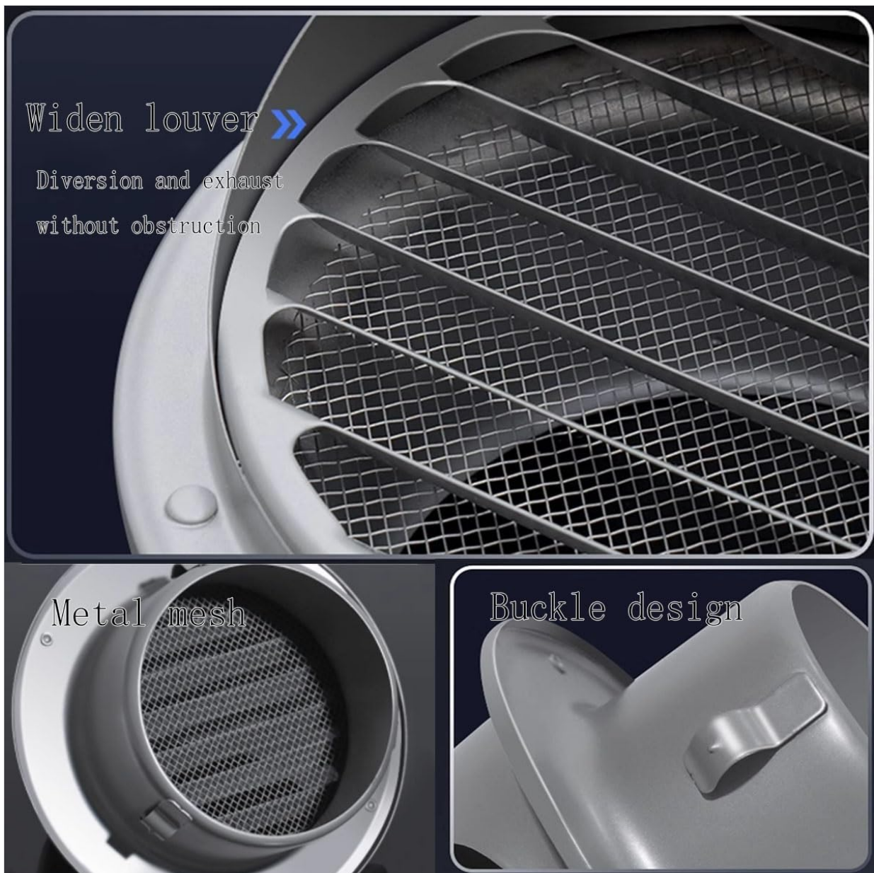
Image: Detailed view of the widened louvers, protective metal mesh, and secure buckle for installation.