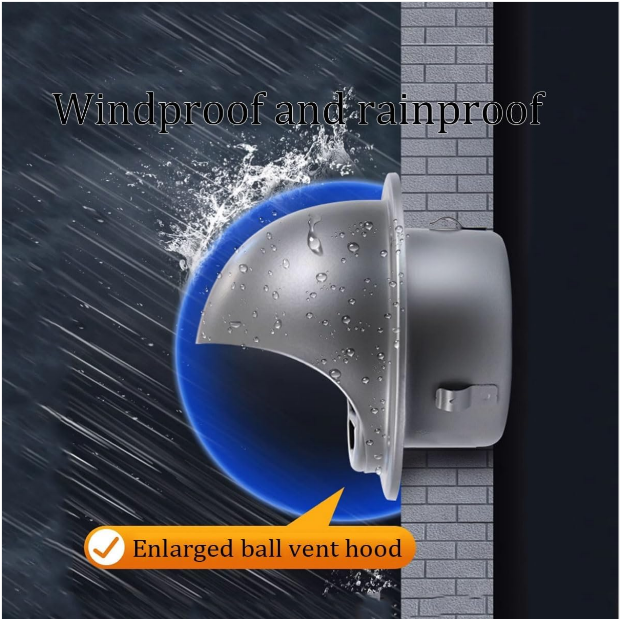
Image: The enlarged hemispheric design effectively resists wind and rain.