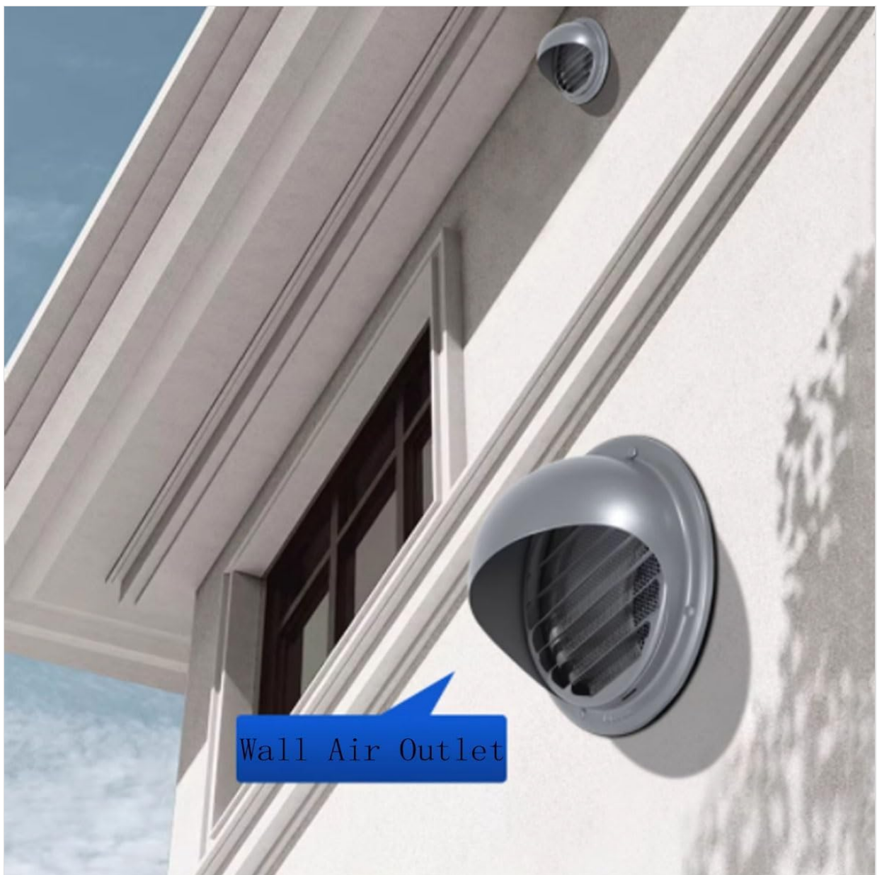
Image: Example of the vent cover installed on an exterior wall.