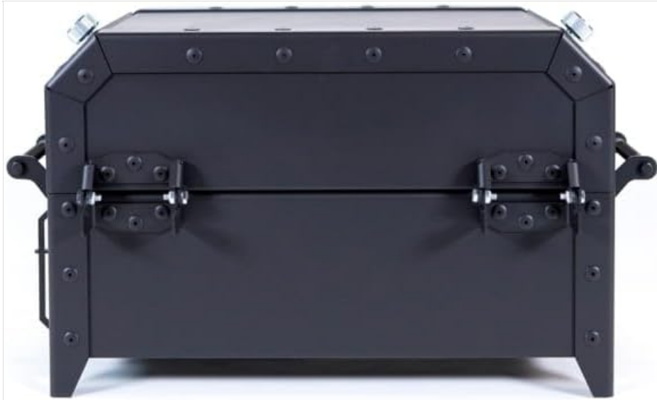
Figure 3.1: Rear view of the grill, showing the robust construction and hinges.