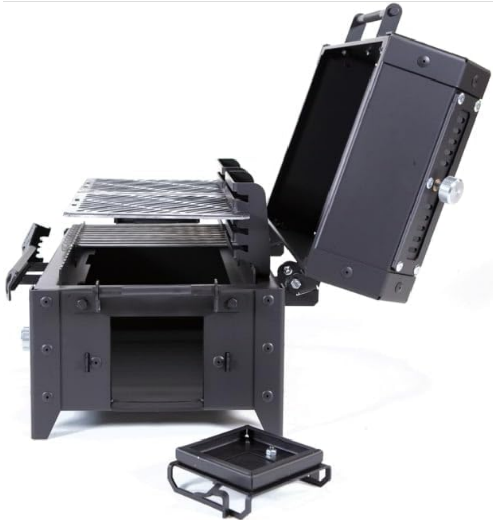
Figure 5.1: Side view demonstrating the removable ash tray for convenient cleaning.