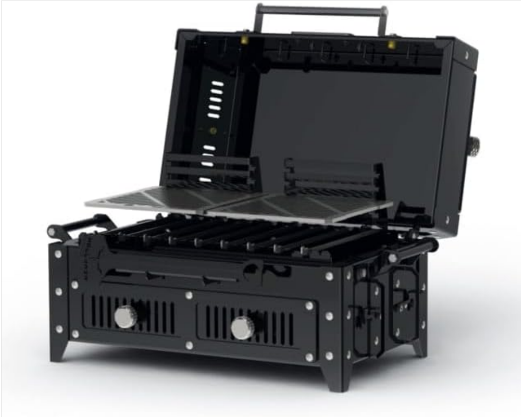
Figure 2.1: The OPMOD HellRazr YAMA Charcoal Grill with the lid open, showcasing the cooking grates and internal structure.