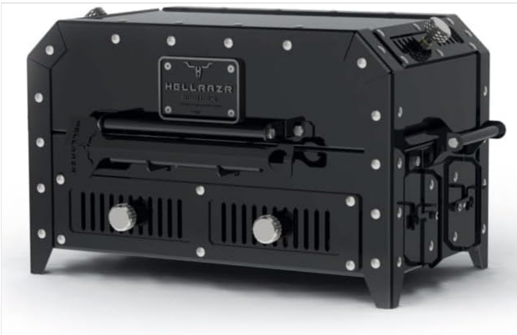
Figure 2.2: Front view of the OPMOD HellRazr YAMA Charcoal Grill in its closed position, highlighting its compact design.