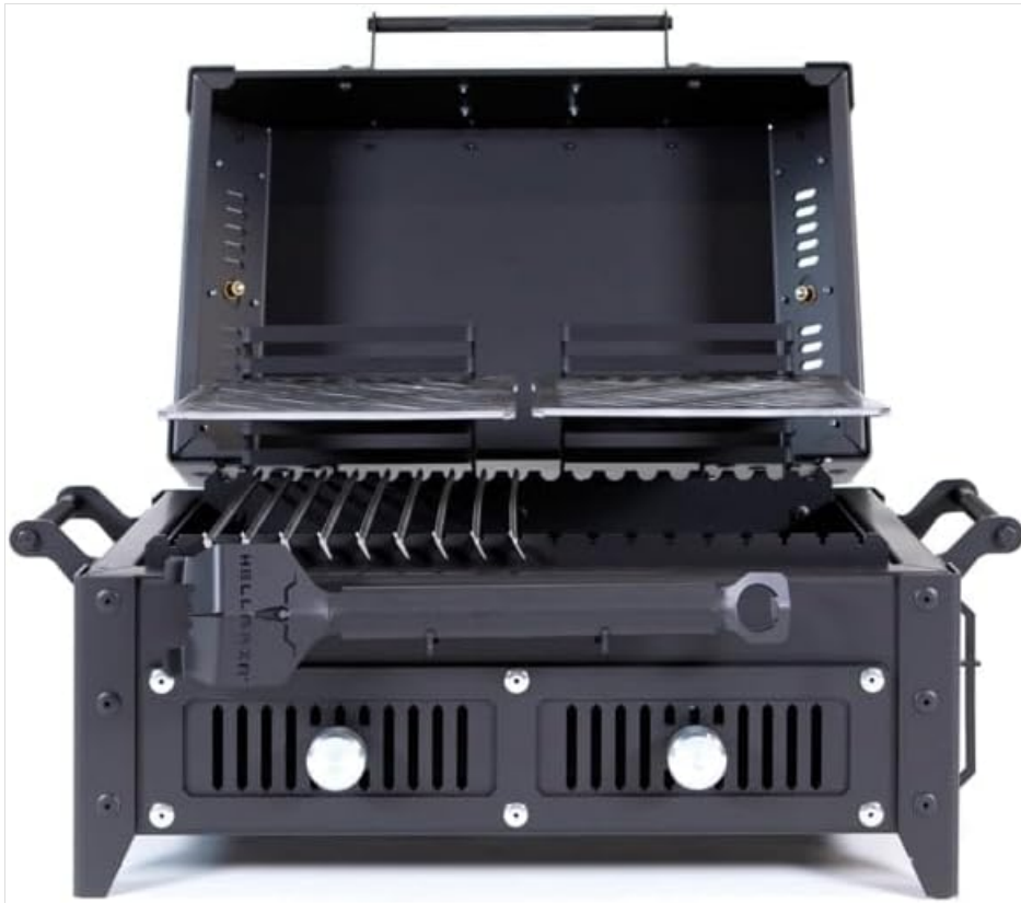
Figure 4.1: The grill open, illustrating the skewer slots and the main cooking grates.