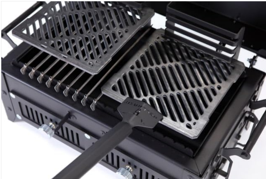
Figure 4.2: A detailed view of the precision laser-cut carbon steel grates and a compatible spatula.