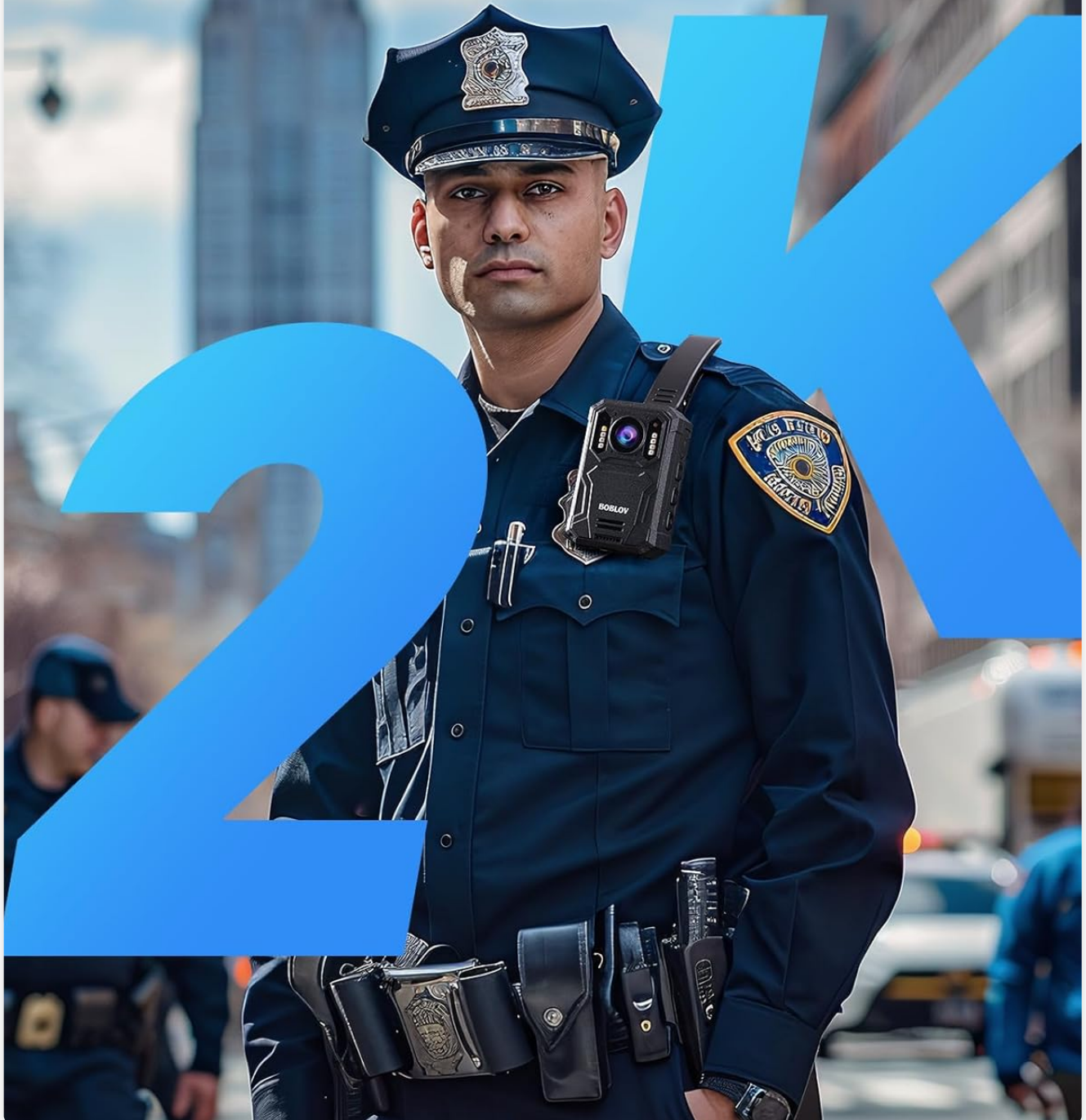
Figure 2.1: The KJ23Pro camera demonstrating 2K clarity, shown worn by a police officer.

Enjoy stunning images for high-definition viewing