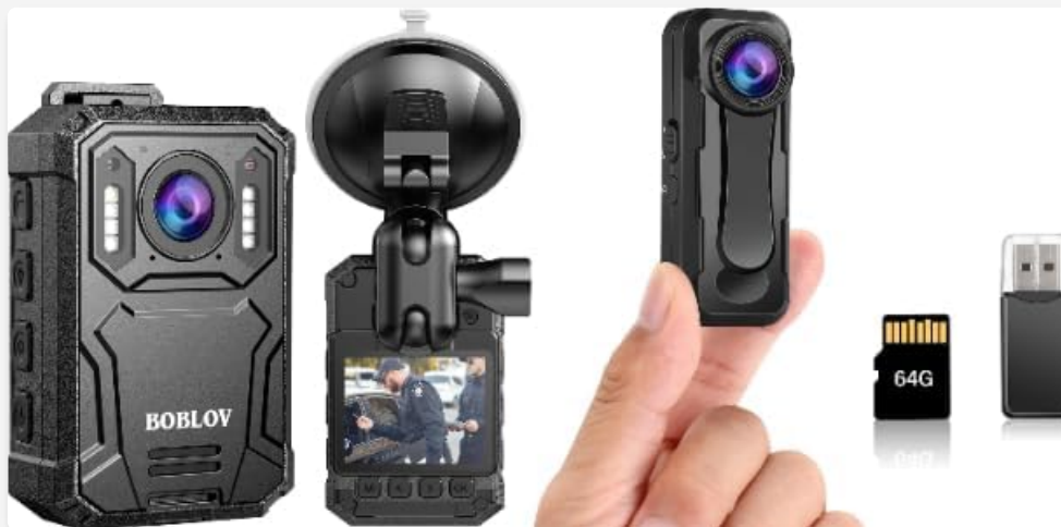
Figure 1.1: The BOBLOV KJ23Pro (left) and W1 (right) body cameras, along with a 64GB microSD card and USB adapter.

This manual provides detailed instructions for the operation and maintenance of your BOBLOV KJ23Pro and W1 Body Cameras. These devices are designed for reliable video and audio recording in various professional and personal settings.