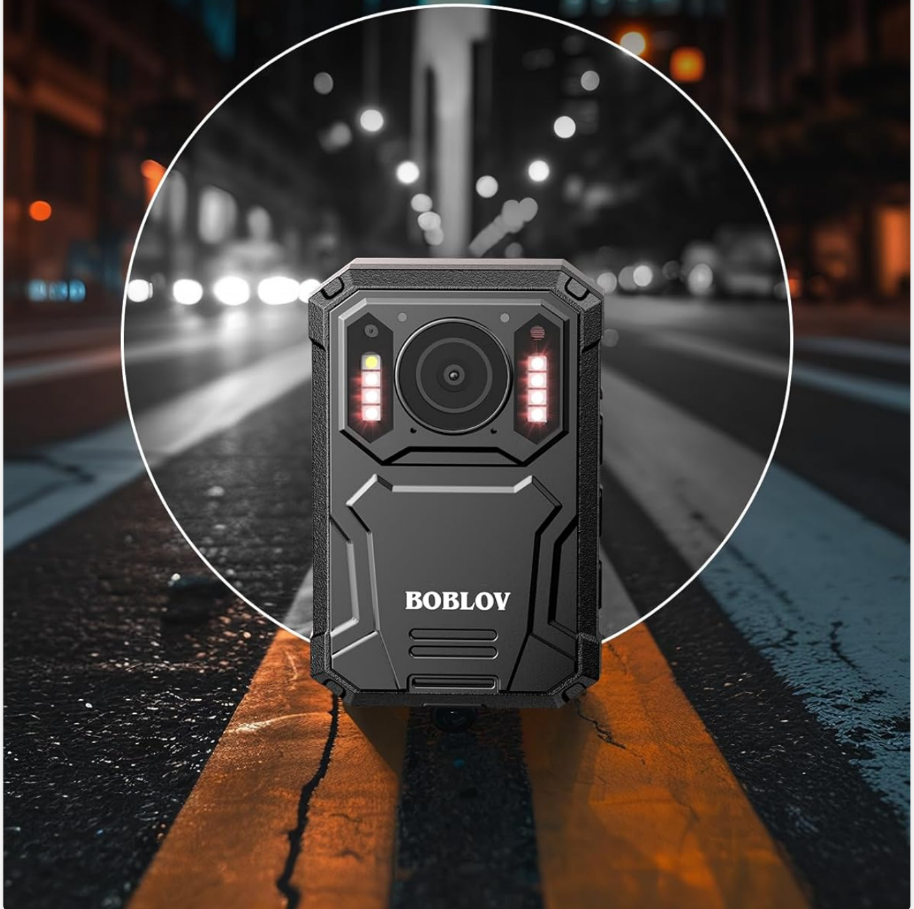
Figure 2.3: The KJ23Pro camera showcasing its night vision capability in a low-light urban setting.

Ensure clear footage in the lowest light conditions.