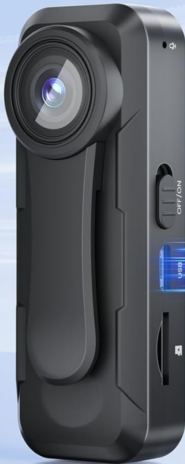
Figure 2.7: The W1 camera highlighting its 90-minute recording time and charging capabilities.