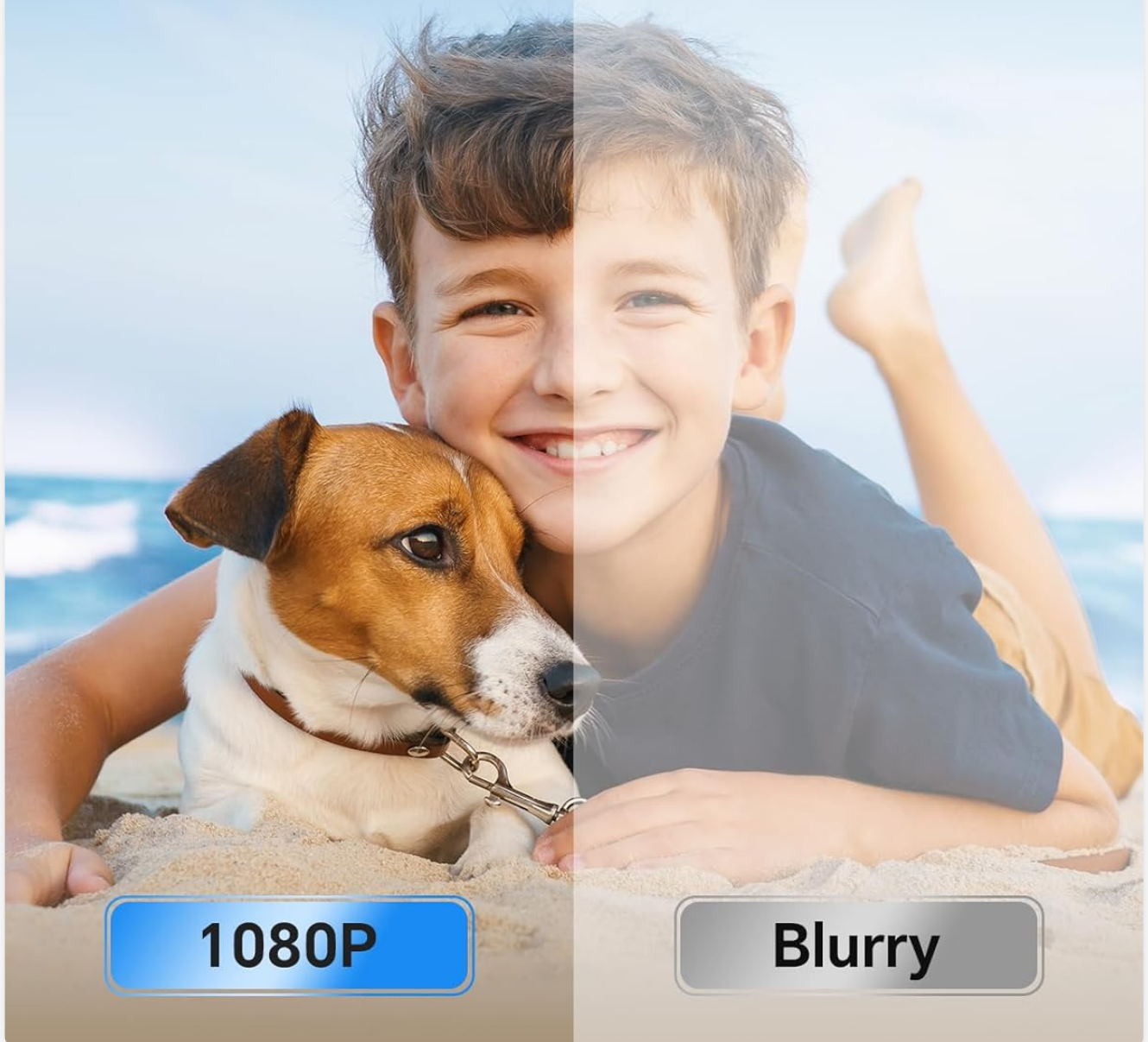
Figure 2.5: The W1 camera demonstrating true 1080P clarity compared to blurry footage.