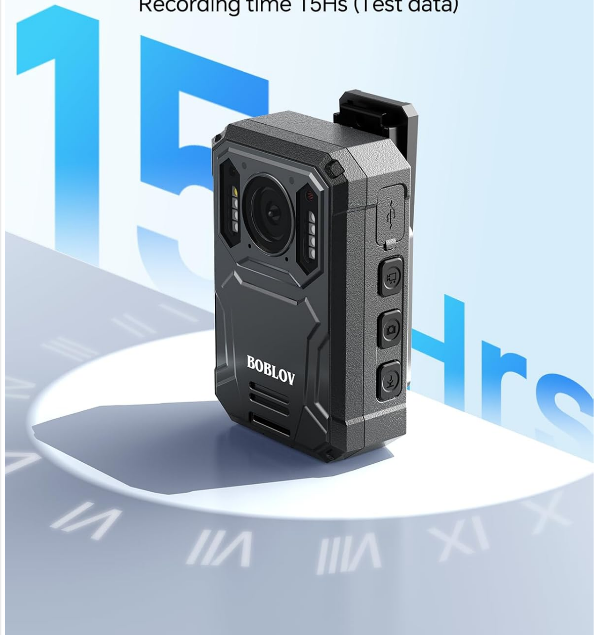
Image: The BOBLOV KJ23Pro camera showcasing its built-in 4000mAh battery, providing up to 15 hours of continuous recording.