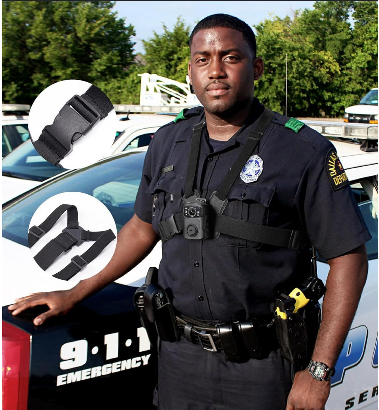
Image: A police officer wearing the BOBLOV KJ23Pro camera with an adjustable chest mount for hands-free recording.

Comfortable Wearable Chest Strap with Snap