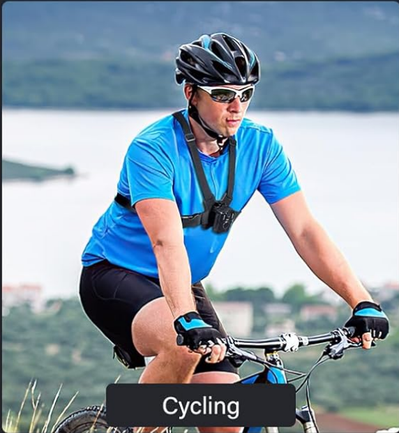
Image: Various uses of the wearable dual shoulder mount, including for patrolling, walking pets, evidence collection, and cycling.

Your browser does not support the video tag.