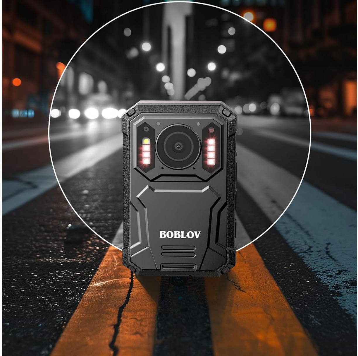
Image: The BOBLOV KJ23Pro camera highlighting its night vision capability, ensuring clear footage in low-light conditions.

Ensure clear footage in the lowest light conditions.