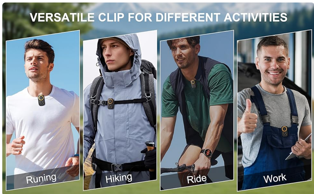
Image 4.2: This image displays several people participating in different activities such as running, hiking, biking, and working, each with the GOTOOLZ WS-16 speaker conveniently clipped to their attire, emphasizing its versatility and portability for various lifestyles.