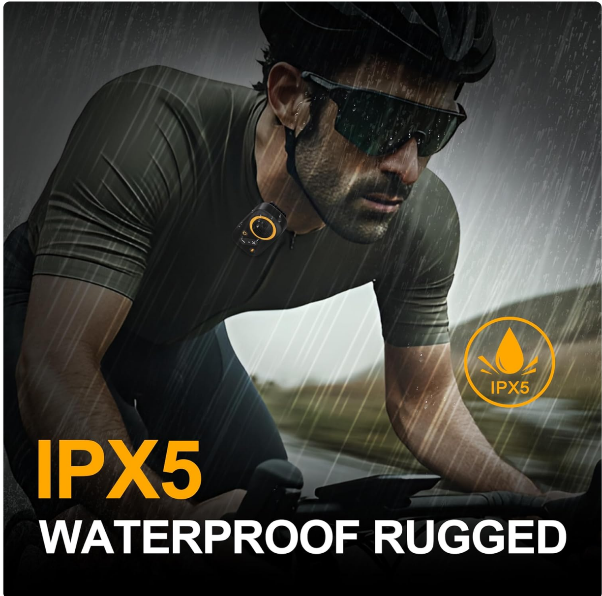
Image 5.1: A cyclist is shown riding in the rain while wearing the GOTOOLZ WS-16 speaker, accompanied by an IPX5 waterproof icon, illustrating the speaker's resistance to water splashes and suitability for outdoor activities.

The WS-16 speaker is IPX5 rated, meaning it is protected against low-pressure water jets from any direction. It can resist light water spray and splashes, making it suitable for outdoor use in light rain or near water. Do not partially or fully submerge the speaker in water.