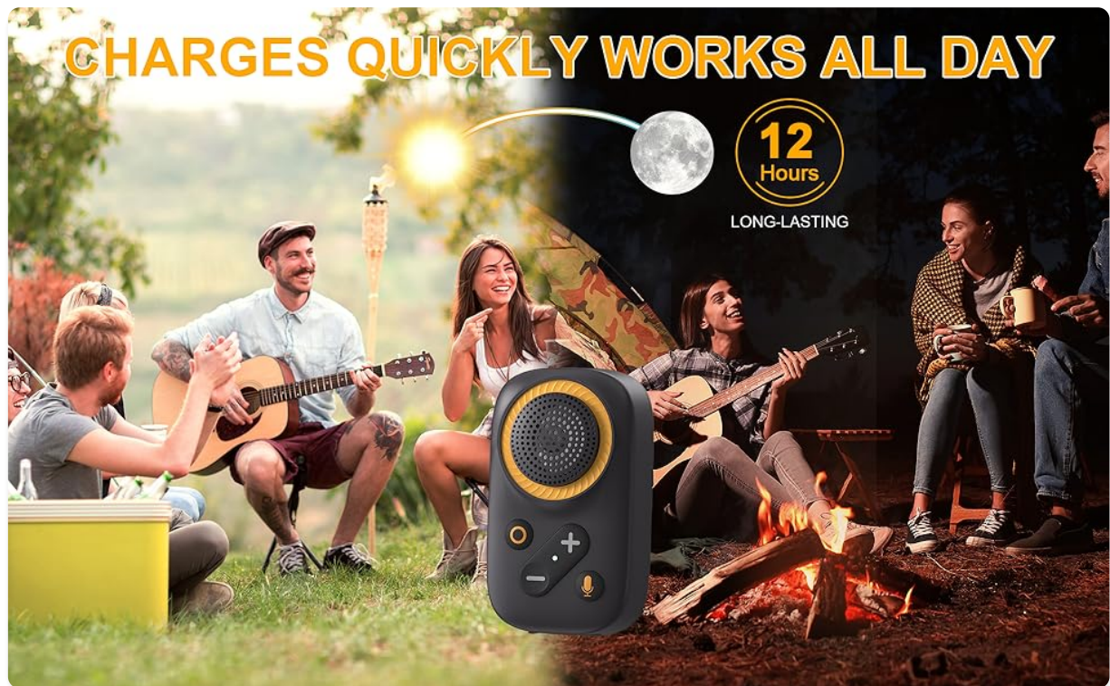
Image 5.2: The GOTOOZ WS-16 speaker is depicted in a vibrant outdoor scene with people enjoying themselves, emphasizing its extended 12-hour playtime, suitable for prolonged use during various activities.