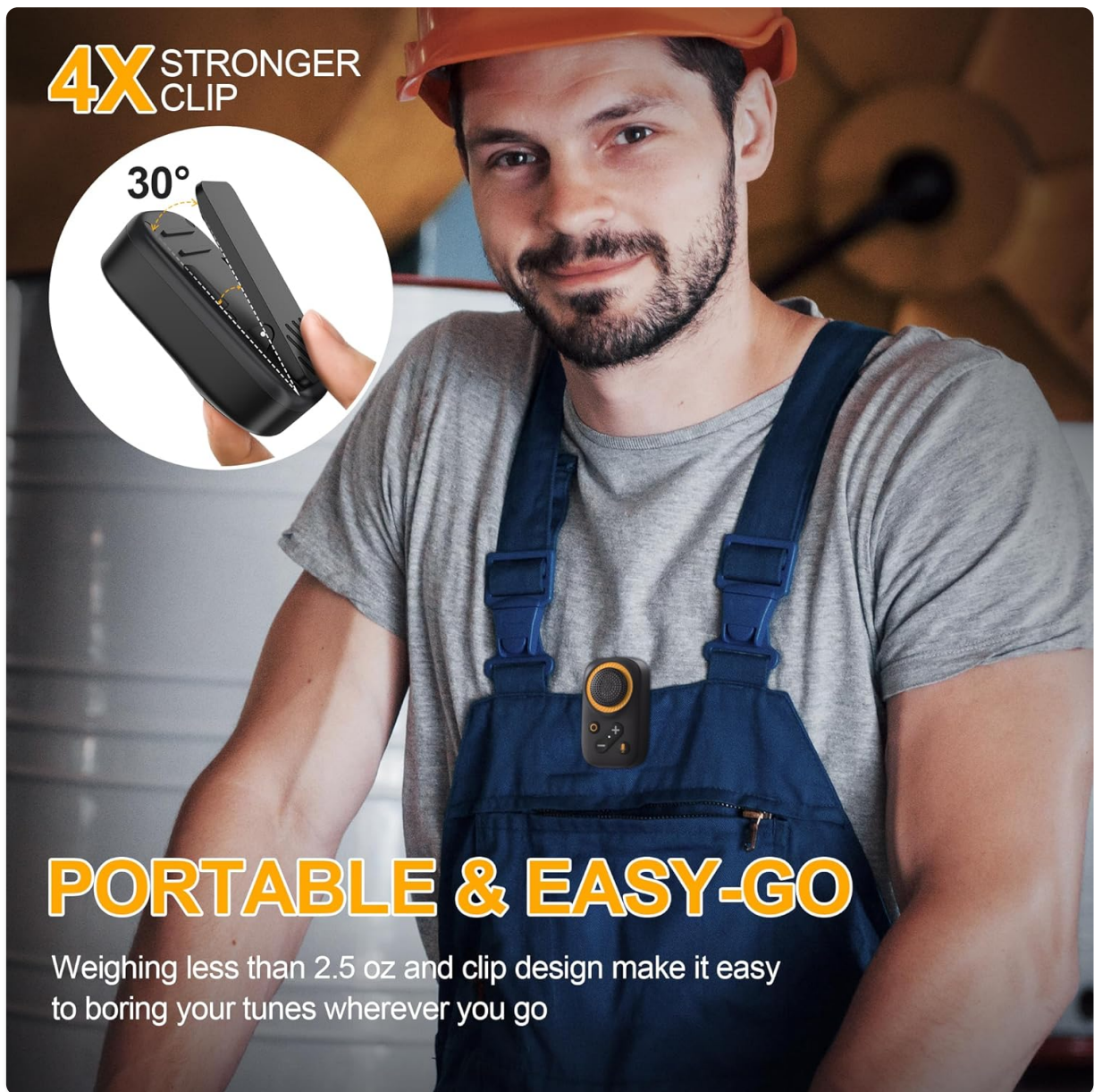
Image 2.1: Front and side view of the GOTOOLZ WS-16 Wearable Bluetooth Speaker, highlighting its compact design and clip mechanism.