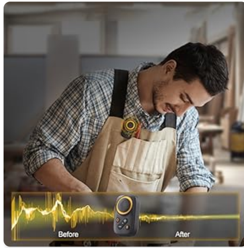
Image 4.1: A man is shown working while using the GOTOOLZ WS-16 speaker clipped to his shirt, demonstrating its hands-free calling capability with a visual representation of noise reduction for clear voice transmission.