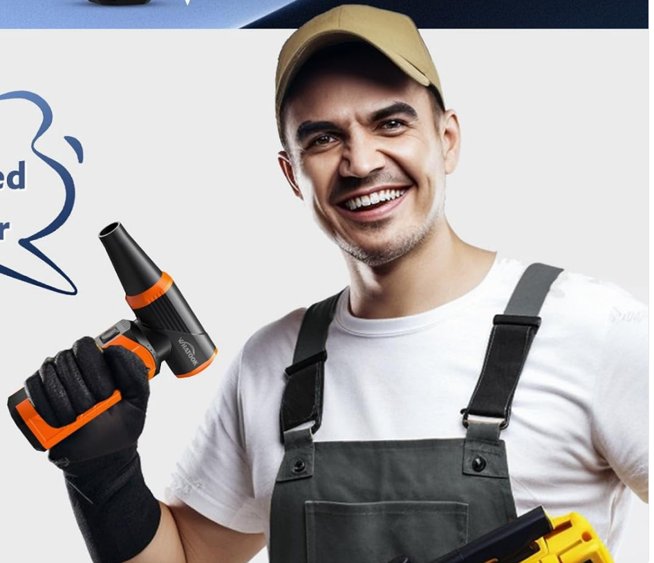
Figure 4: Versatile Applications