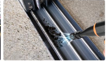
Figure 8: Brush Nozzle Applications