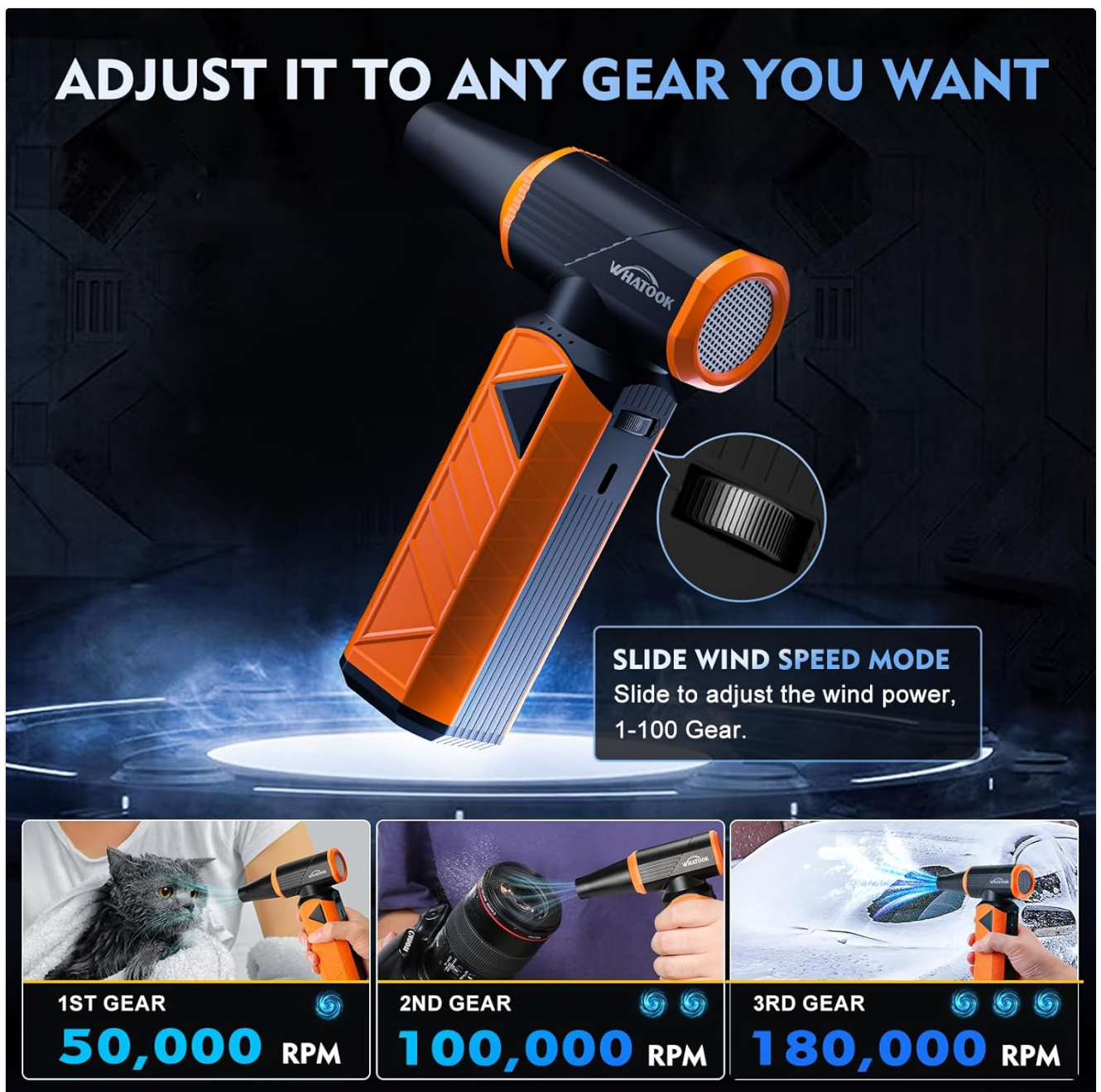
Figure 3: Adjustable Speed Modes