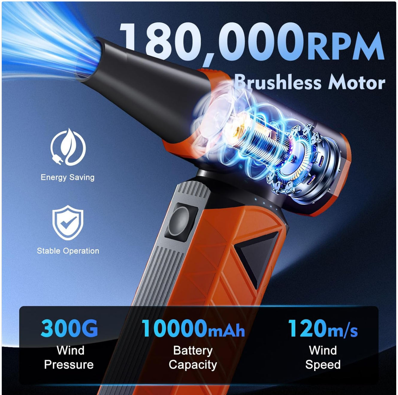
Figure 2: Powerful Performance Metrics