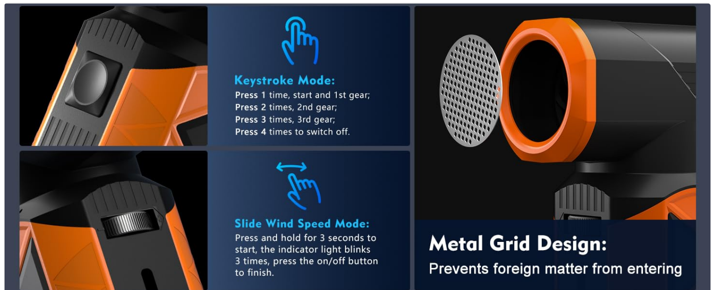
Figure 9: Control Modes and Metal Grid Design