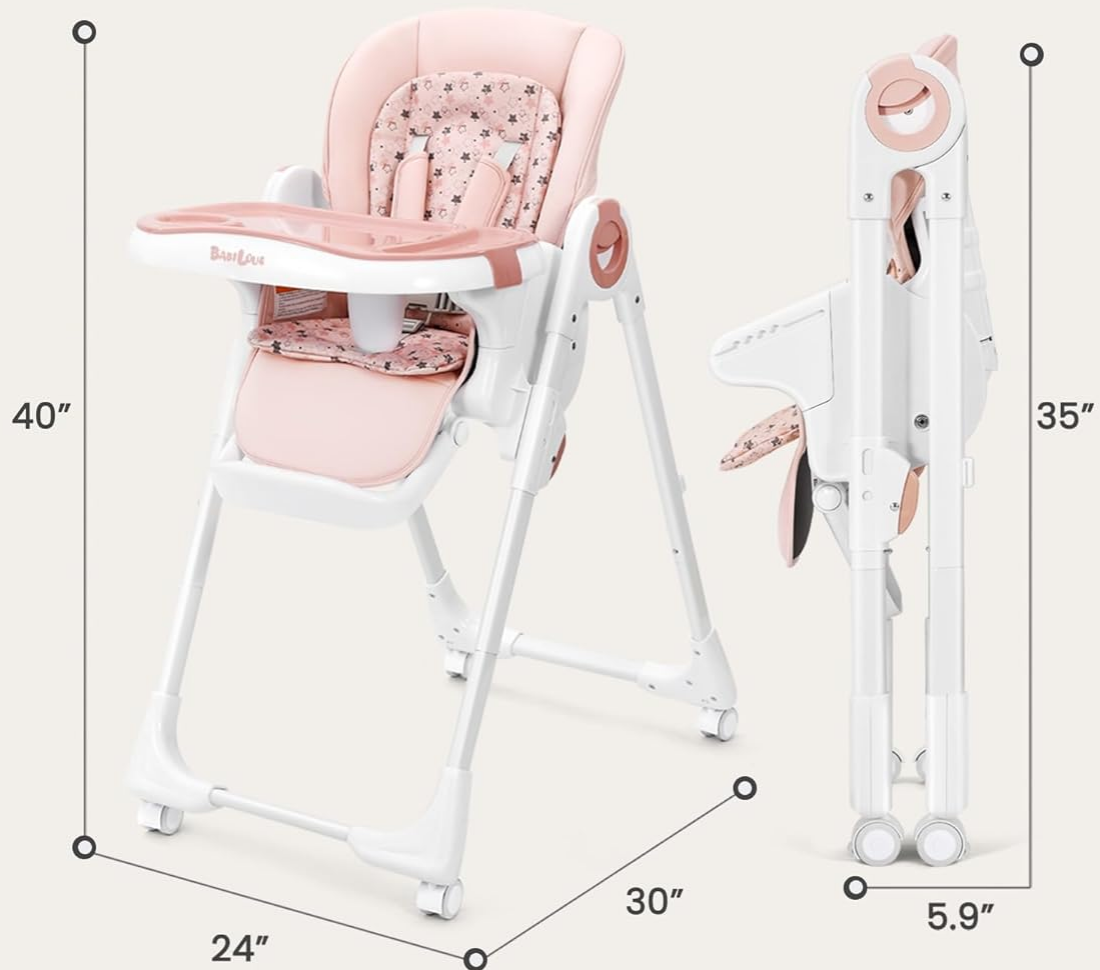
Figure 7: The high chair folds compactly for easy storage, fitting into narrow spaces.