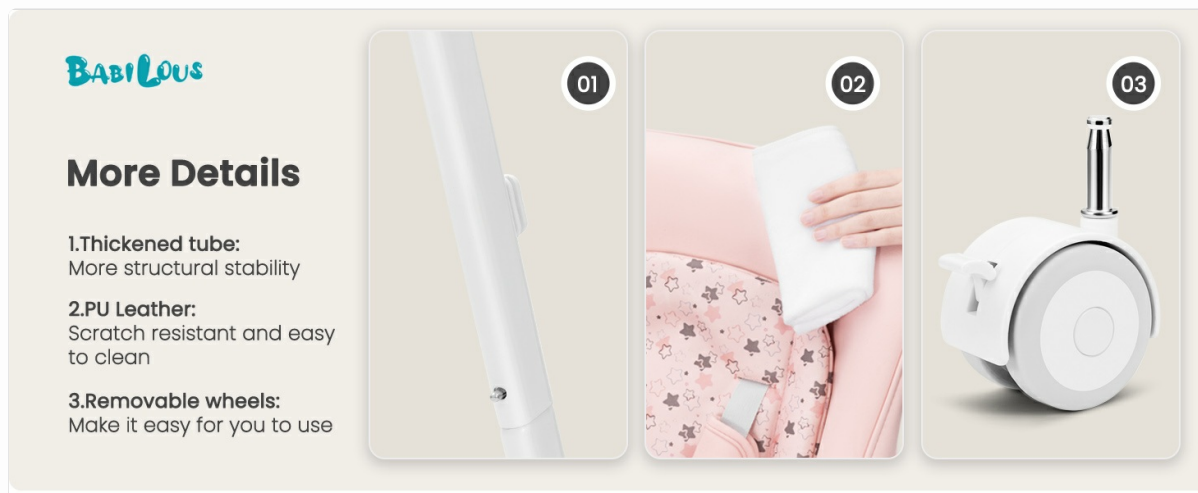
Figure 2: Close-up of key components such as the thickened tube for stability, PU leather material, and removable wheels for convenience.