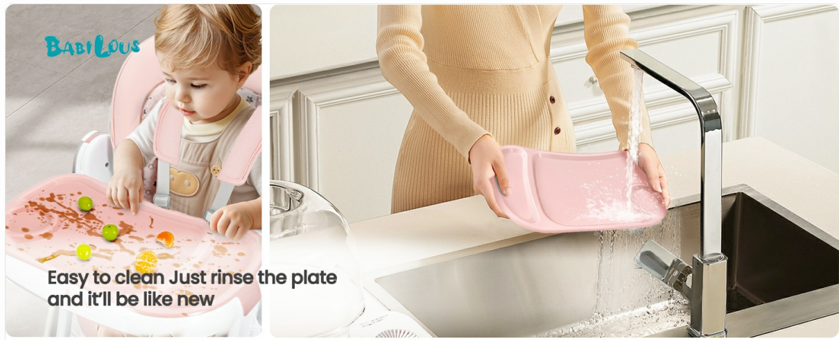
Figure 6: The removable tray is easy to clean, simply rinse under water or place in a dishwasher.