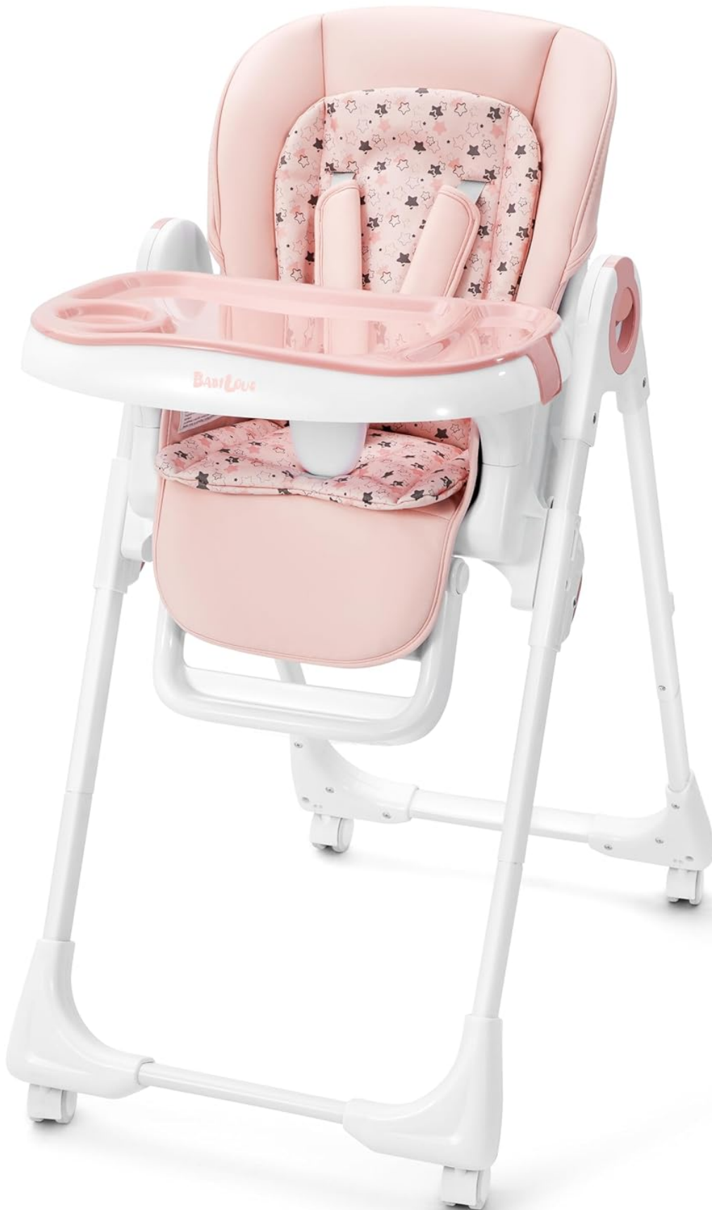
Figure 1: Babilous Foldable High Chair, Star Pink model, showcasing its full setup with tray and cushion.