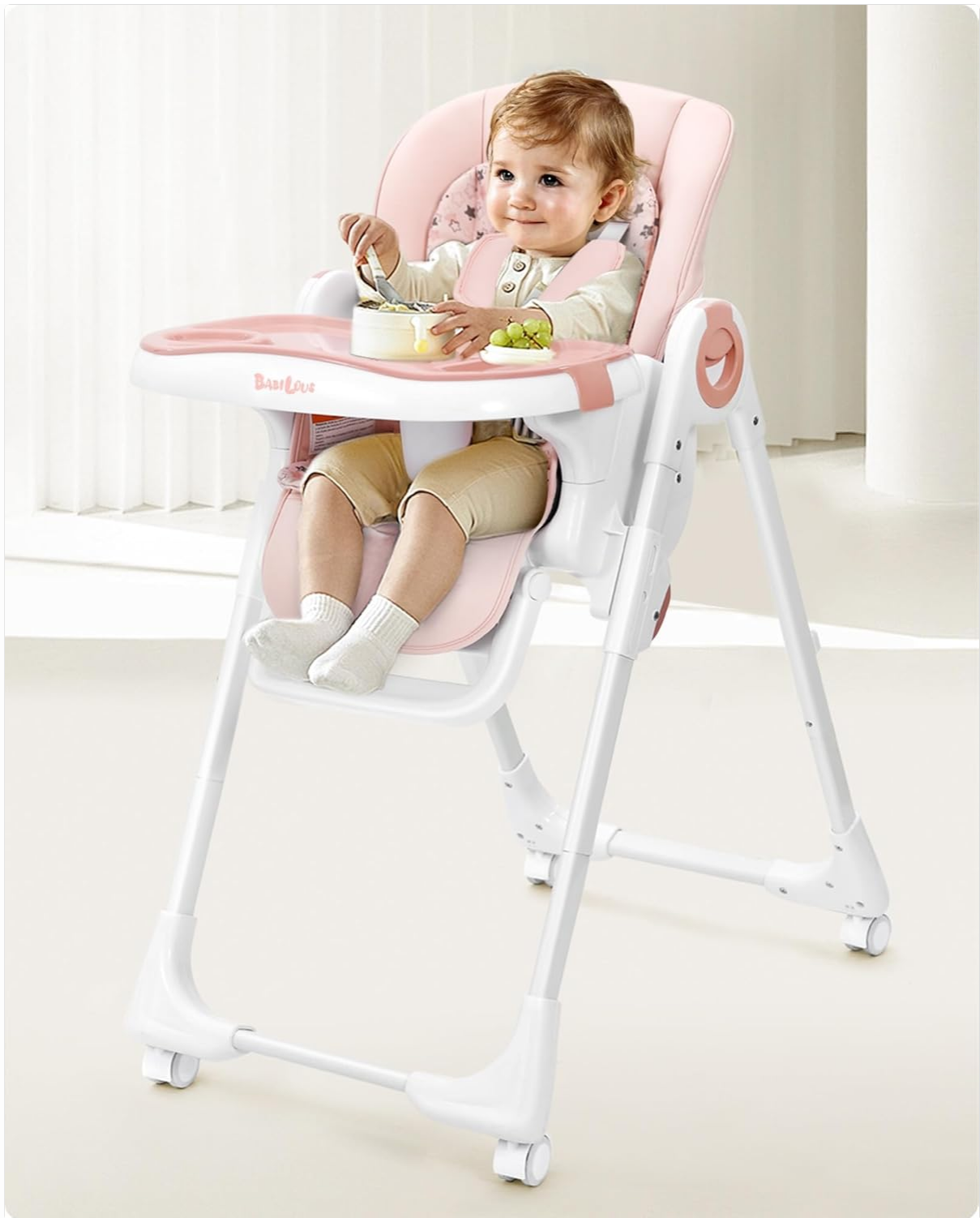
Figure 5: The dual-layer removable dinner tray, with an upper section for meals and a lower section for play.