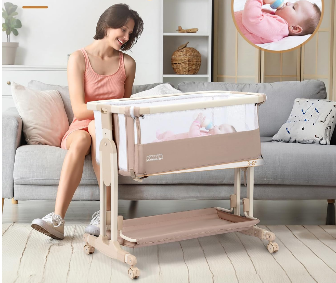
Figure 9: The spacious storage basket.