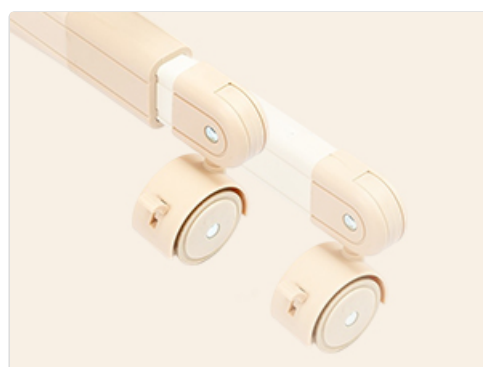
Figure 7: Detail of the wheel with brake.