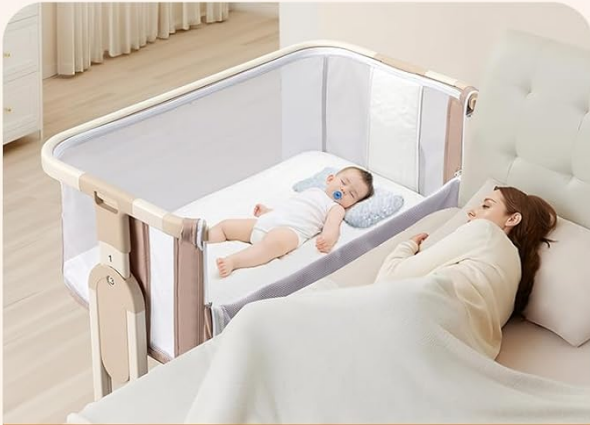
Bedside Co-Sleeping Bassinet