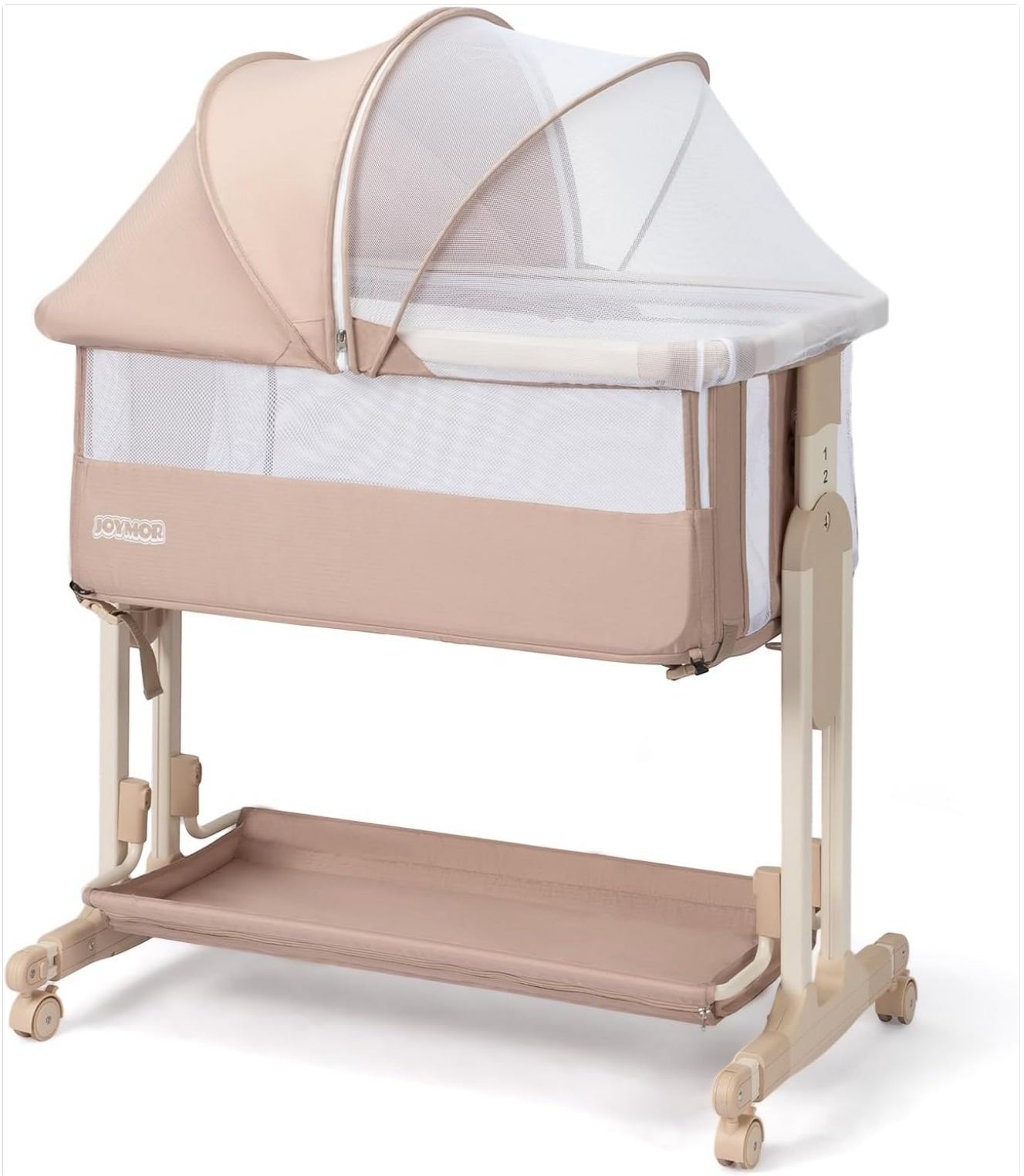
Figure 1: Fully assembled JOYMOR Baby Bassinet with mosquito net.