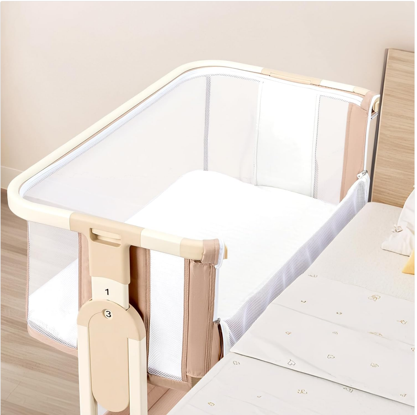
Figure 10: Bassinet dimensions.