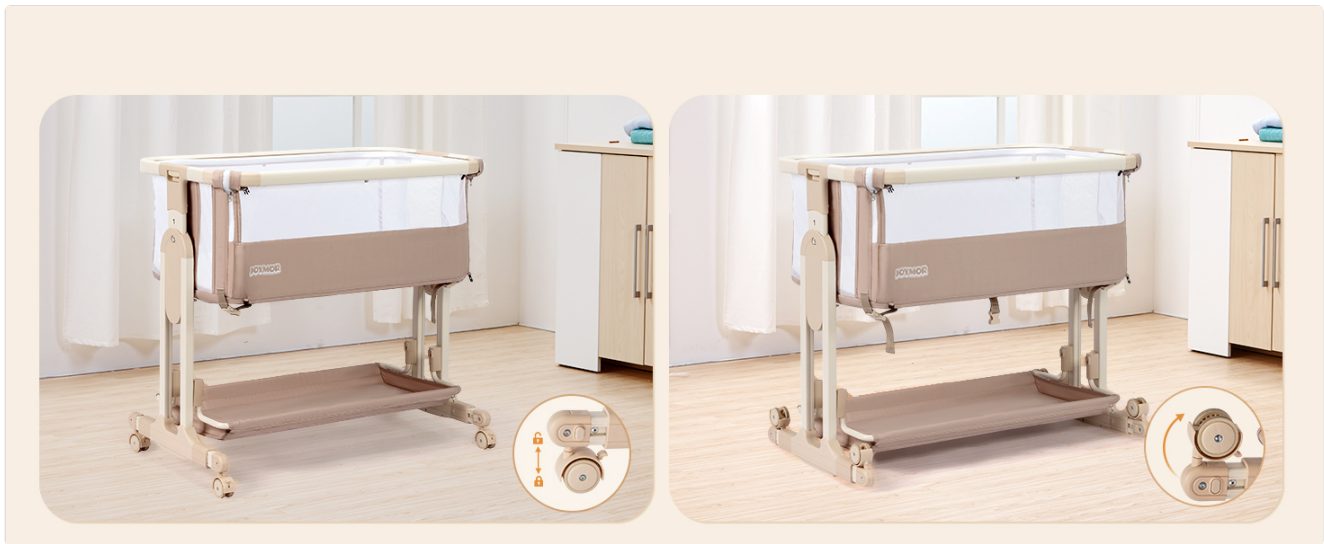
Figure 3: Bassinet in stationary and rocking configurations.