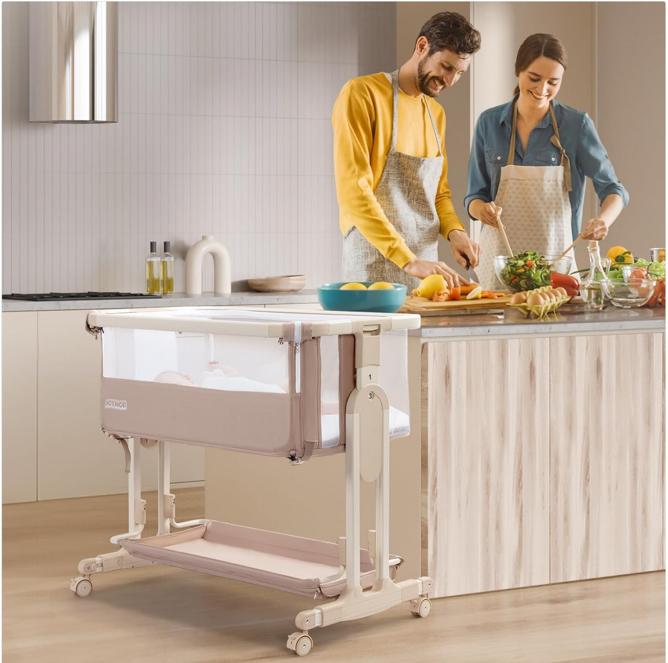
Figure 8: Bassinet in incline mode for reflux prevention.