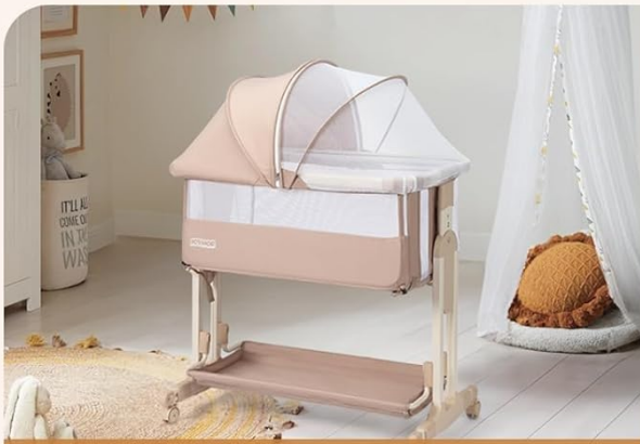
baby bed with mosquito net