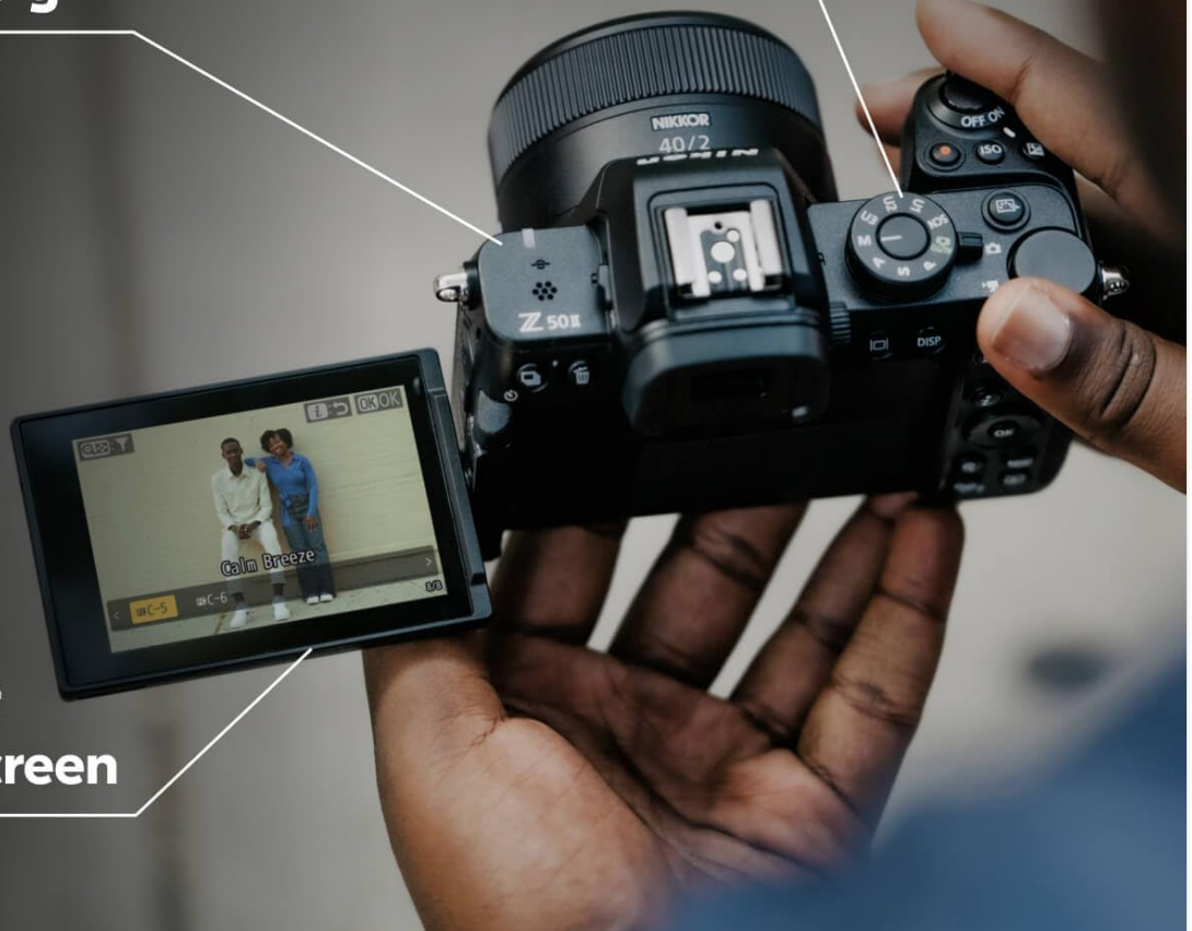
Figure 7: Download creative color presets to your camera from Nikon Imaging Cloud.