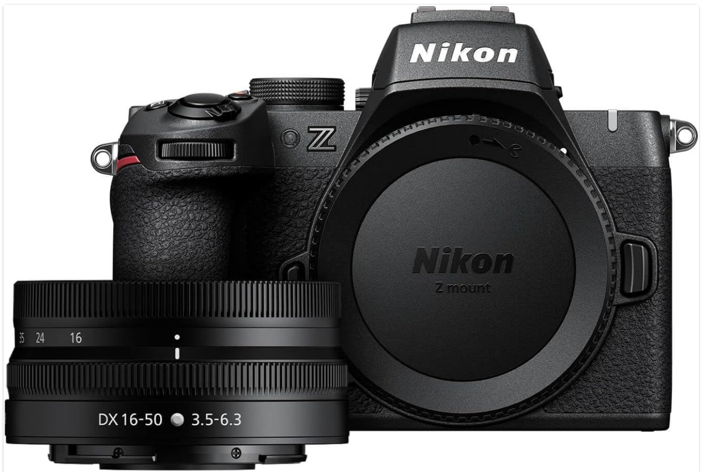
Figure 2: Nikon Z50 II camera body and NIKKOR Z DX 16-50mm lens.