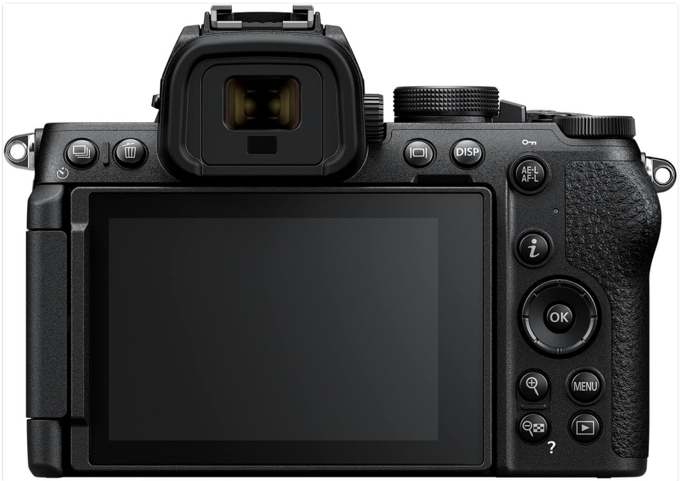
Figure 3: Rear controls and flip-out touchscreen of the Nikon Z50 II.