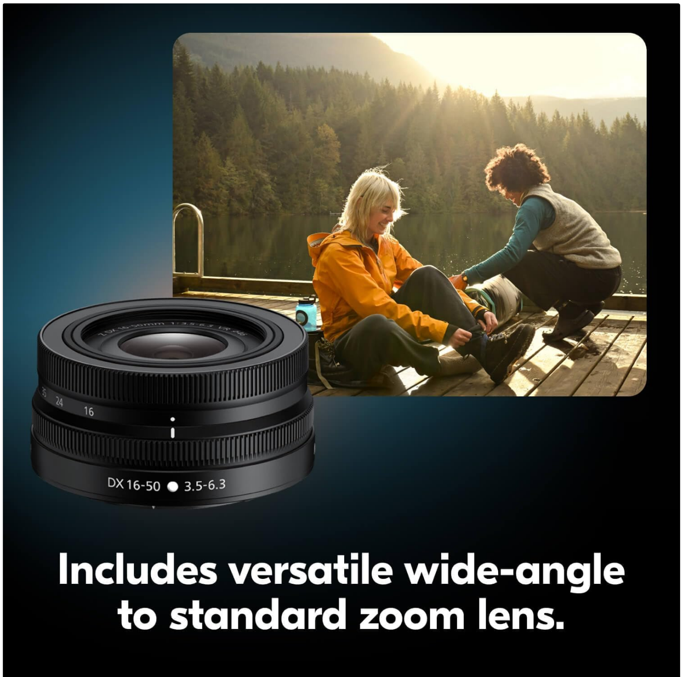
Figure 1: Included components of the Nikon Z50 II w/16-50 Kit.