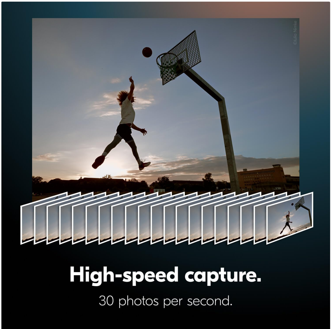
Figure 8: Powerful video features of the Nikon Z50 II.