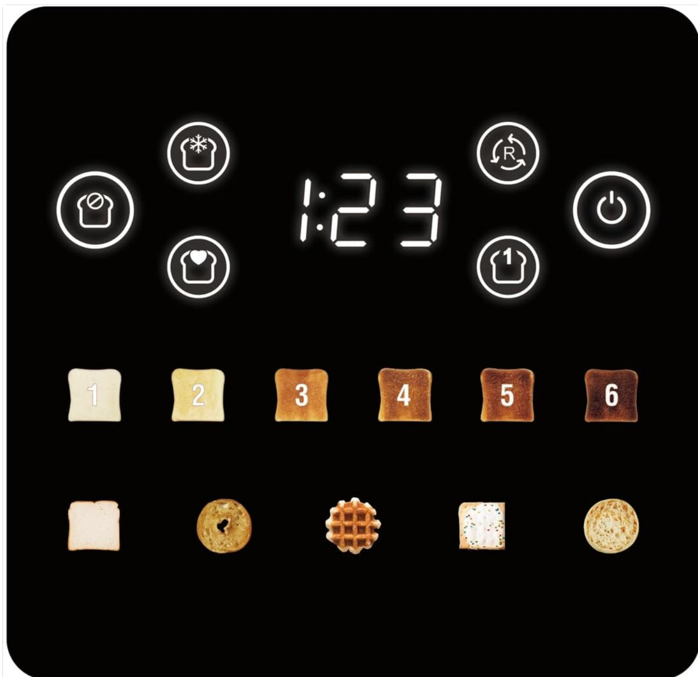
Figure 5: Detailed view of the touchscreen interface, displaying the six shade settings and various function icons for different toasting modes.