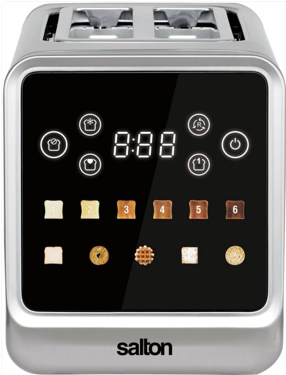
Figure 2: Front view of the toaster highlighting the intuitive touchscreen display with its various function icons and shade settings.