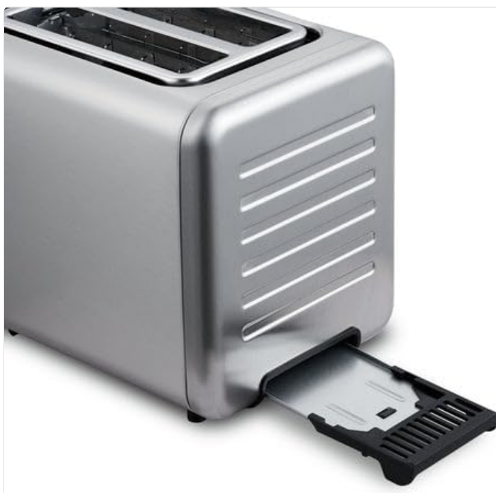
Figure 4: The removable crumb tray, located at the back of the toaster, shown partially extracted for cleaning.