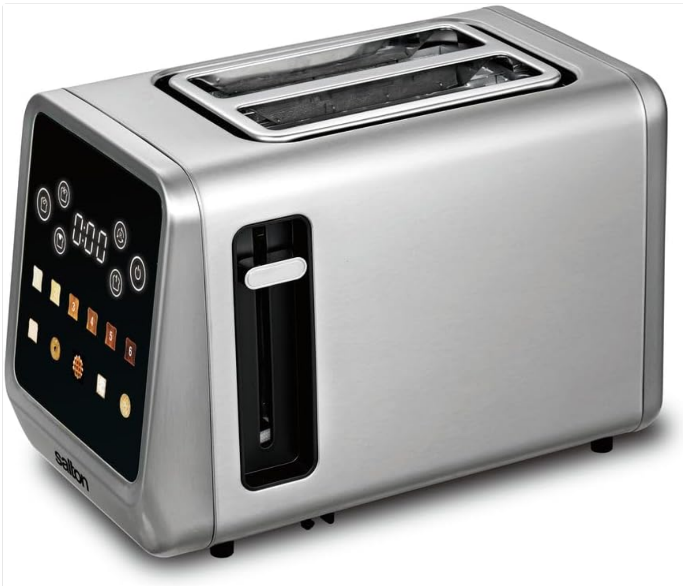
Figure 3: Angled view of the toaster, illustrating the control lever on the side and the touchscreen interface.