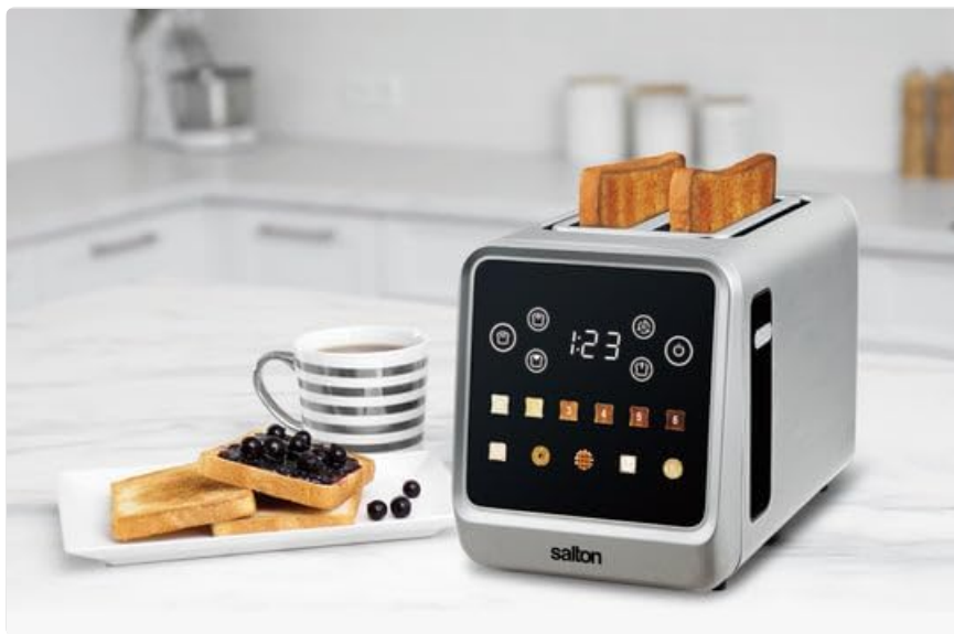
Figure 1: The Salton Touchscreen Toaster, a 2-slice model, shown in a kitchen setting with toasted bread and a beverage.

Thank you for choosing the Salton Touchscreen Toaster. This manual provides essential information for the safe and efficient operation, maintenance, and troubleshooting of your new appliance. Please read it thoroughly before first use and retain it for future reference.