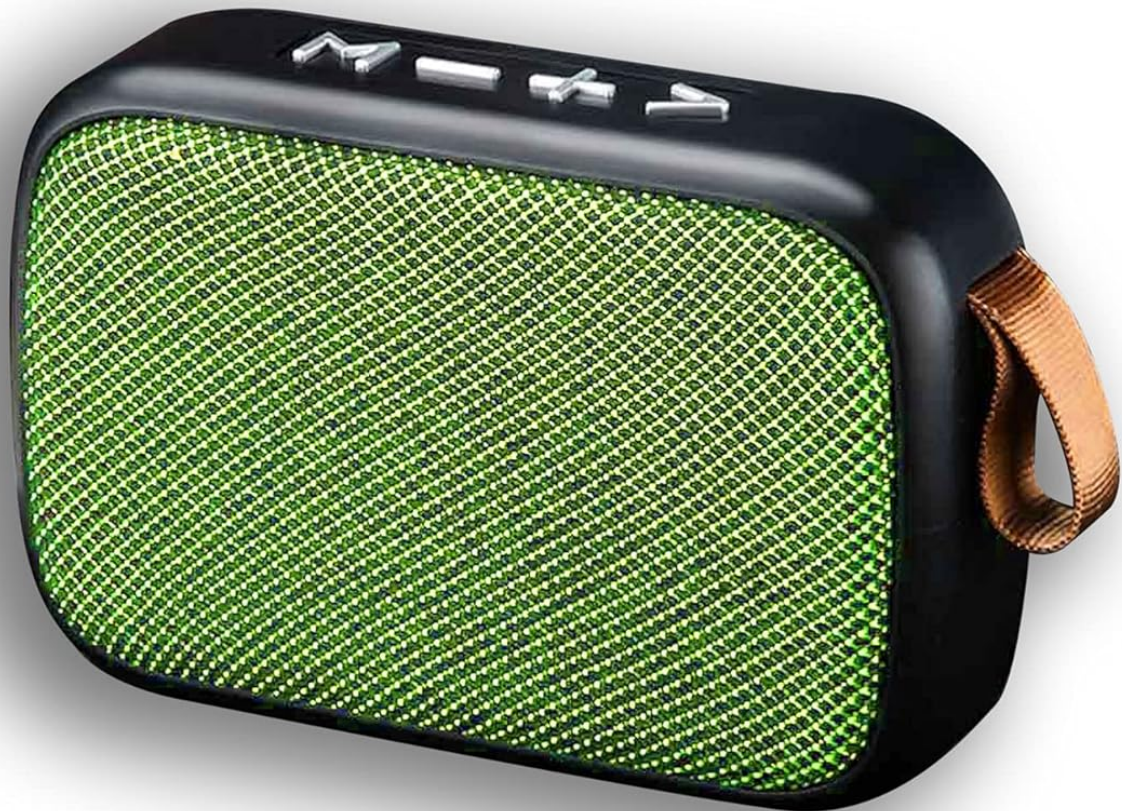
Image: Visual representation of the speaker's universal features, including Bluetooth 4.2, hands-free calling, TF card support, FM radio, and durable ABS+Fabric construction.