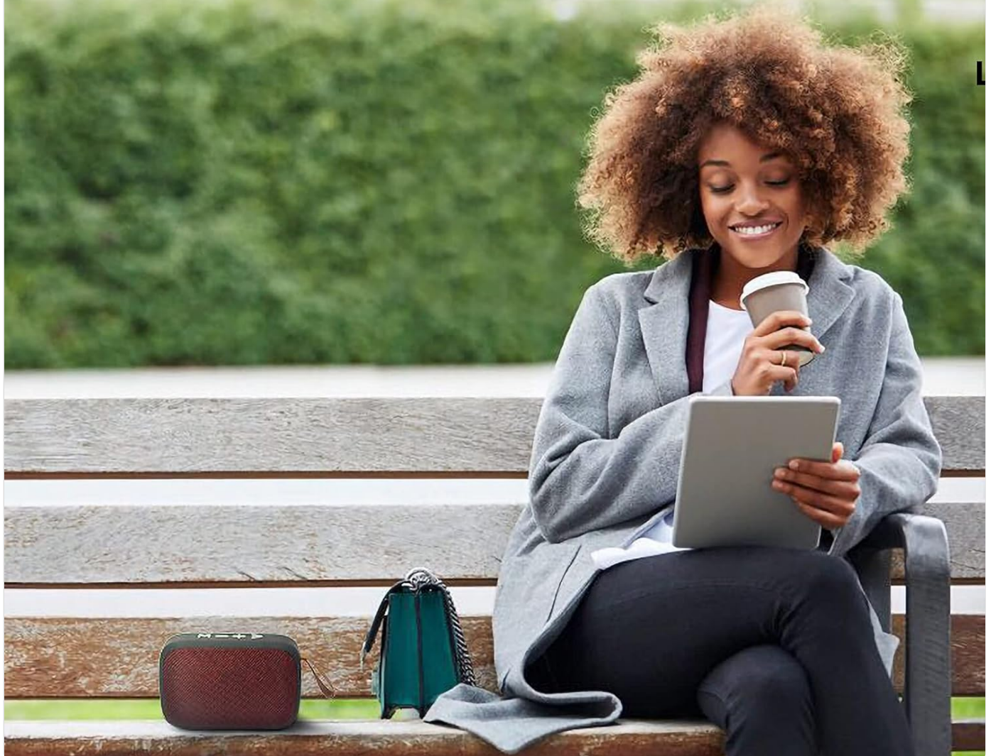
Image: The Tek Styz Portable Bluetooth Speaker is designed for portability, allowing use in various settings such as a park.