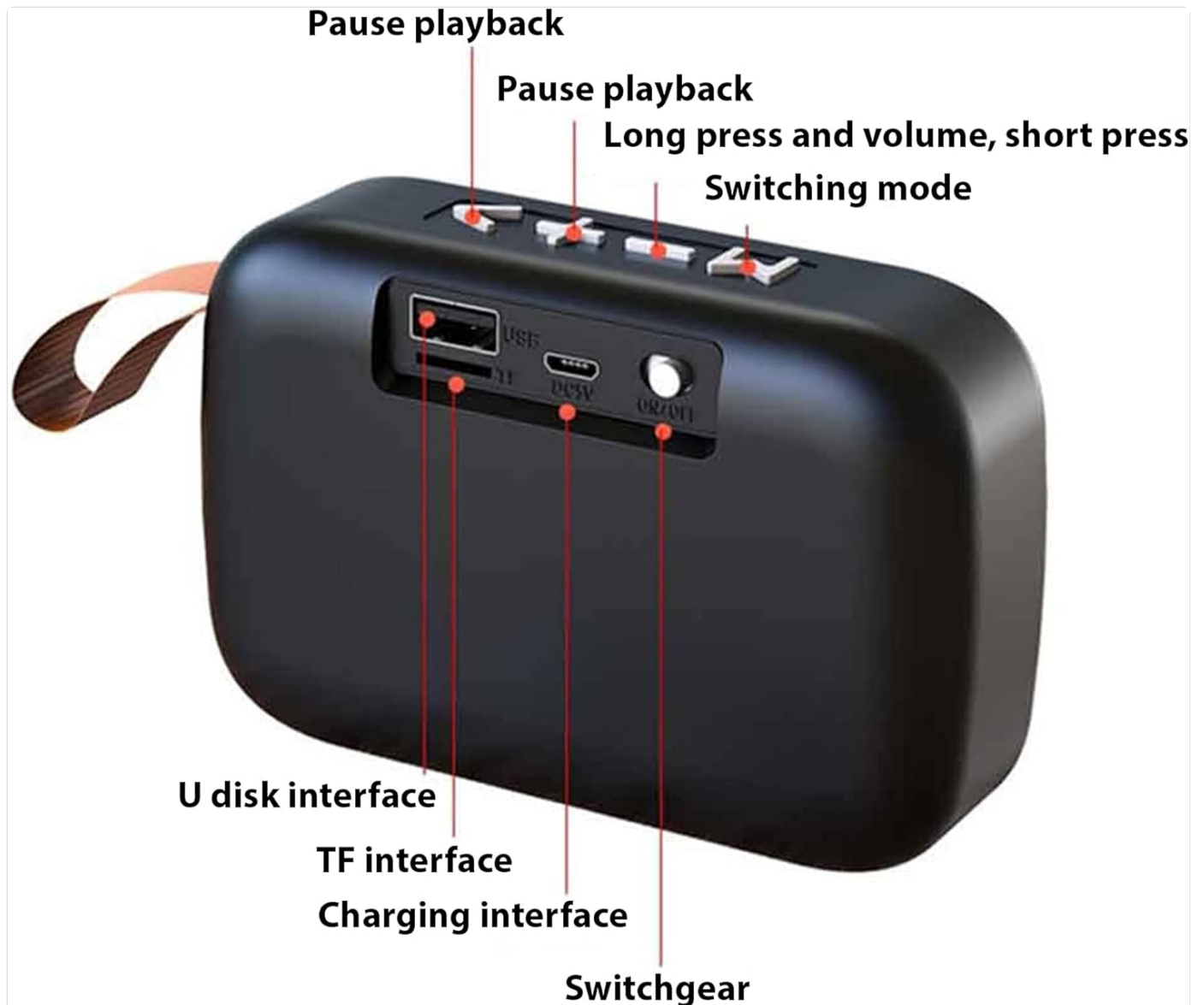
Image: Detailed view of the speaker's rear panel, highlighting the U disk interface, TF card slot, charging interface, and the power switch. The top panel shows buttons for pause/playback, volume control, and mode switching.