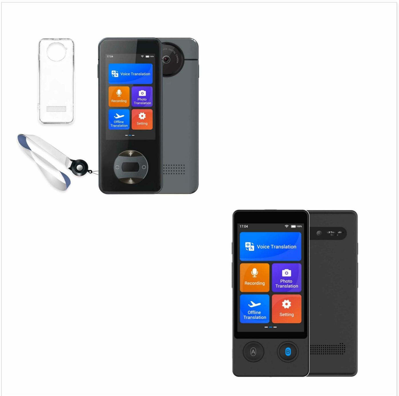
Image: Main screen interface displaying various translation functions.