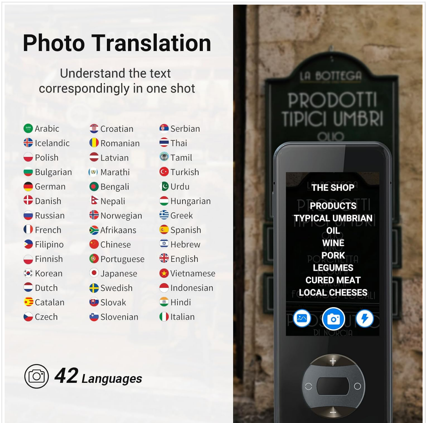
Image: Photo translation feature in action, showing supported languages.