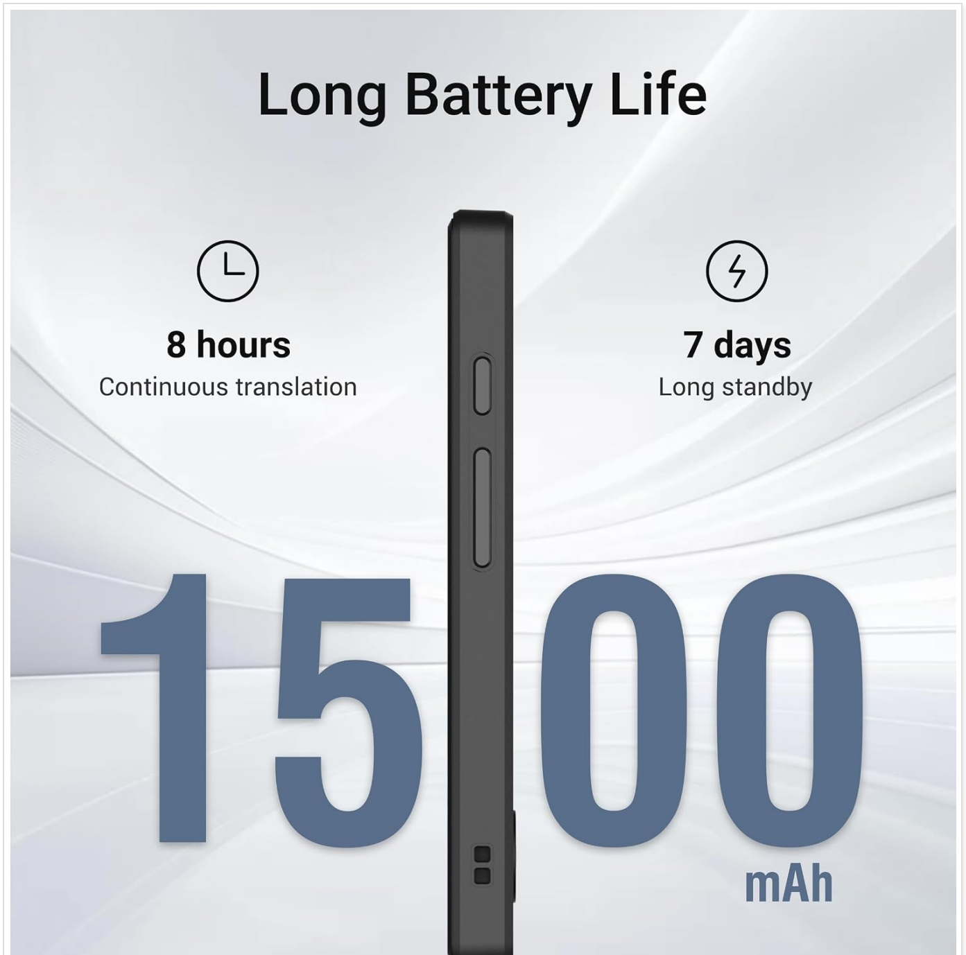
Image: Device highlighting its 1500 mAh battery capacity and long battery life.

Before first use, fully charge the translator. Connect the device to a power source using the provided USB cable. The battery indicator on the screen will show charging status. A full charge typically takes a few hours.