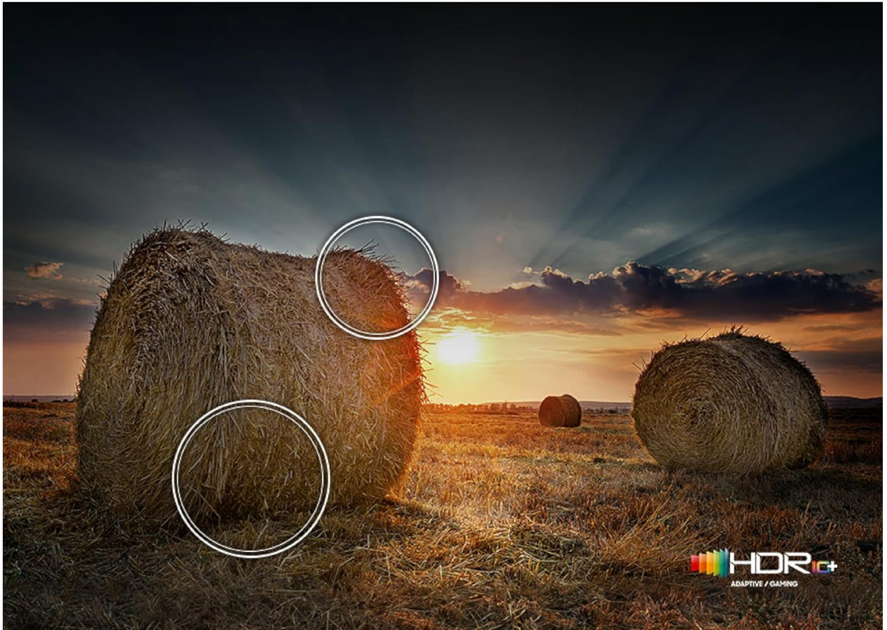
Image 5.3: The TV screen illustrating distinct contrast and optimized imagery with Quantum HDR.

View a range of color, contrast and detail. You'll get beautifully optimized imagery no matter what you're watching.