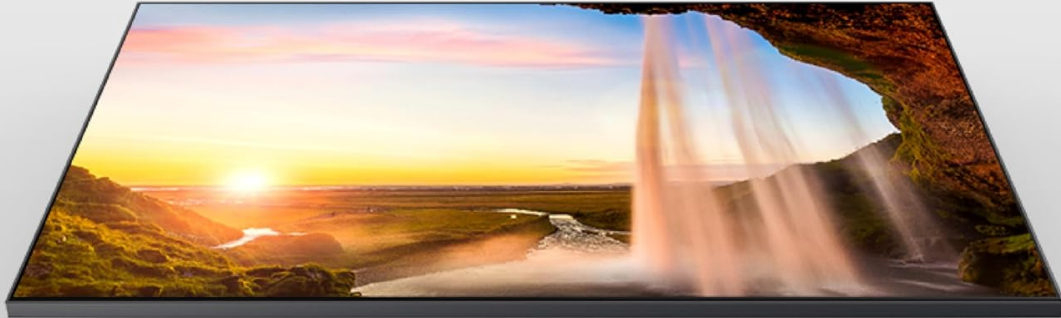
Image 5.1: The TV screen showcasing well-lit details and natural contrast.

Get a natural, realistic picture and accurate contrast with innovative technology that adapts automatically to match your content.