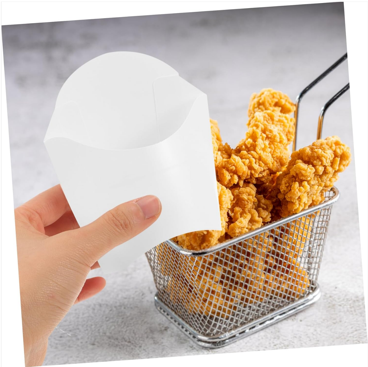
Figure 3.2: The snack box is ready to be filled with items like fried chicken or fries.