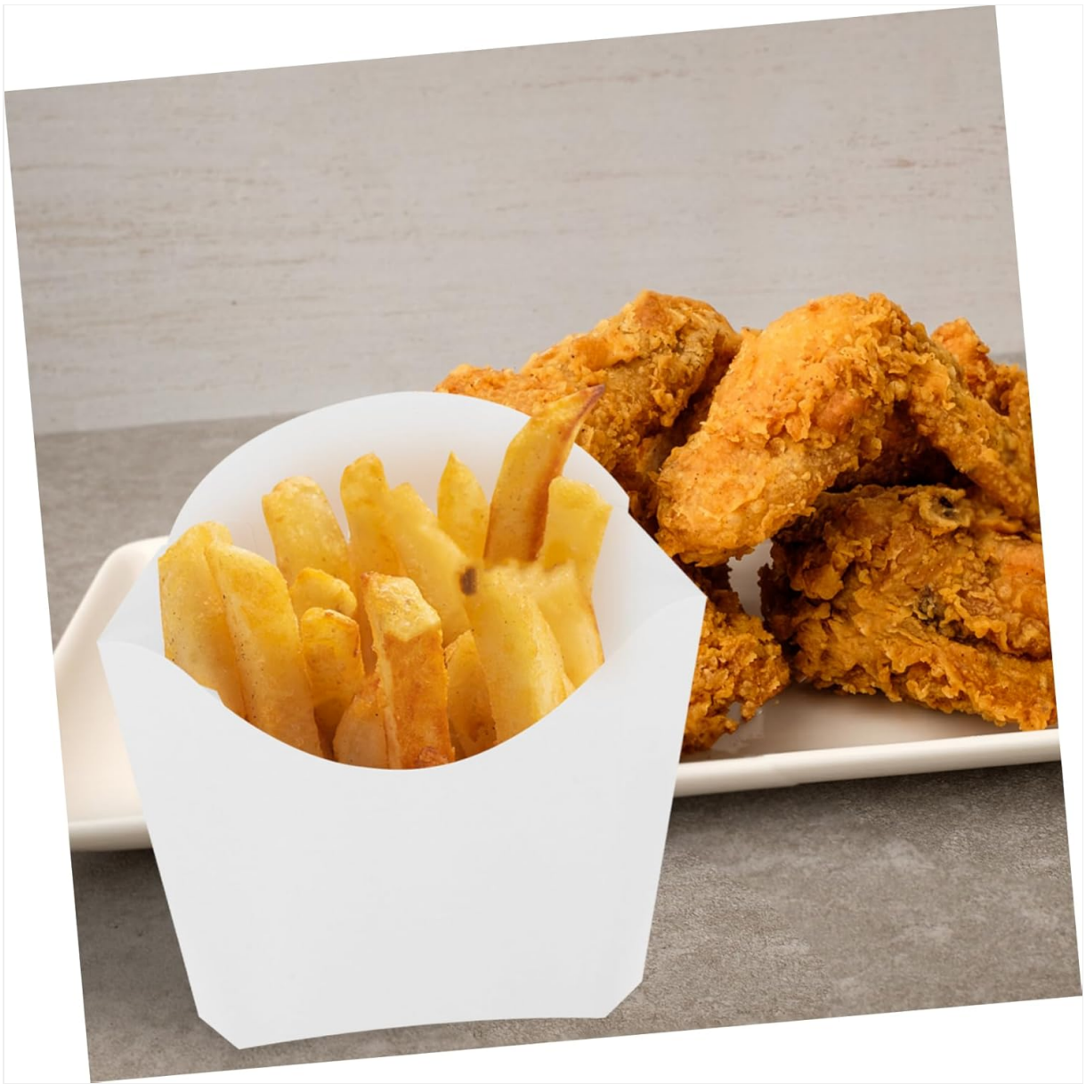
Figure 4.1: A snack box filled with French fries, ready for serving alongside other fried foods.