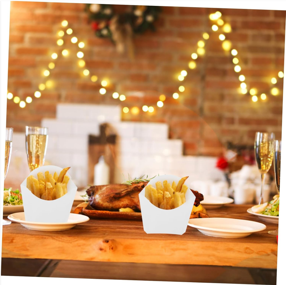
Figure 4.3: Snack boxes used for individual servings at a gathering or party.