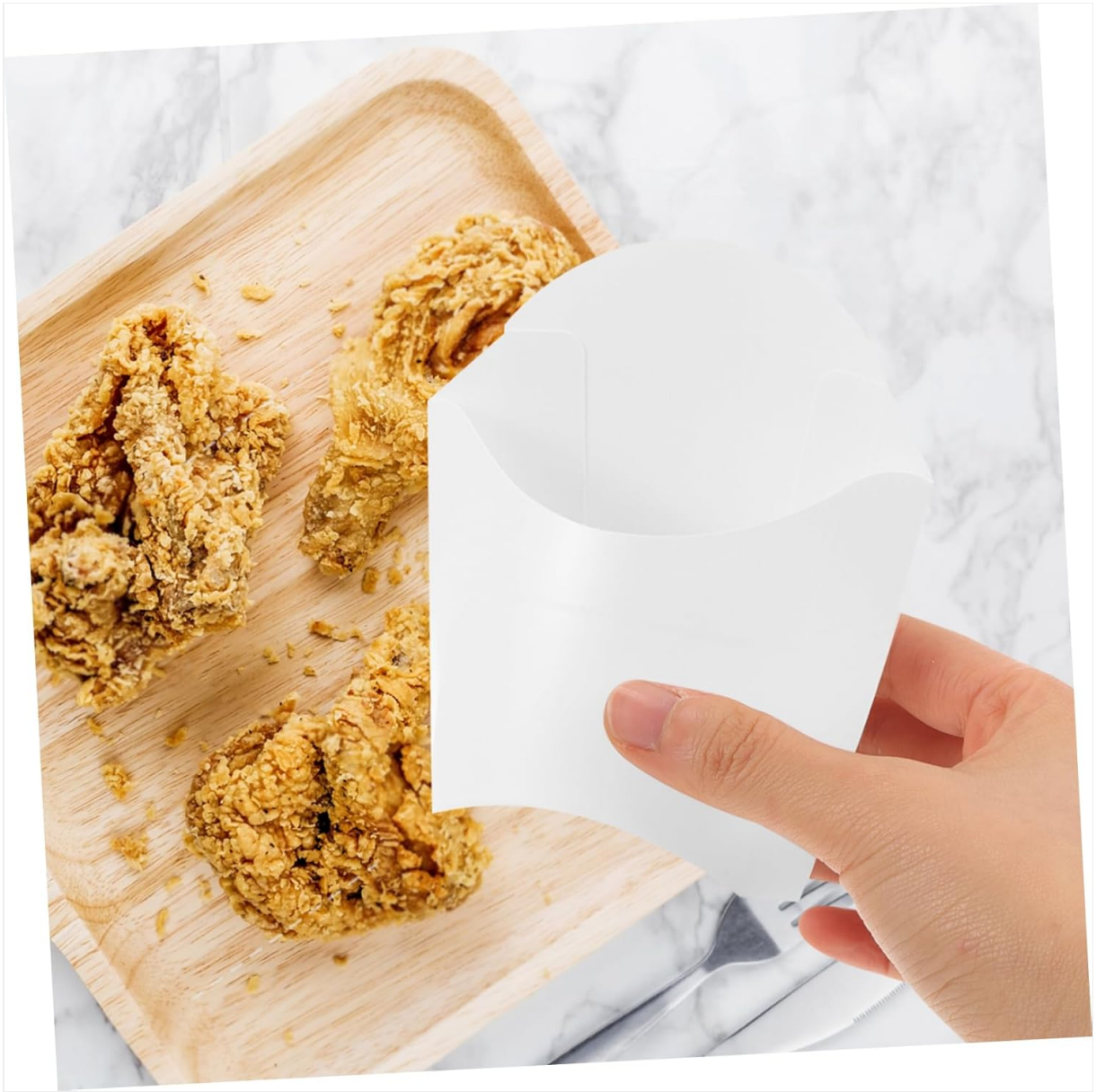
Figure 3.1: Demonstrating how to hold and prepare an empty snack box for filling.