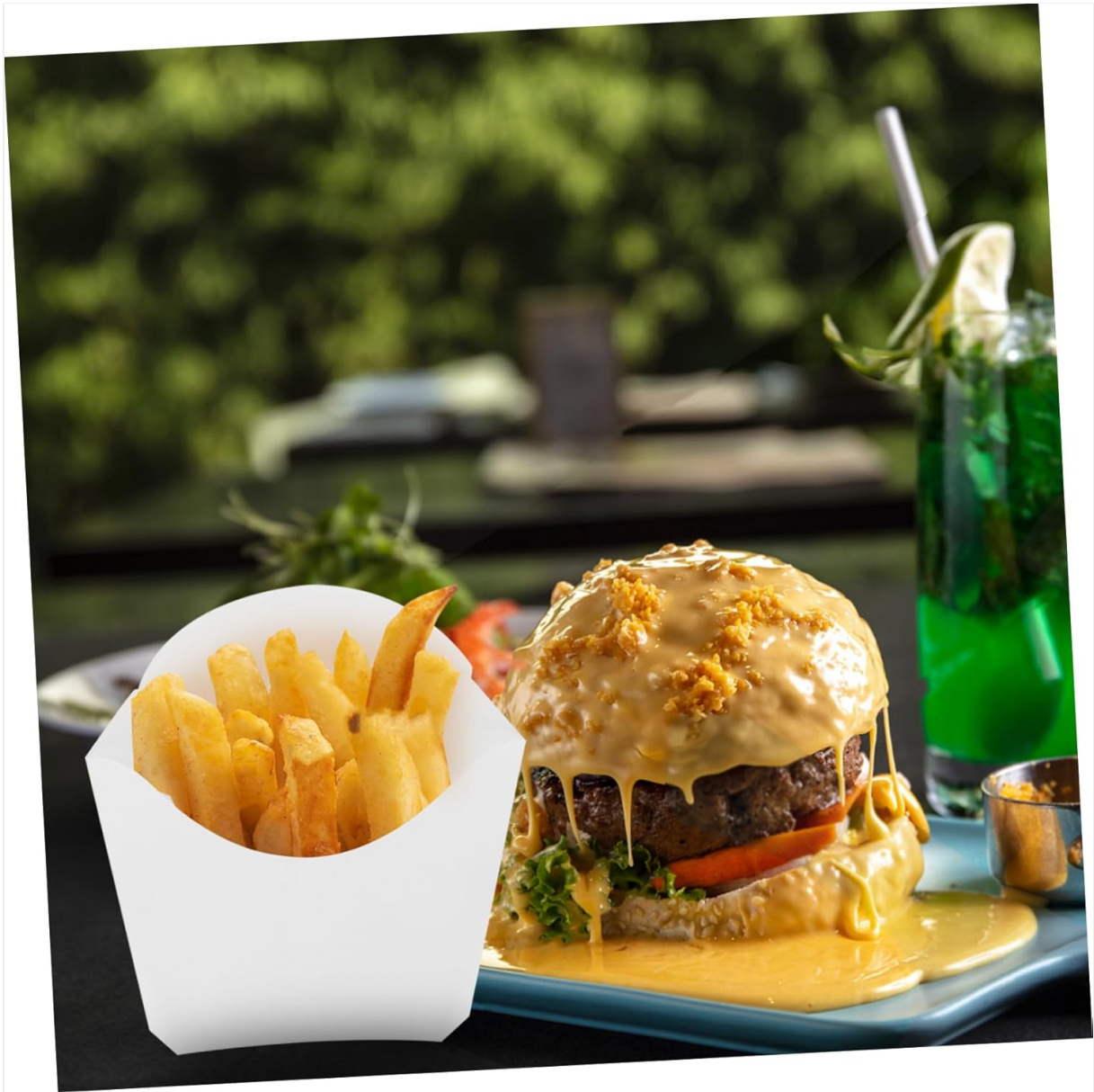
Figure 4.2: The snack box is suitable for individual portions of fries with meals.