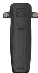
Belt clip x4