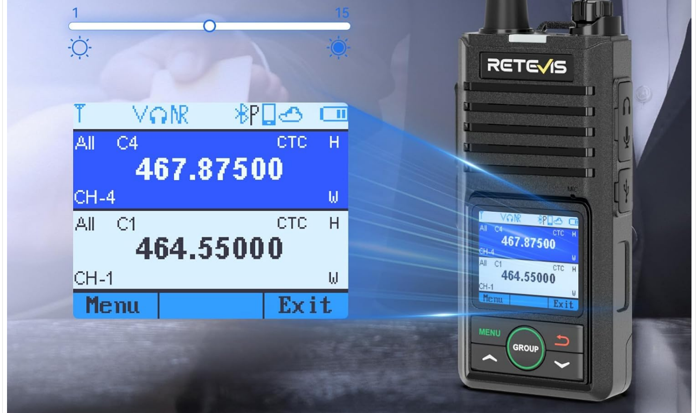
Figure 5.4: 1.77-inch LCD Display

With several buttons and 15-level backlight brightness, increasing operability