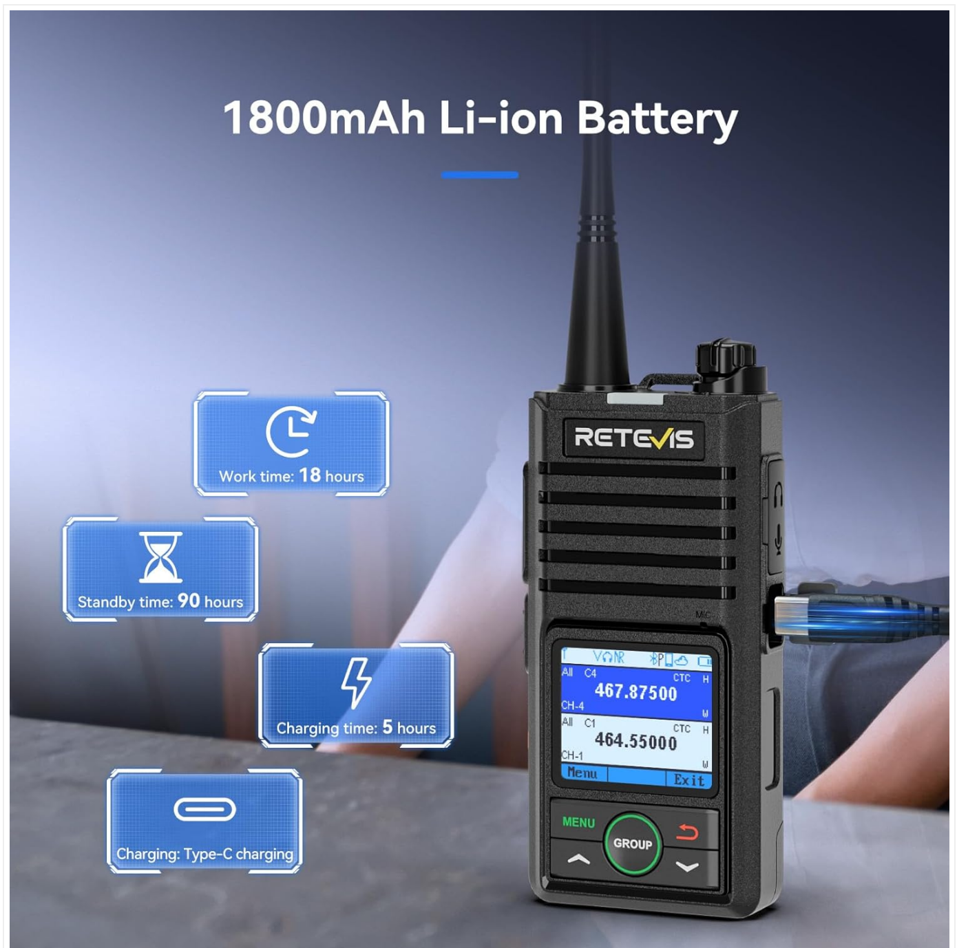
Figure 4.1: Battery Performance and Charging