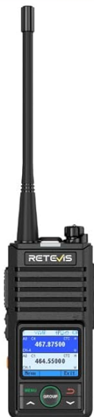
RB58 walkie talkie x4