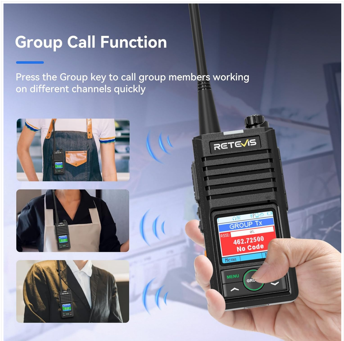
Figure 5.2: Group Call Function in Action