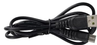
Type-C charging cable x4