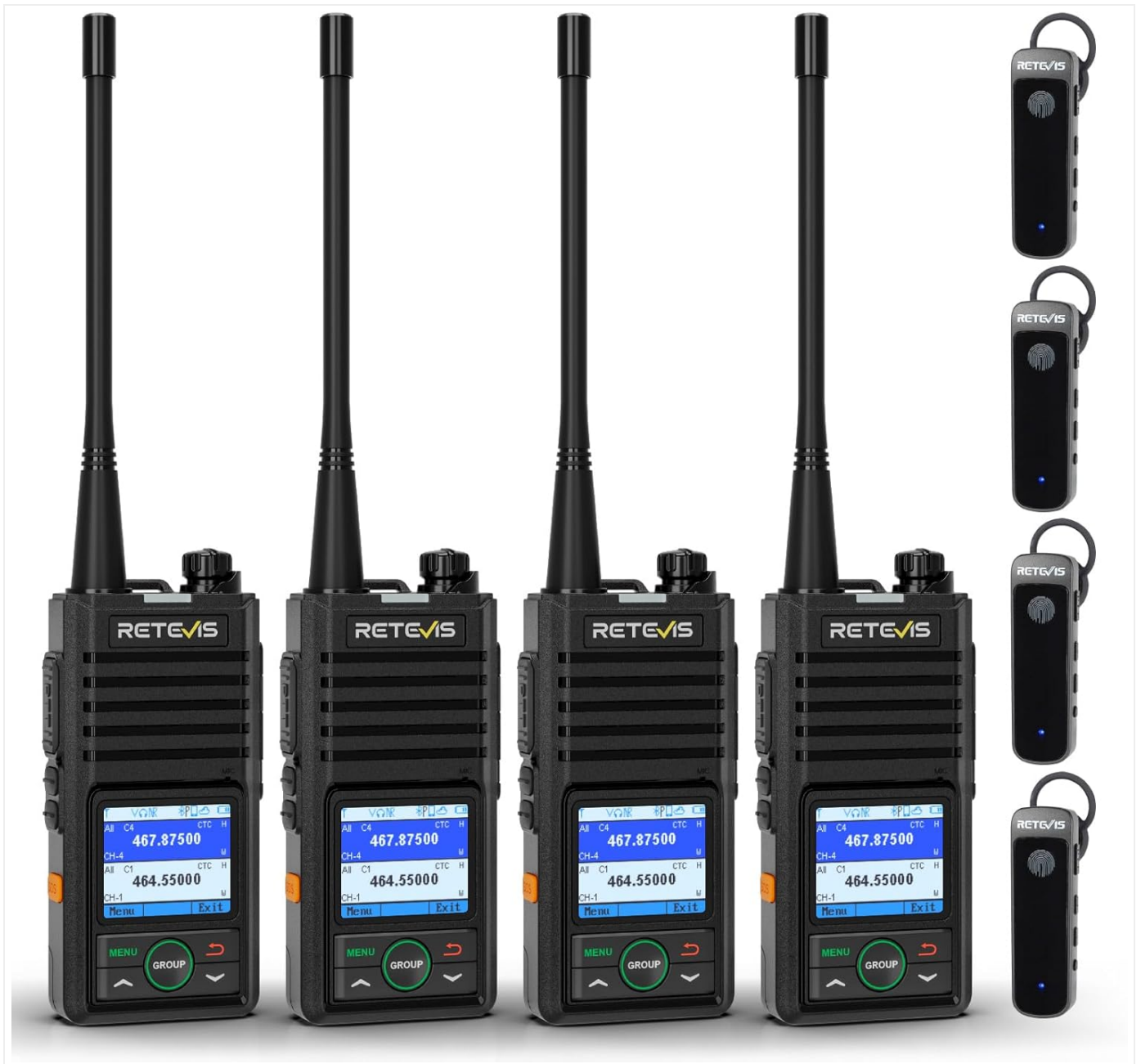
Figure 1.1: Retevis RB58 Walkie Talkies with Headphones

Video 1.1: Overview of Retevis RB58 Walkie Talkie Features. This video demonstrates the key functionalities and design aspects of the RB58 two-way radio.