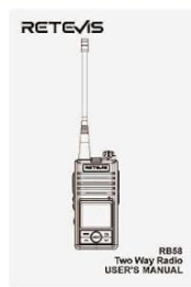
User manual x4