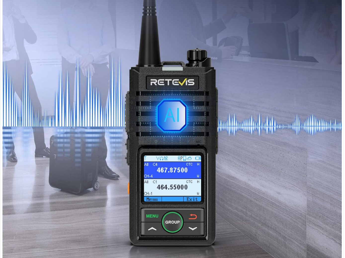
Figure 5.3: Two-way Noise Cancelling

Filter out the ambient noise, offer clear audio to call