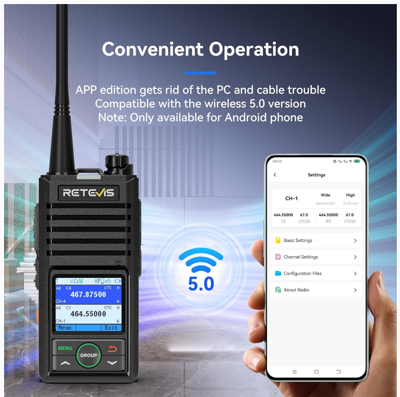
Figure 4.3: APP Control for Convenient Operation