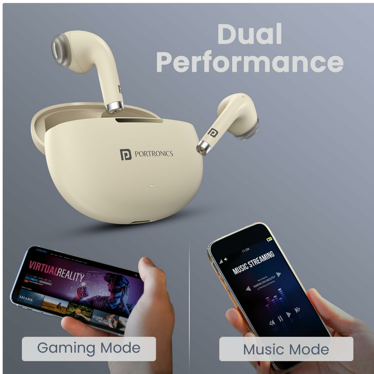
Image: The Portronics Harmonics Twins S19 earbuds demonstrating their dual performance capabilities for both gaming and music streaming.