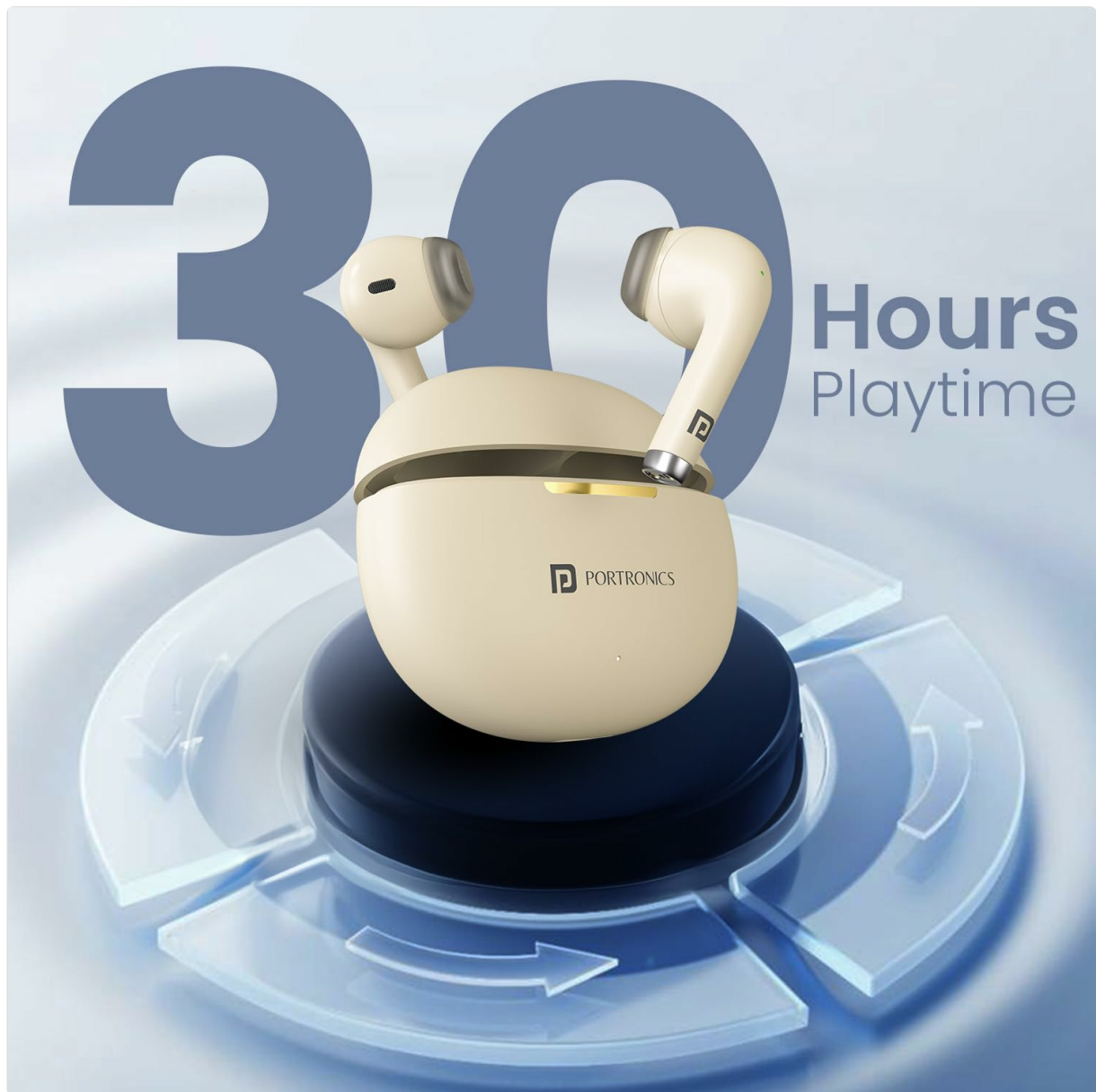
Image: The Portronics Harmonics Twins S19 earbuds in their charging case, illustrating the 30 hours of playtime capacity.