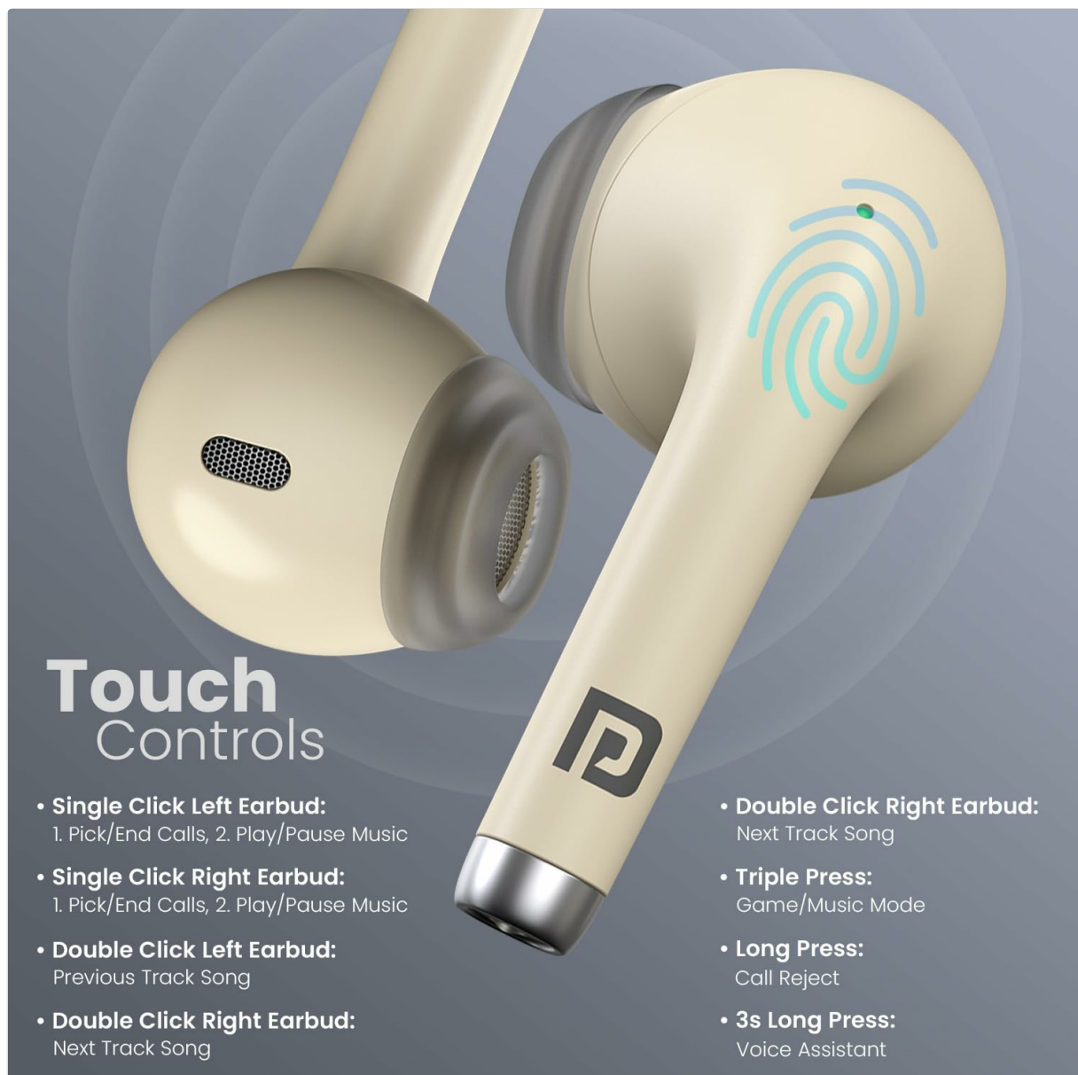
Image: Diagram illustrating the touch control functions on the Portronics Harmonics Twins S19 earbuds for music, calls, and voice assistant.