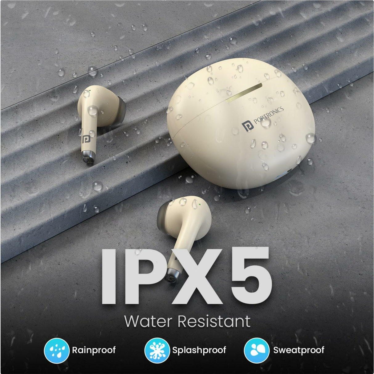
Image: The Portronics Harmonics Twins S19 earbuds and charging case, highlighting their IPX5 water-resistant rating, indicating protection against rain, splashes, and sweat.