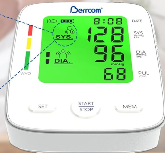
Image: Dual-user mode display.