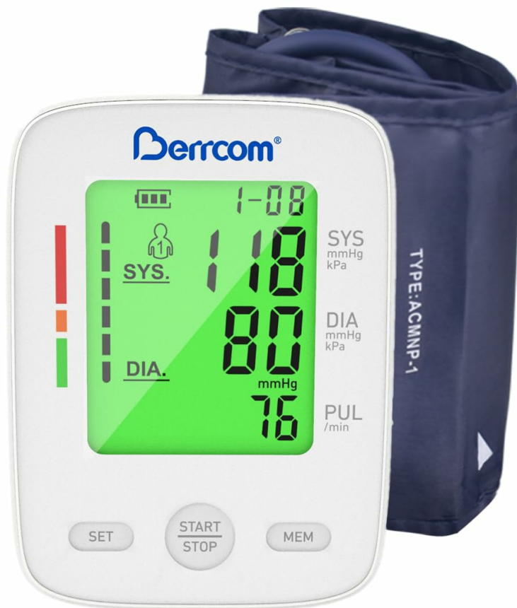
Image: Berrcom FC-BP120 Blood Pressure Monitor.