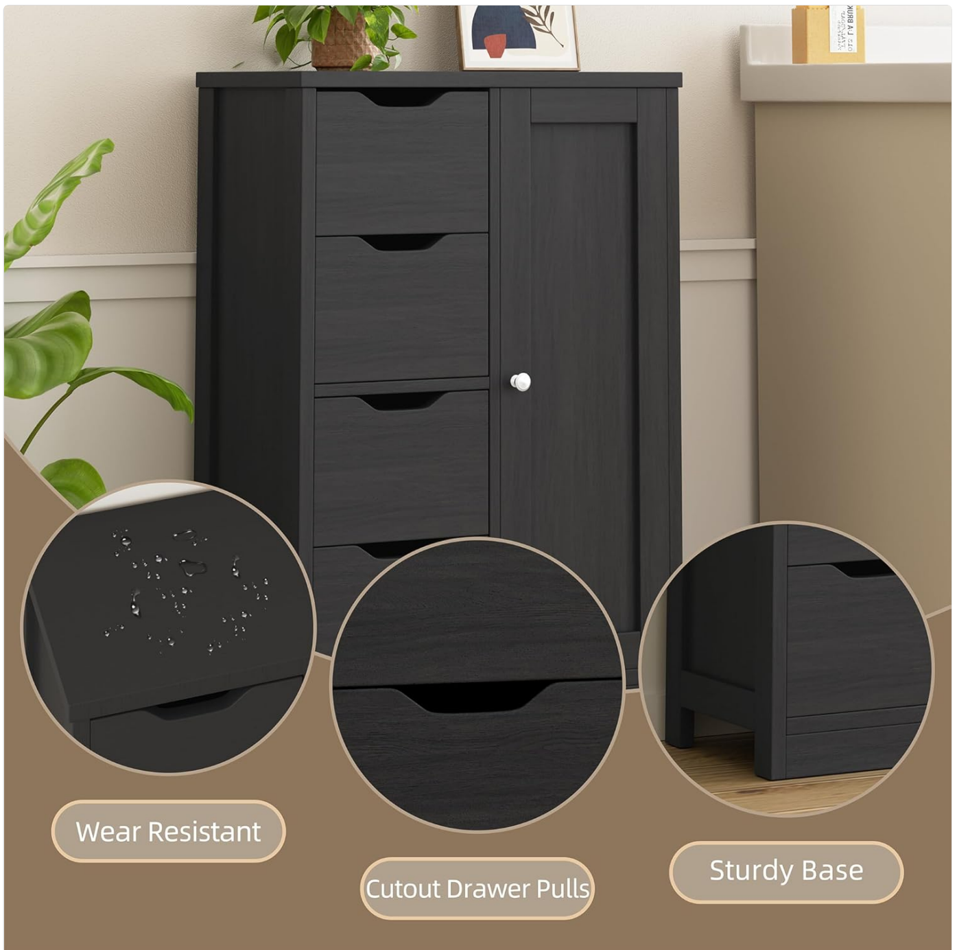
Figure 2: Detailed view of the cabinet's features, including its wear-resistant surface, integrated cutout drawer pulls, and stable base design.