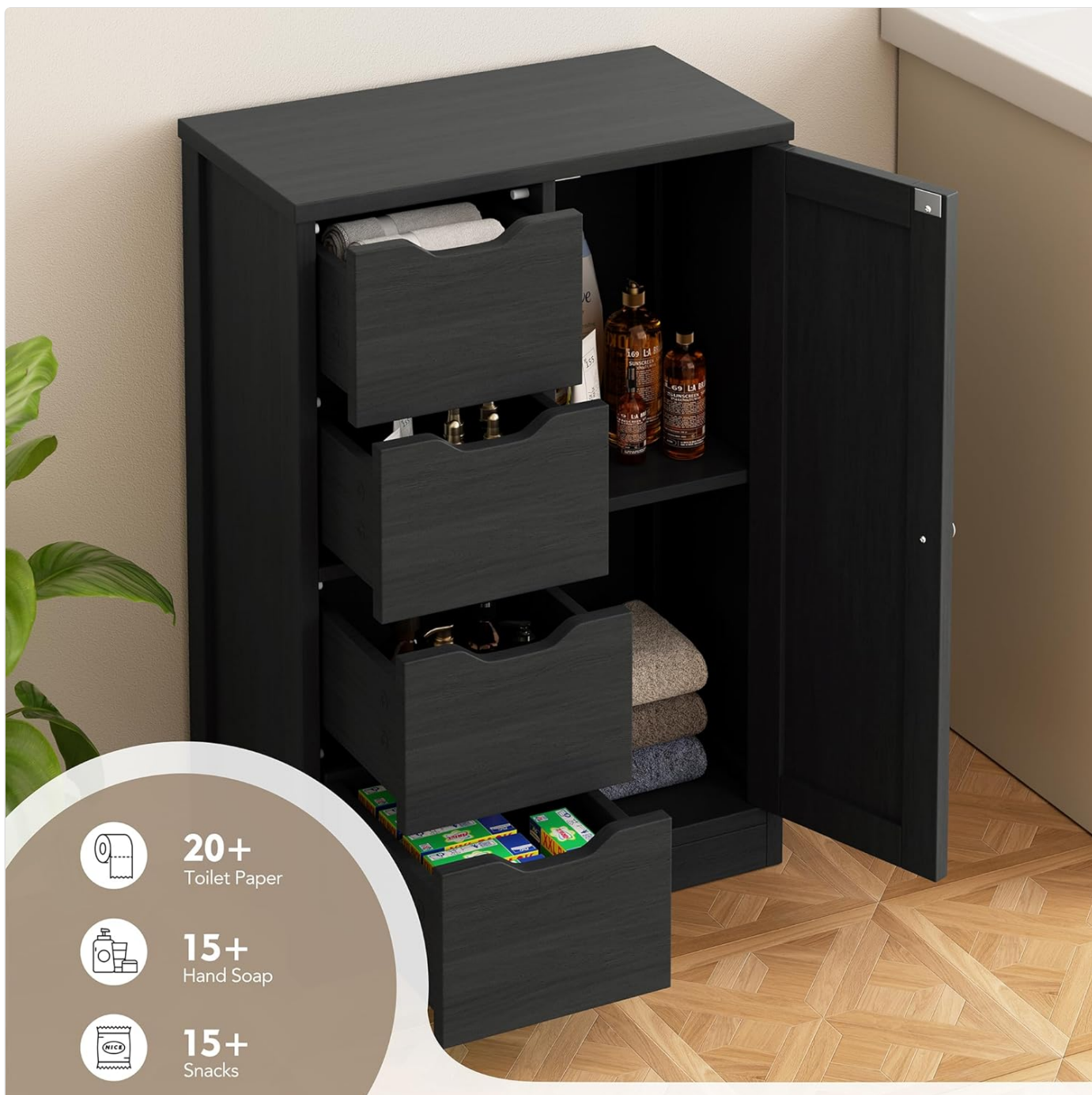
Figure 5: Visual representation of the cabinet's storage capacity for common household items.