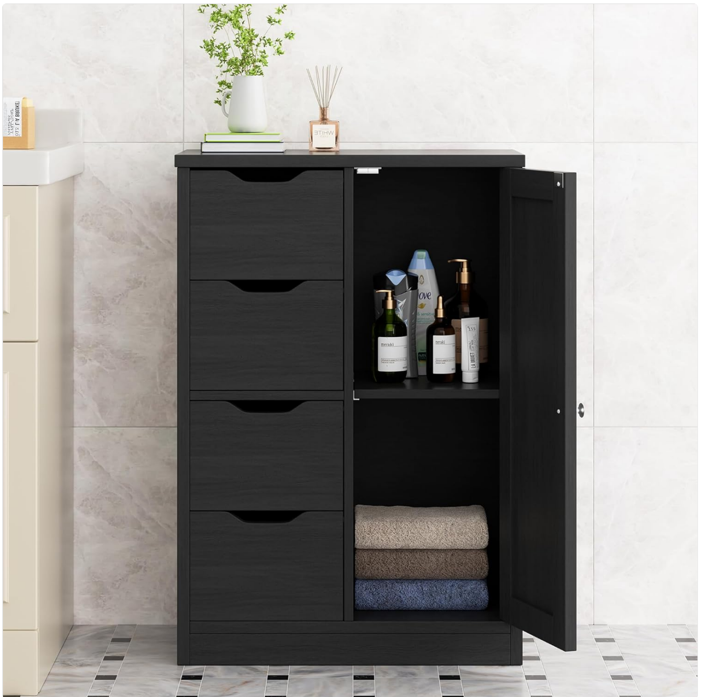
Figure 1: Walsunny Bathroom Floor Storage Cabinet in a typical bathroom environment, showcasing its compact design and storage capabilities.