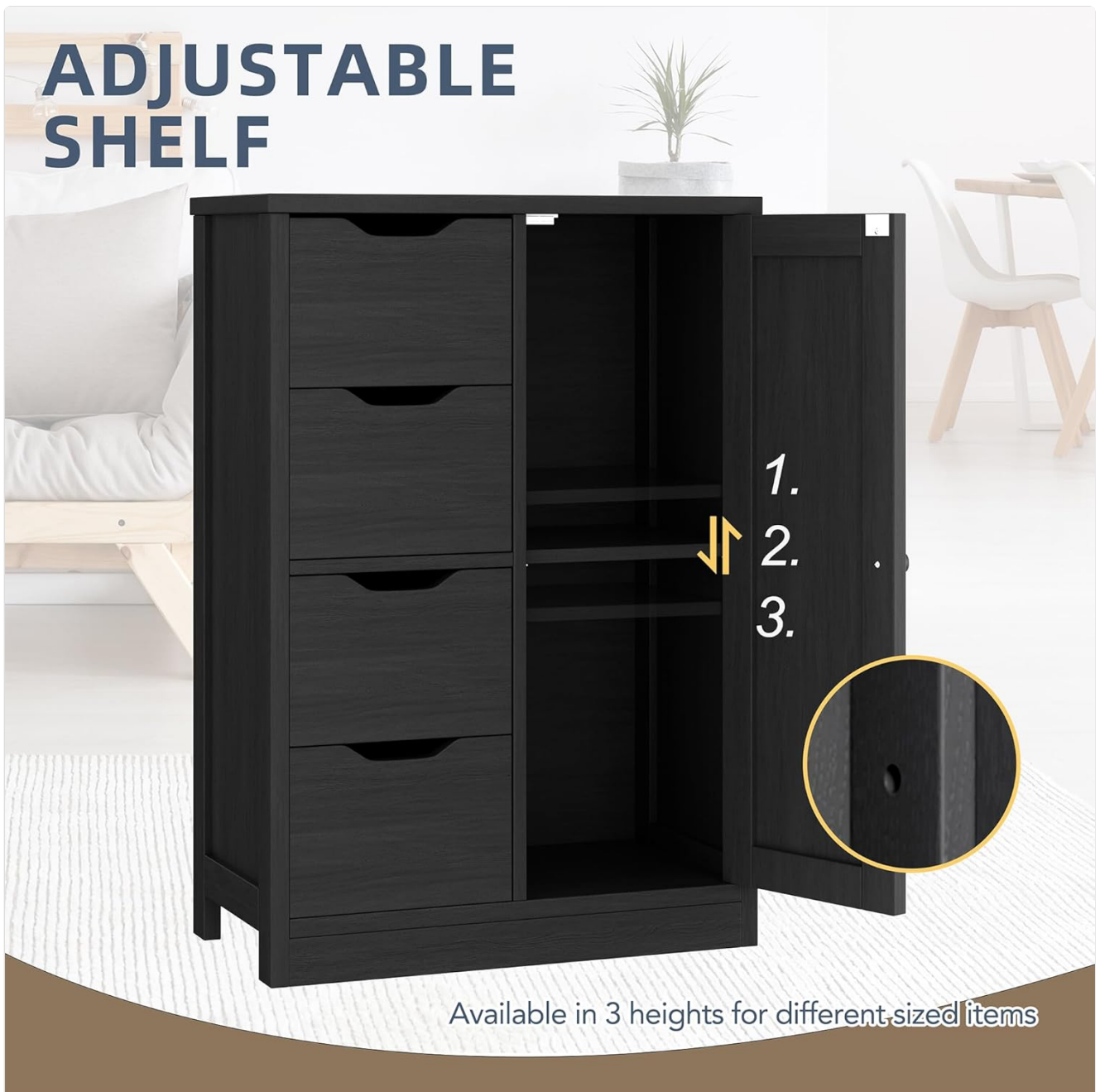
Figure 3: Illustration demonstrating the three available height options for the adjustable shelf within the cabinet section.