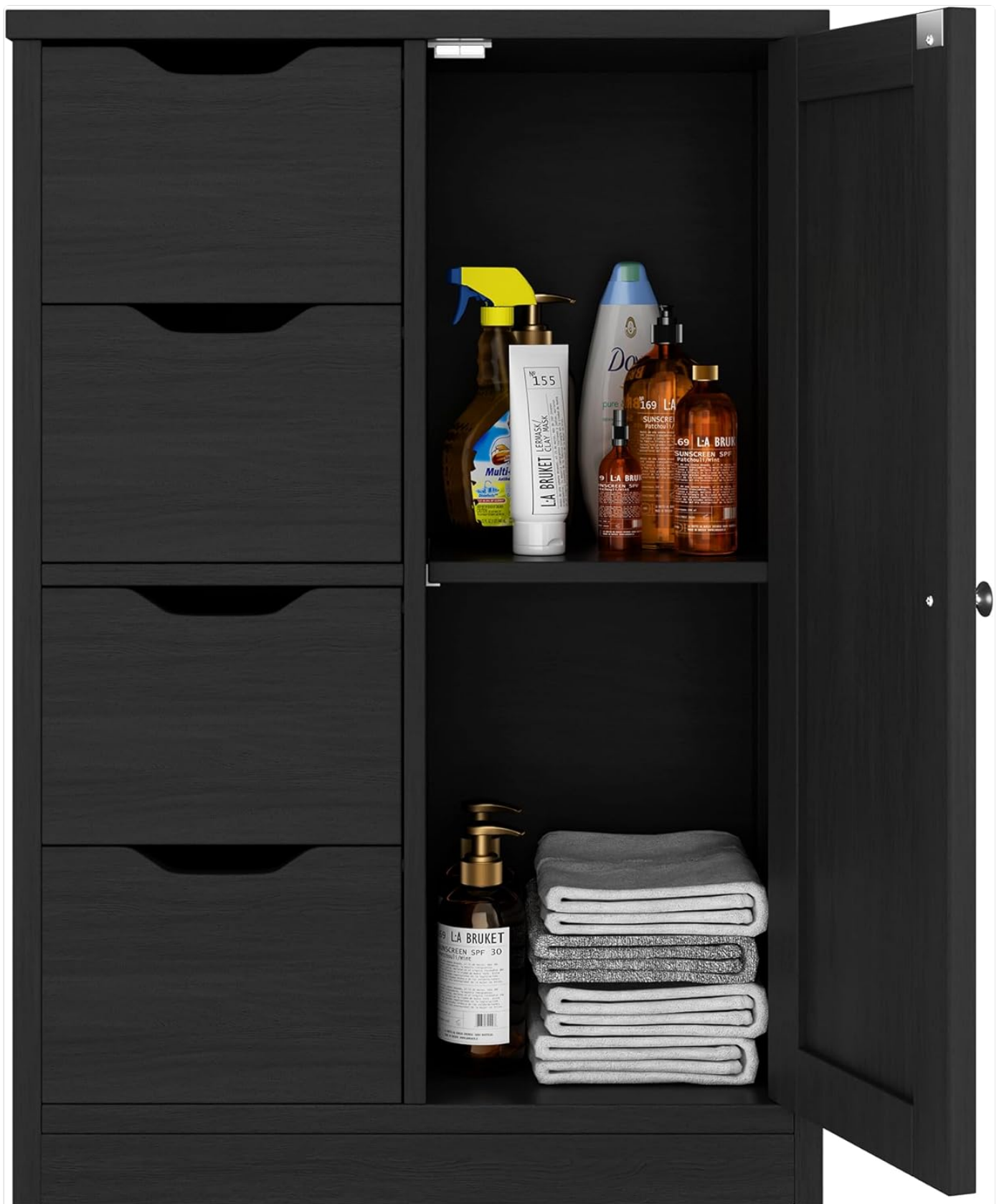
Figure 4: The cabinet's interior, demonstrating how various items can be organized within the drawers and on the adjustable shelf.