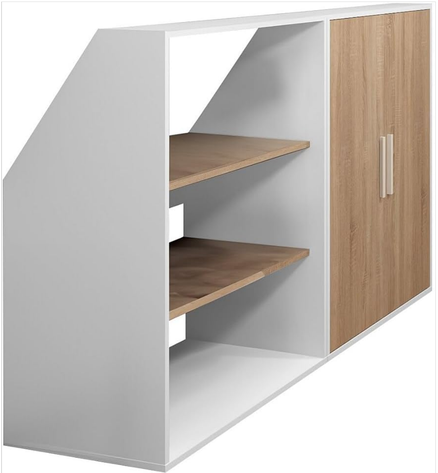
Image 4: Detailed view of the cabinet's storage compartments, including the two doors and open shelves.