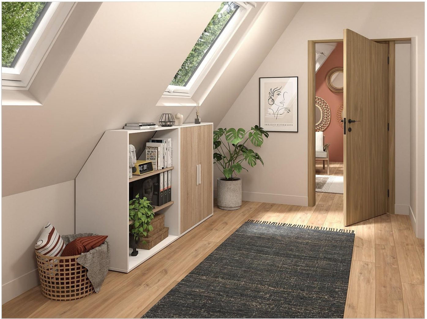
Image 1: The ADEZIO cabinet integrated into a room with a sloped ceiling, showcasing its design and storage capacity.