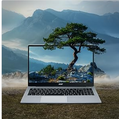
Figure 2.1: Windows 11 Home Operating System

This image highlights the Windows 11 Home operating system, which comes pre-installed on the Acer Aspire 3 laptop, ready for initial setup.