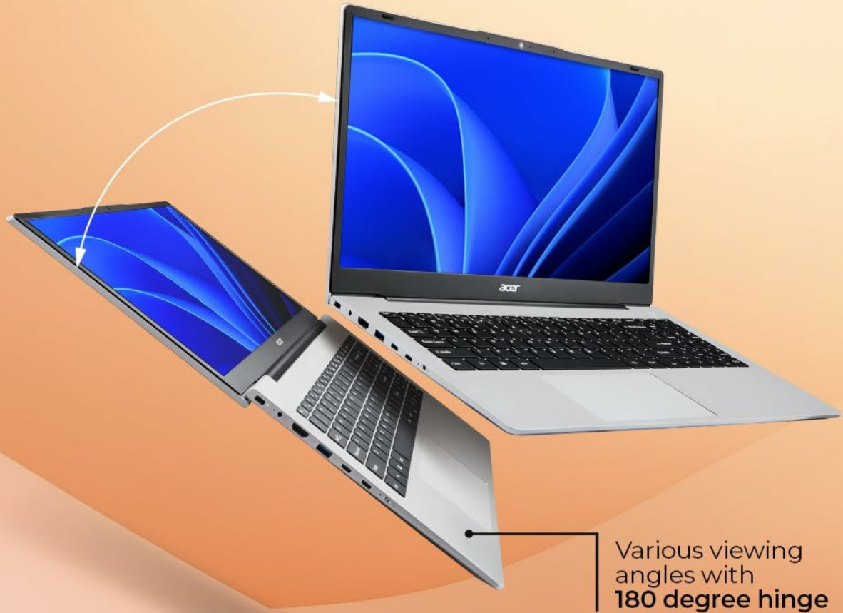
Figure 3.1: Backlit Keyboard and Full HD IPS Display

This image illustrates the laptop's 15.6-inch Full HD IPS display and the backlit keyboard, enhancing usability and visual experience.