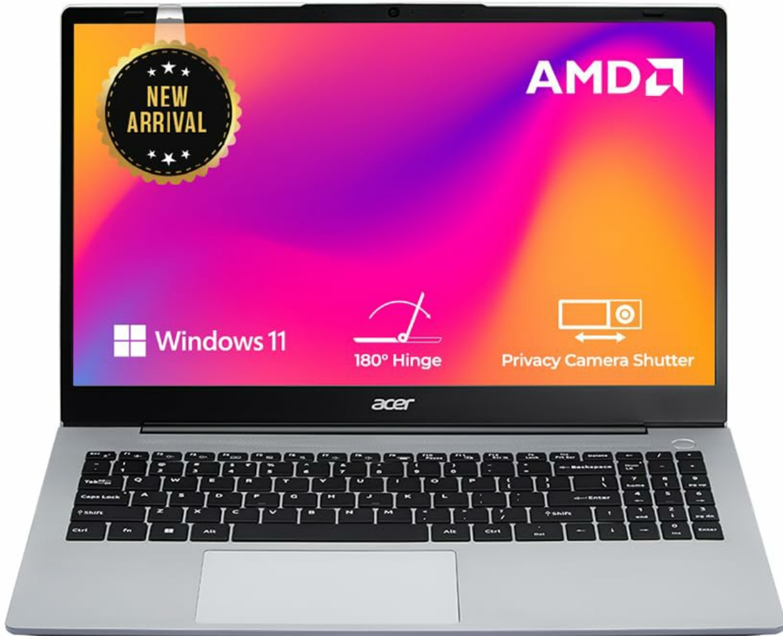
Figure 1.1: Acer Aspire 3 Laptop (Model AS15-42)

This image shows the Acer Aspire 3 laptop from the front, highlighting its sleek design and display. The screen displays a vibrant background with icons for Windows 11, 180-degree hinge, and privacy camera shutter, along with the AMD logo.