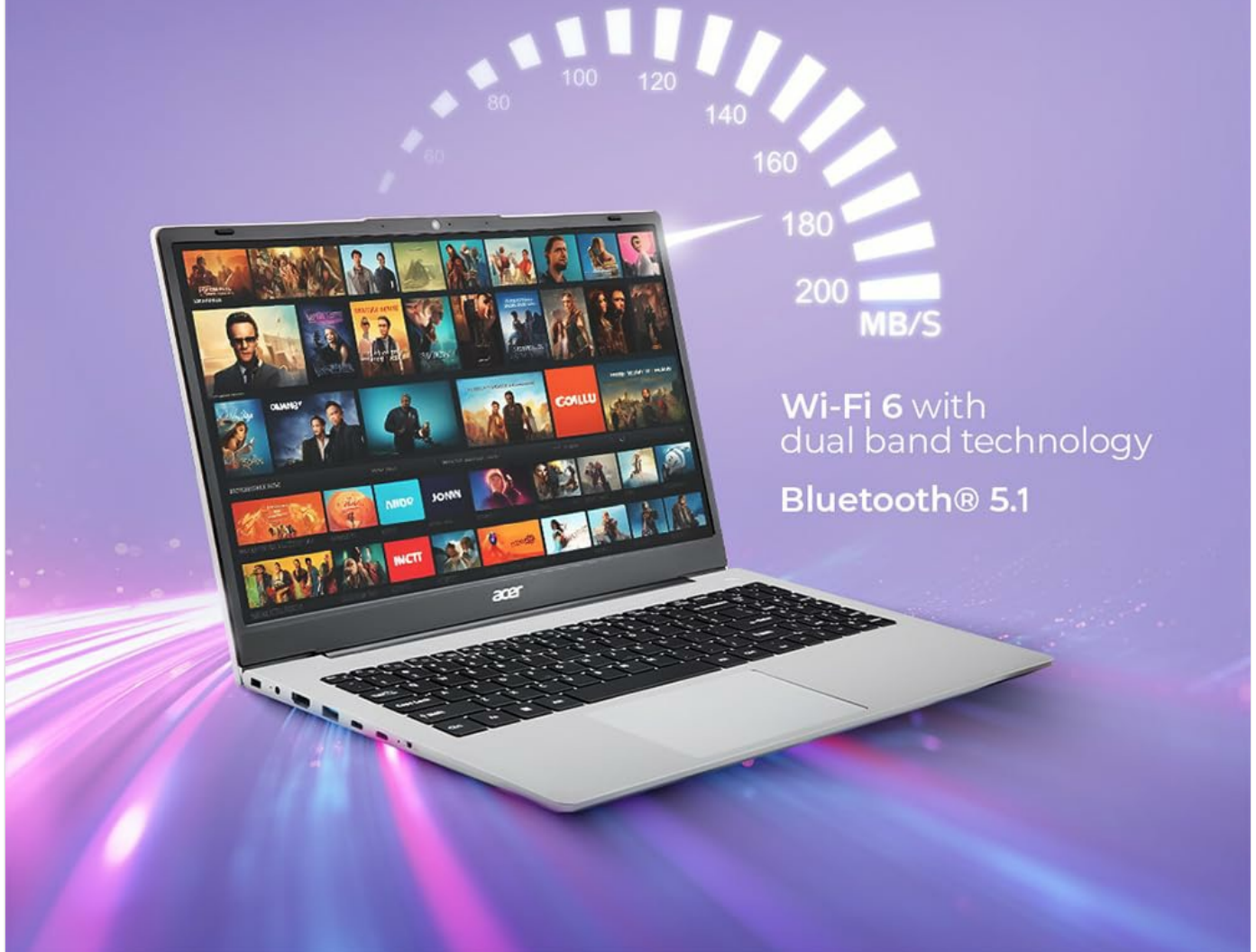
Figure 3.5: Powerful Performance with AMD Ryzen Processor

This image highlights the laptop's powerful AMD Ryzen 7 7730U processor and dual-channel DDR4 SDRAM support, indicating strong performance capabilities.