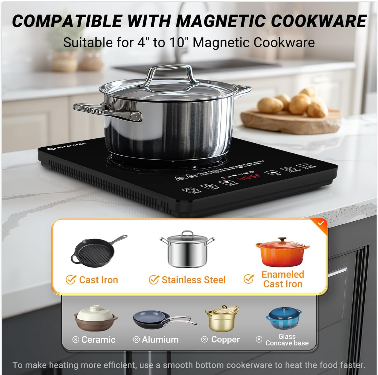
Image: Detailed illustration of magnetic cookware compatibility, showing examples of Cast Iron, Stainless Steel, and Enameled Cast Iron as compatible, and Ceramic, Aluminum, Copper, and Glass Concave base as incompatible. Emphasizes using smooth-bottom cookware for efficiency.

Suitable for 4" to 10" Magnetic Cookware