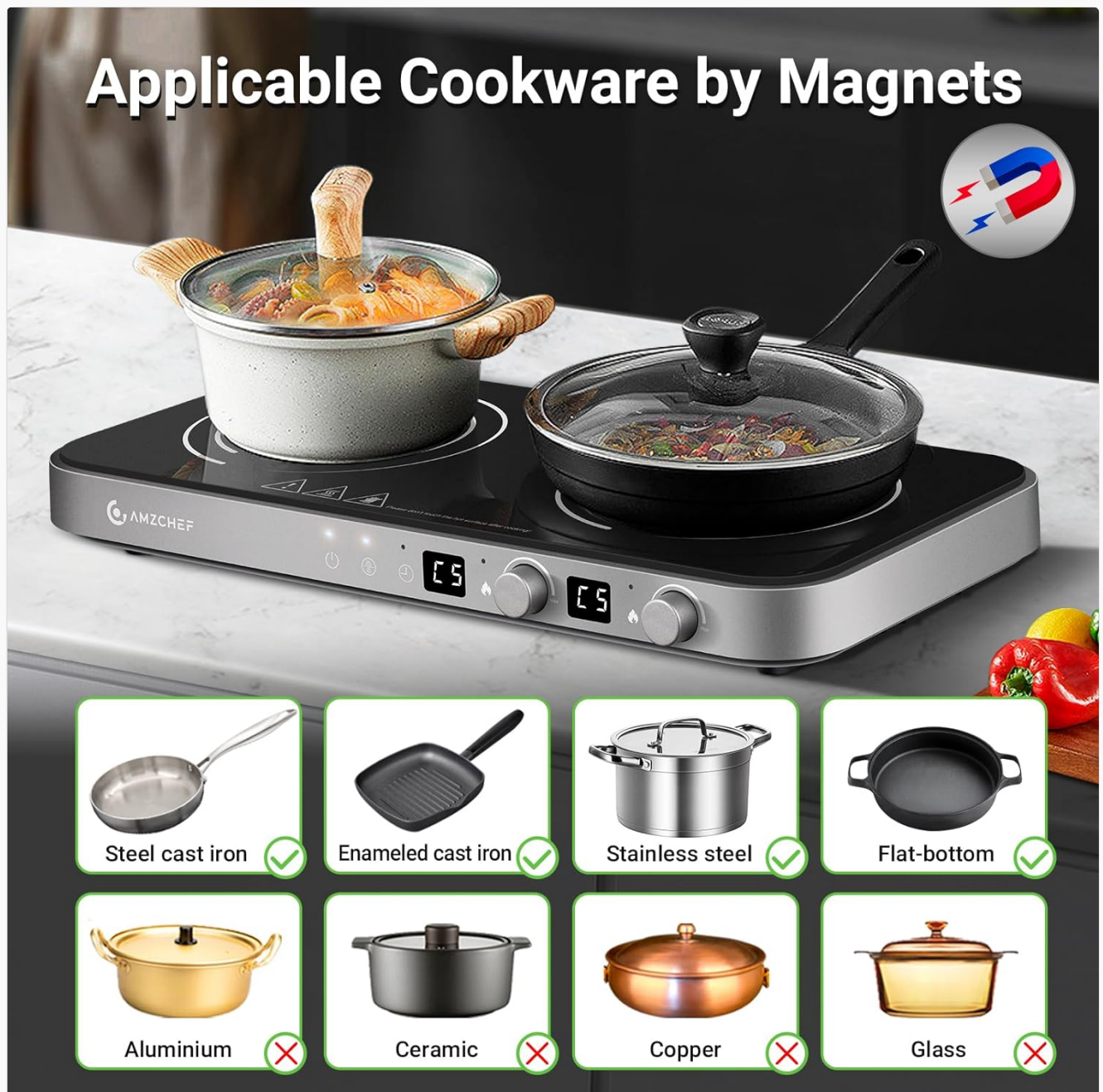
Image: Visual guide showing various cookware types and their compatibility with induction cooktops, indicated by checkmarks for compatible types (Steel cast iron, Enameled cast iron, Stainless steel, Flat-bottom) and crosses for incompatible types (Aluminium, Ceramic, Copper, Glass).

To test if your cookware is compatible, place a magnet on the bottom of the pot or pan. If the magnet sticks, the cookware is suitable for induction cooking. Use cookware with a smooth, flat bottom for optimal heating efficiency.