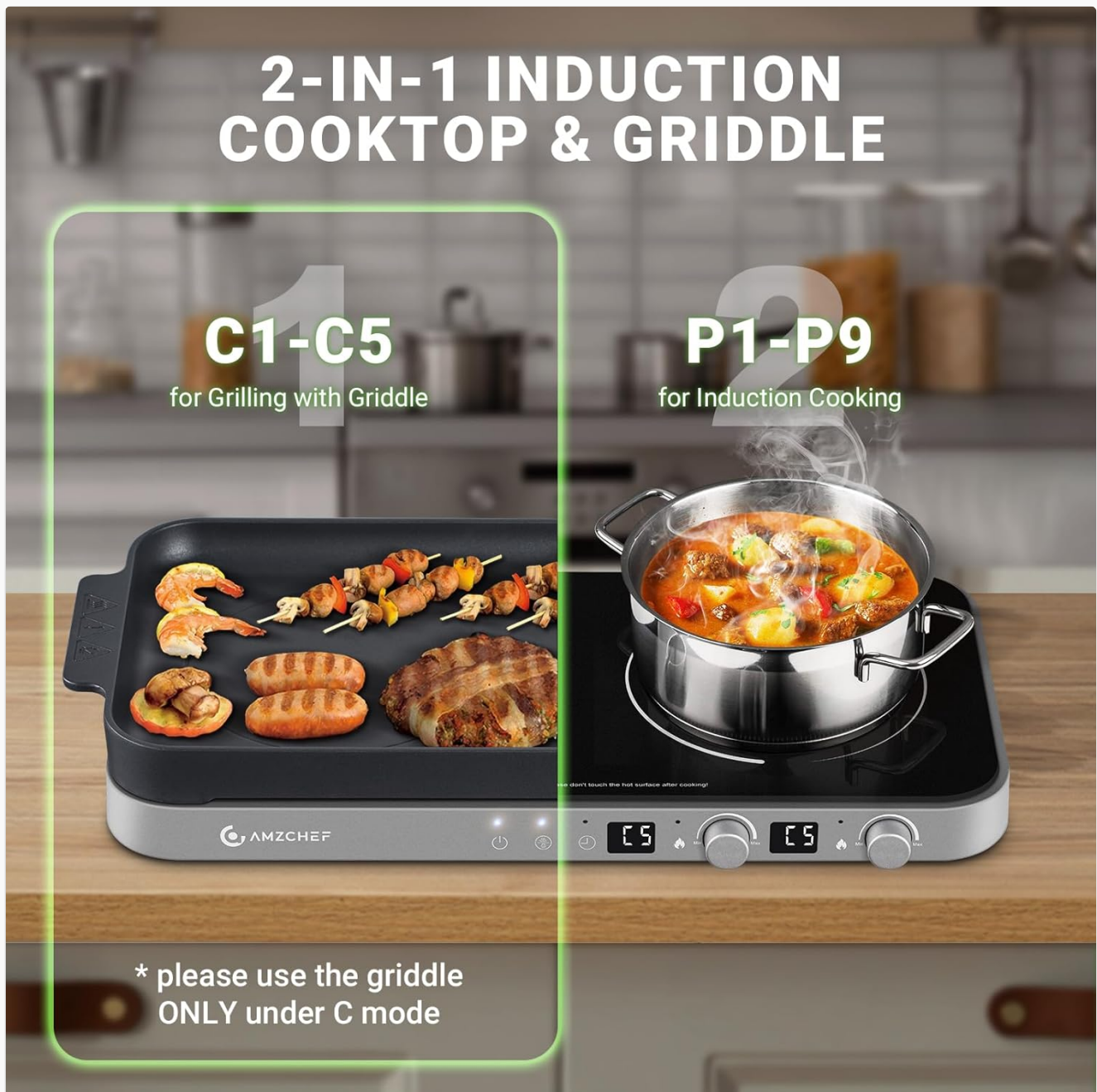
Image: Diagram illustrating the 2-in-1 functionality, showing the griddle used with C1-C5 modes and induction cooking with P1-P9 modes. Note: Griddle use is only under C mode.