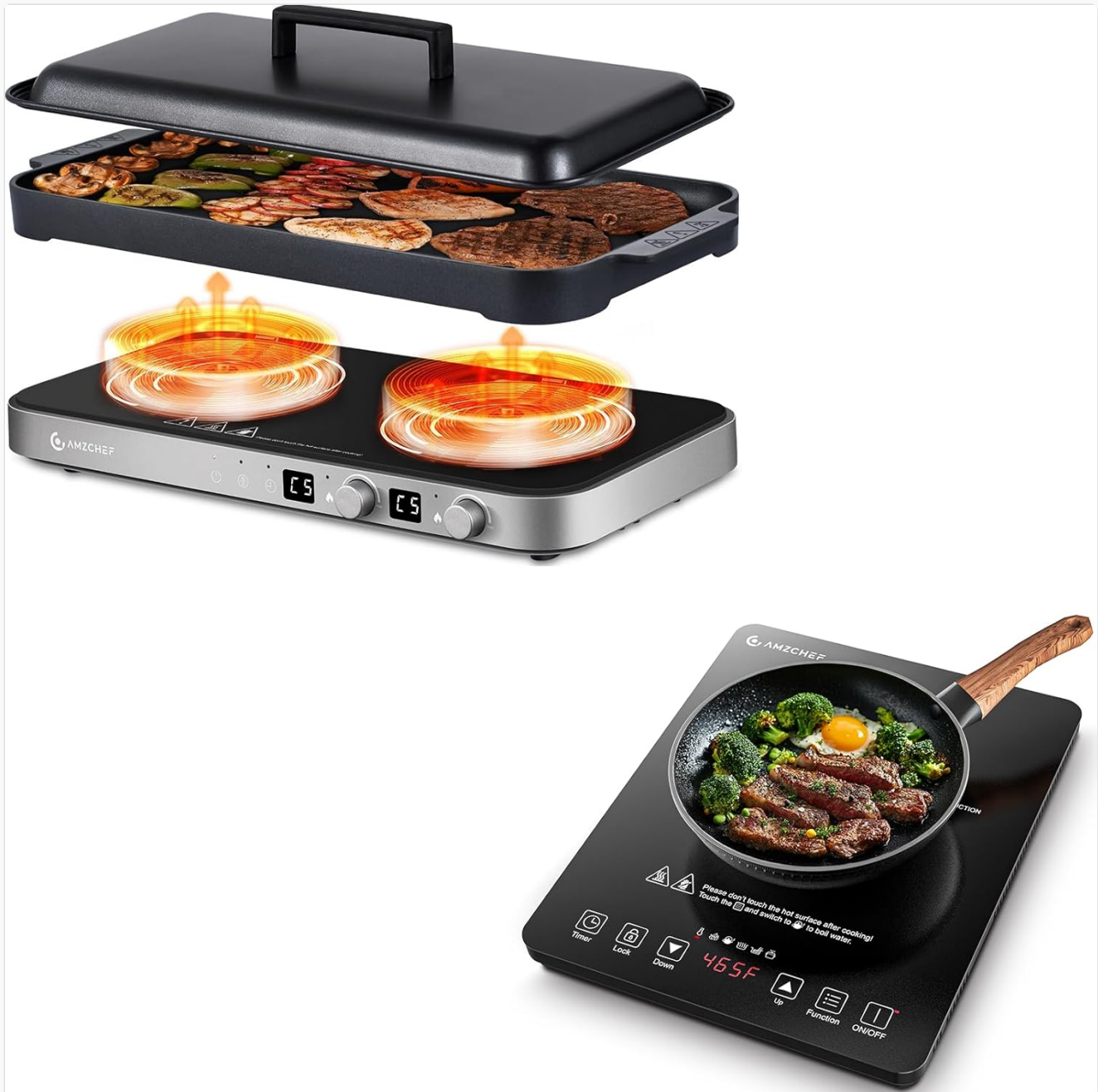
Image: AMZCHEF Double Induction Cooktop with the removable cast iron griddle pan and a separate portable induction cooktop.

The AMZCHEF Double Induction Cooktop offers a versatile 2-in-1 cooking solution, combining two induction burners with a removable cast iron griddle pan. This portable unit is designed for efficient and flexible cooking.