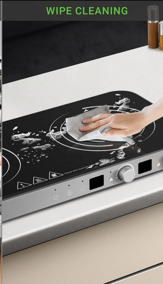
Image: Demonstration of easy cleaning, showing the griddle pan being placed in a dishwasher and the cooktop surface being wiped clean with a cloth.