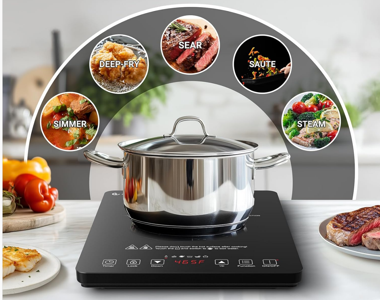
Image: Visual representation of various cooking functions including deep-fry, sear, saute, simmer, and steam, highlighting the versatility of the cooktop.

Easy & convenient to meet all your cooking needs.