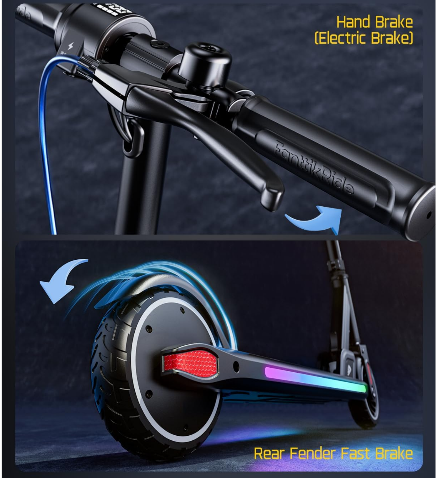
Figure 4: Illustration of the hand brake and rear fender brake.