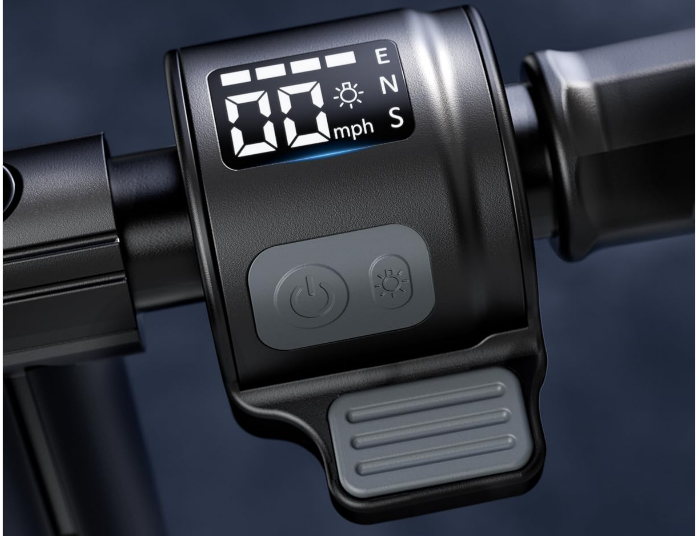
Figure 3: Close-up of the handlebar controls and LED display.