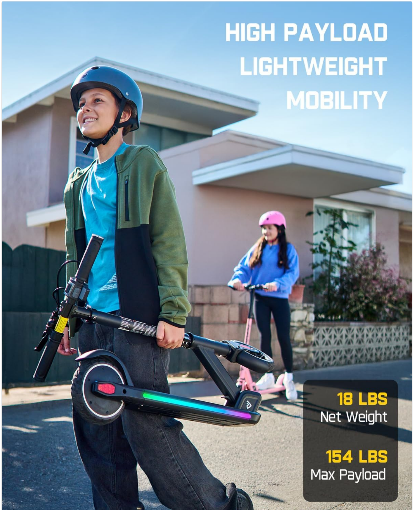
Figure 6: The scooter in its folded, portable state.