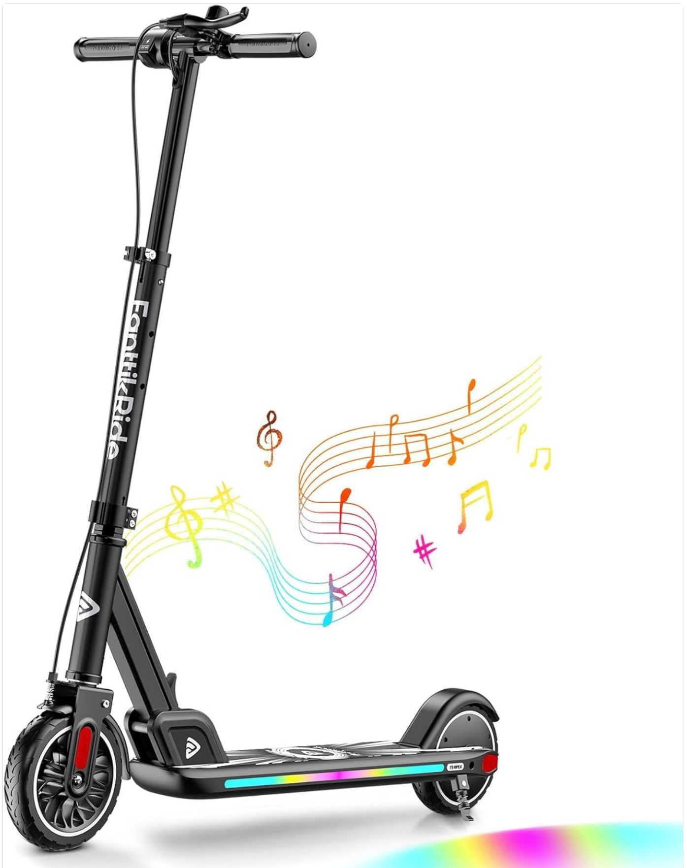
Figure 1: FanttikRide T9 Apex Electric Scooter (Black model shown)