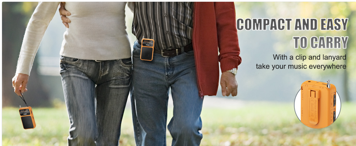
Figure 6: Easy to Carry Design. The radio's small dimensions are highlighted, demonstrating its pocket-friendly size.

The radio includes a lanyard and a back clip for convenient carrying. Attach the lanyard to your wrist or hang the radio, or use the clip to secure it to your belt or bag.