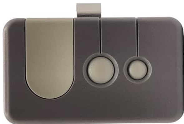
Remote - 2