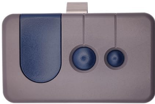
Remote - 2