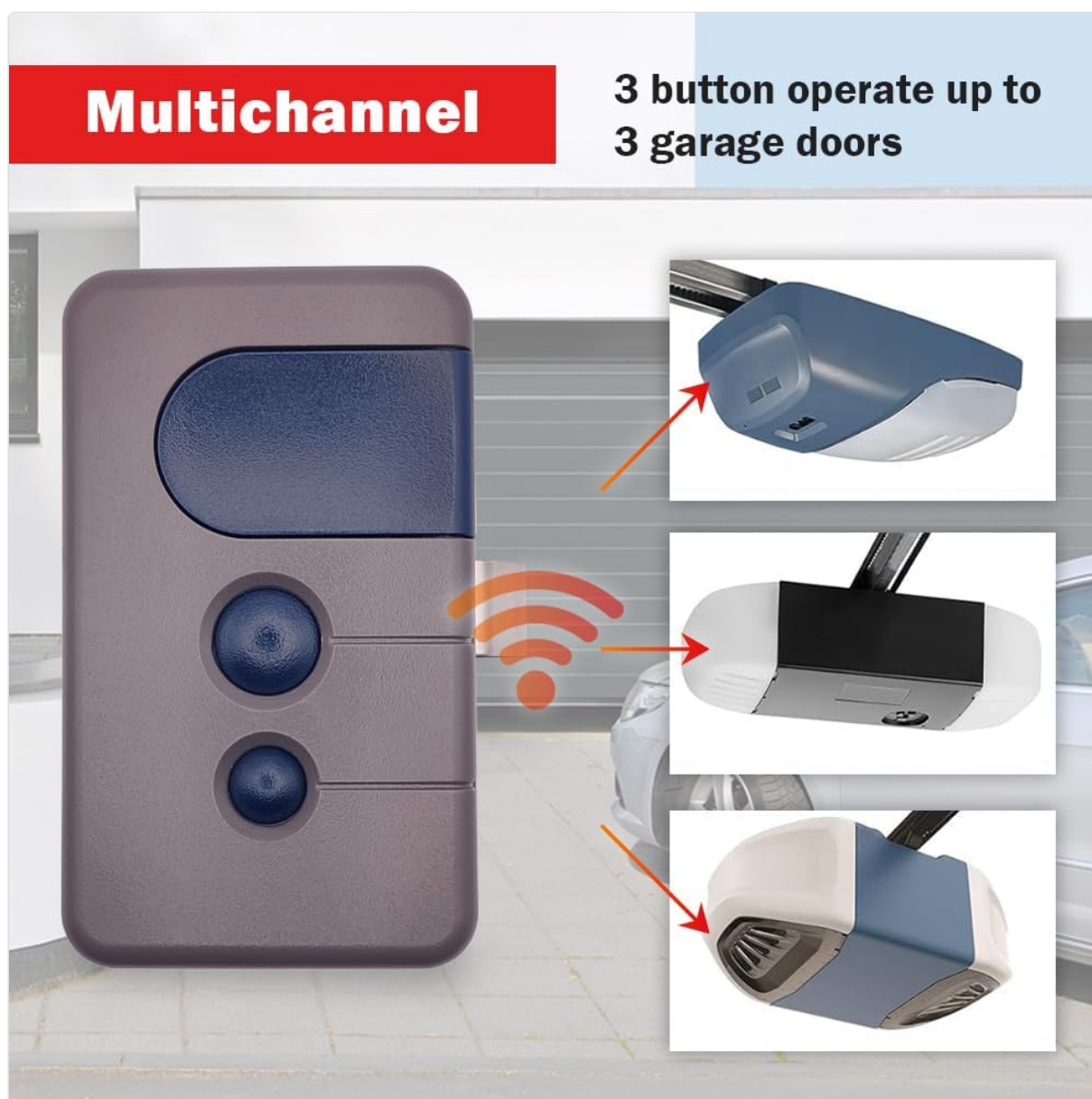
Image: The 3-button remote can operate up to three separate garage doors or compatible devices.