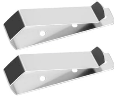
Visor Clip - 2

Image: The package includes two remote controls, two visor clips, and an instruction manual.