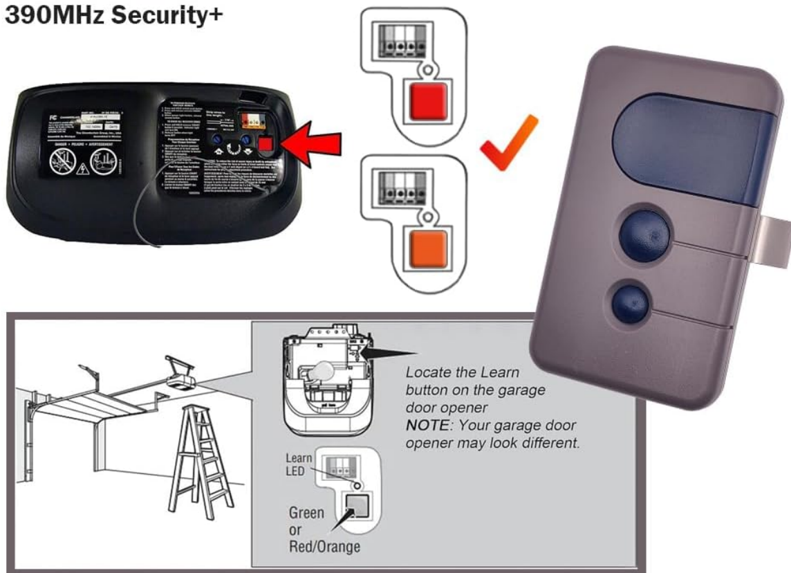
Image: Verify your garage door opener has a Red or Orange Learn Button for compatibility. The image displays the location of the learn button on a typical opener unit and confirms compatibility with red or orange buttons.