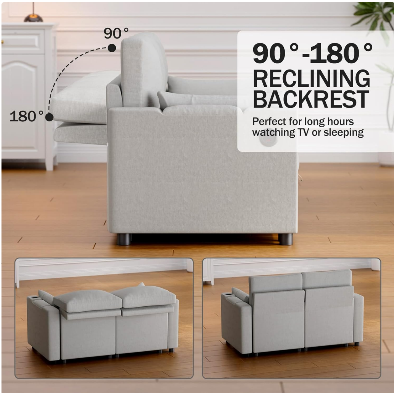
Figure 4.2: Visual representation of the backrest's adjustable range, from 90 degrees to 180 degrees.