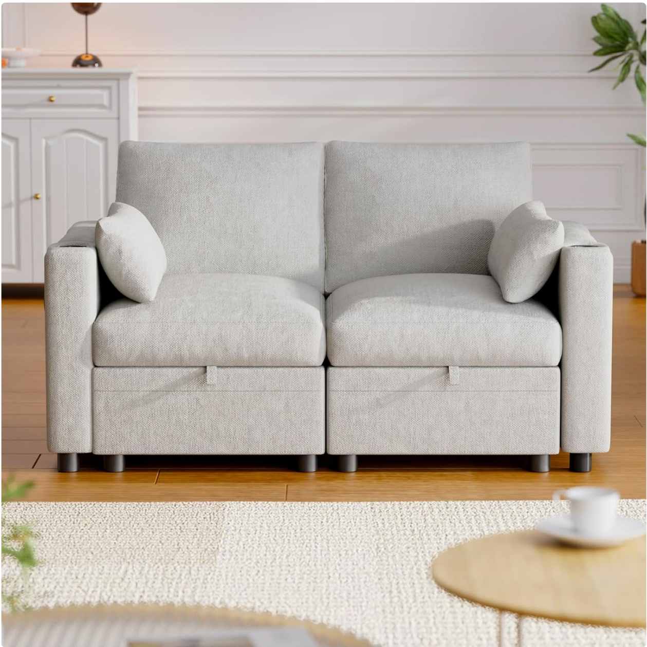
Figure 2.2: Front view of the assembled Soontrans 59-inch Modular Sofa.