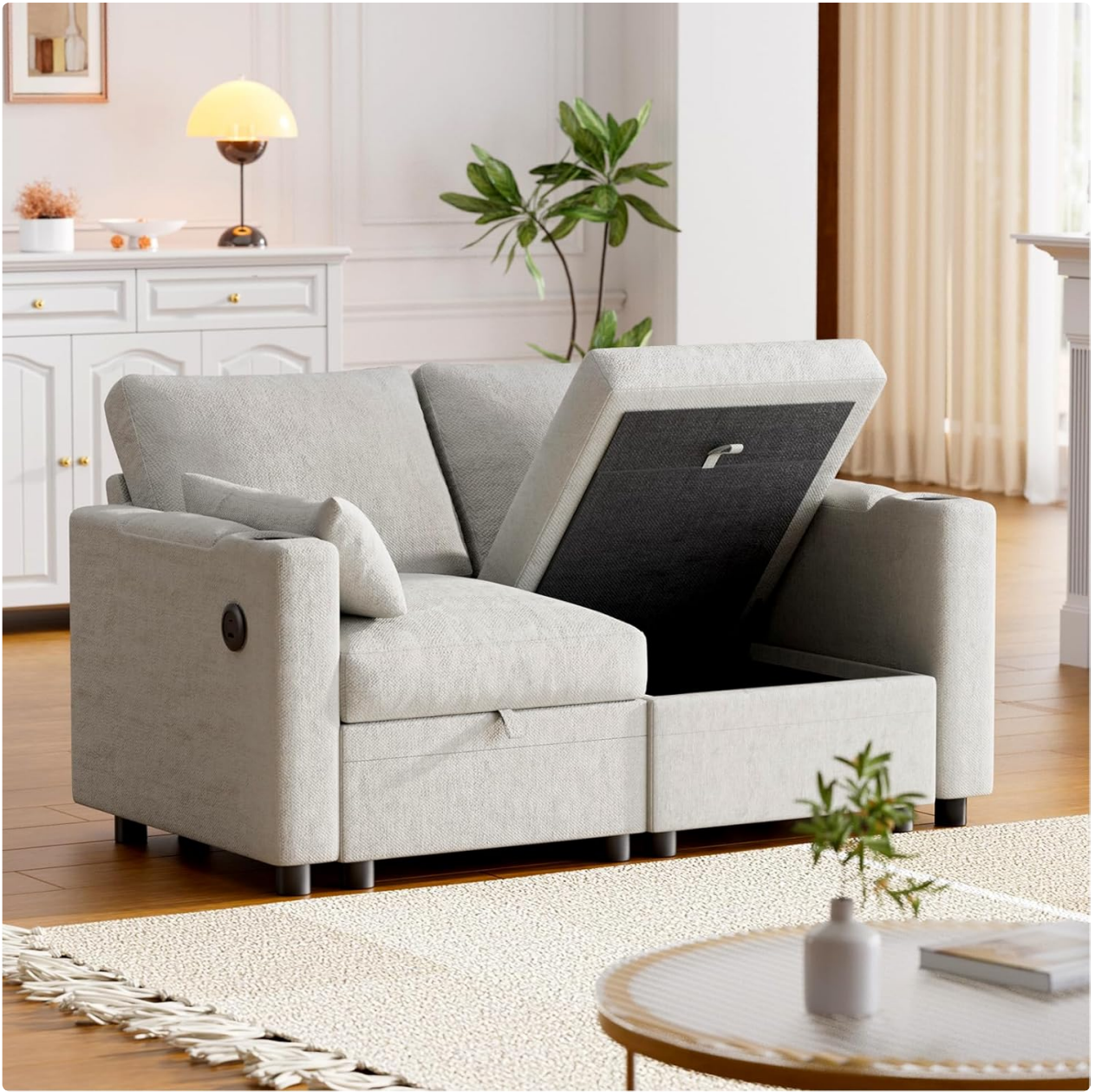
Figure 2.1: The Soontrans 59-inch Modular Sofa with one storage compartment open, showcasing its design and functionality.