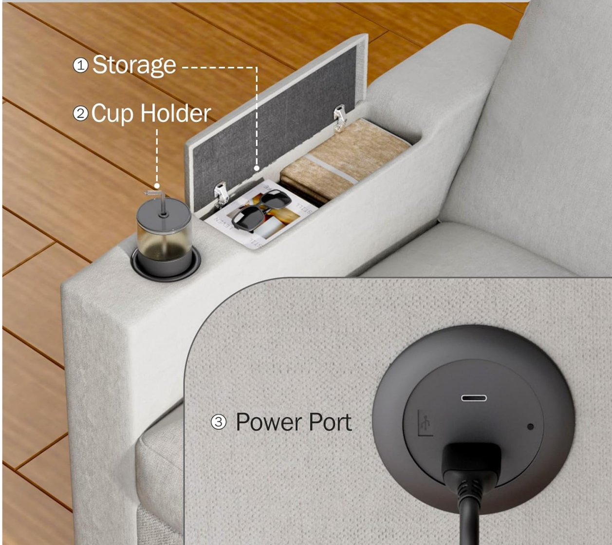
Figure 4.3: Detail of the armrest, highlighting the integrated storage, cup holder, and USB power port.