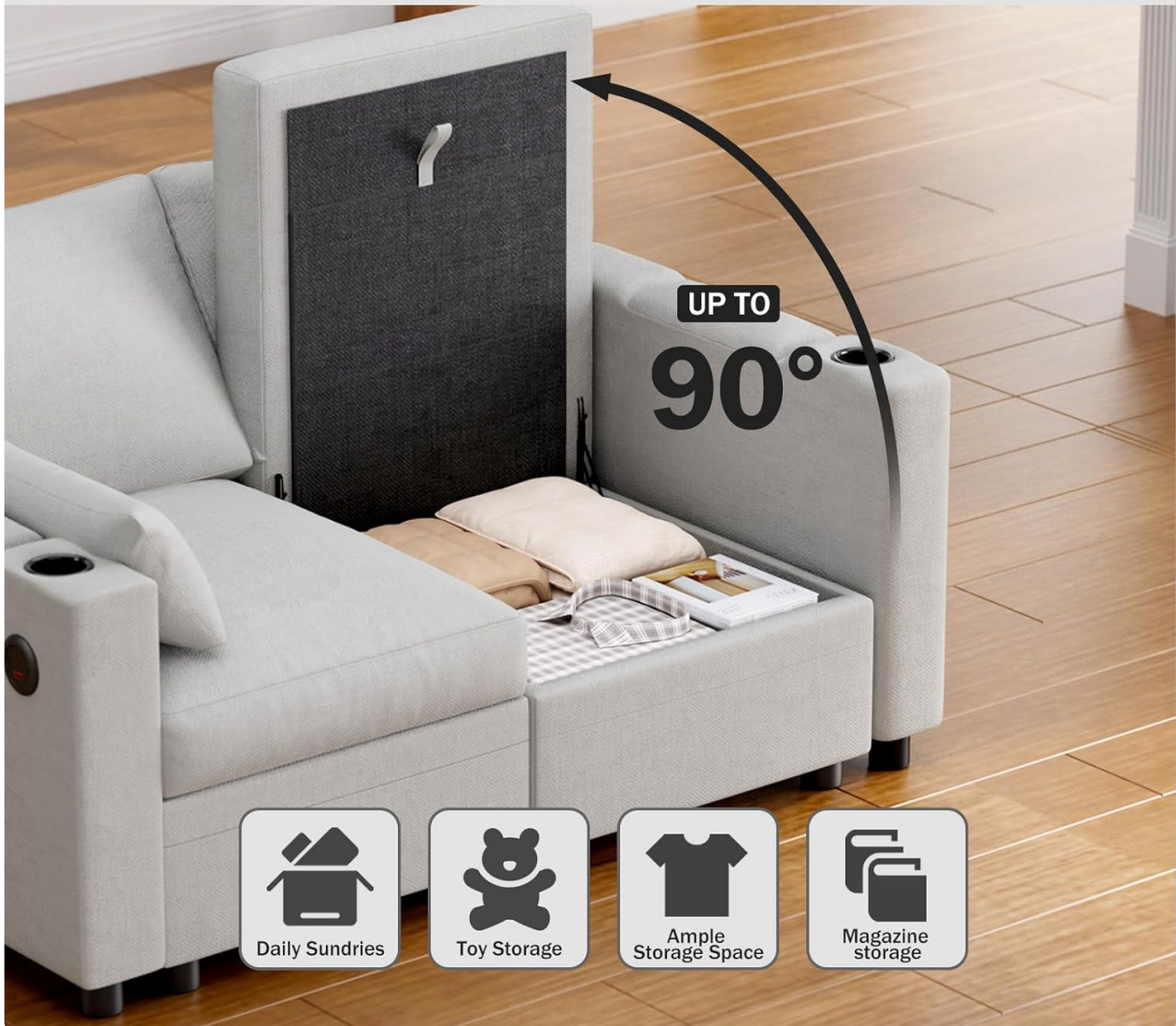
Figure 4.1: Illustration of the ample storage space available beneath each seat, suitable for various household items.

Each seat includes a spacious compartment beneath, keeps your home organized