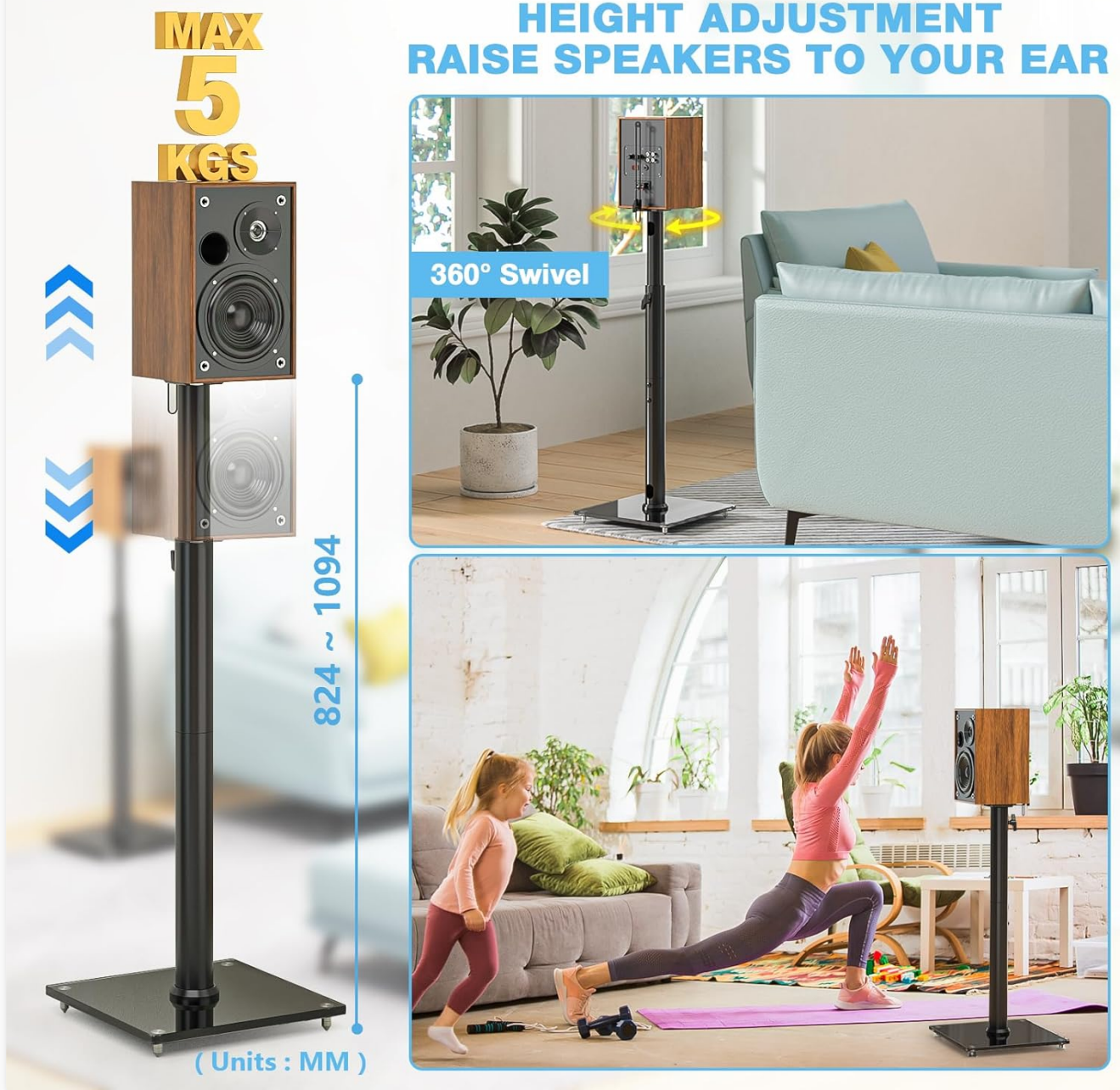
Figure 3: Height Adjustment and Swivel Capability