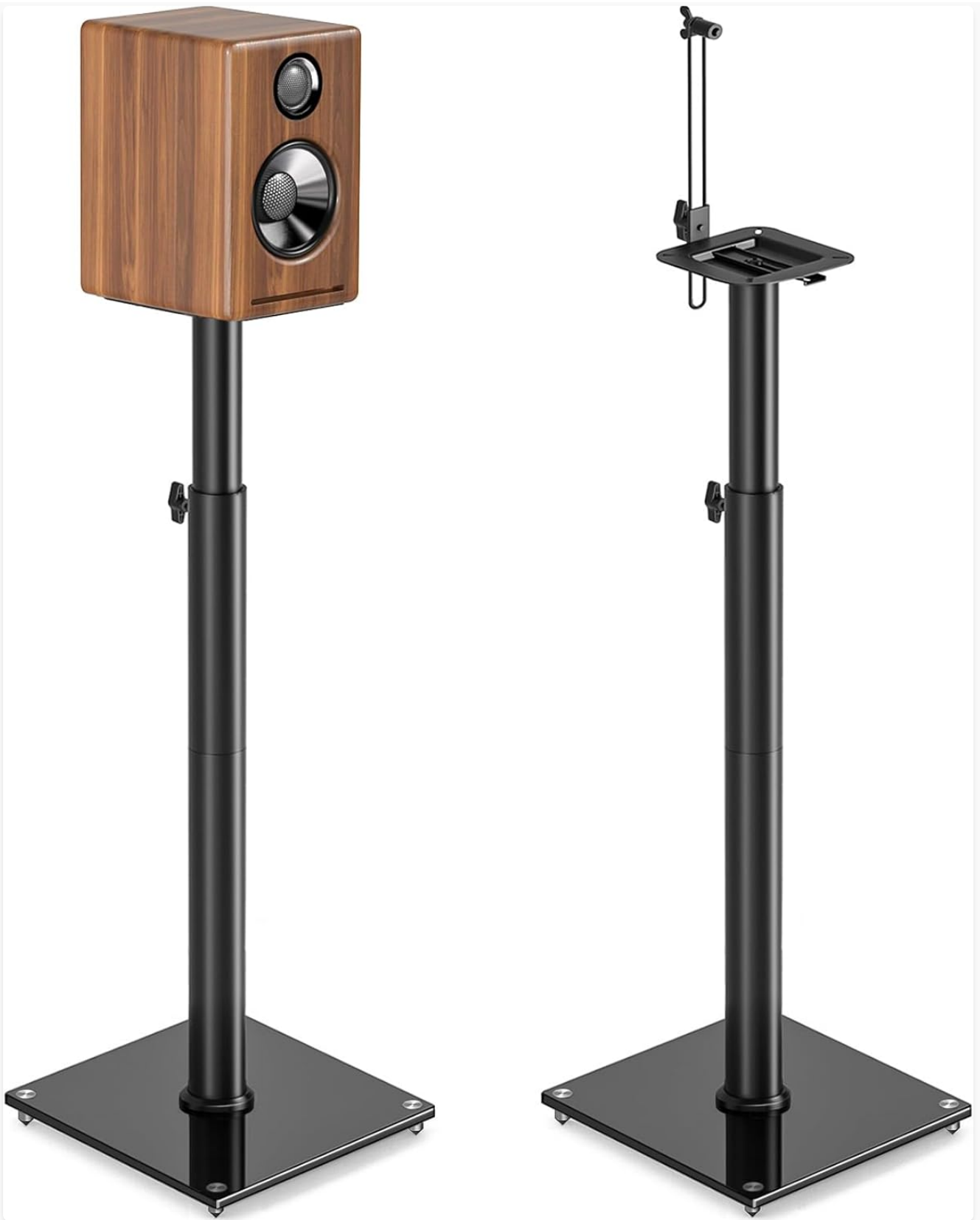
Figure 1: 5Rcom Speaker Stands Overview

The 5Rcom speaker stands are engineered for versatility and stability, supporting speakers up to 5 kg each. Their height-adjustable design and 360° swivel capability allow for precise sound positioning, making them ideal for home theater systems, studios, or any listening environment.