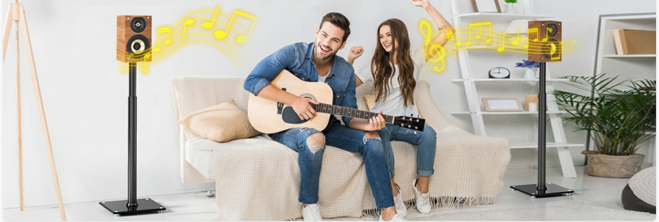
Figure 6: Optimal Speaker Placement for Sound Quality

Ear-Level Surround Sound Enhance Your Audiovisual Experience