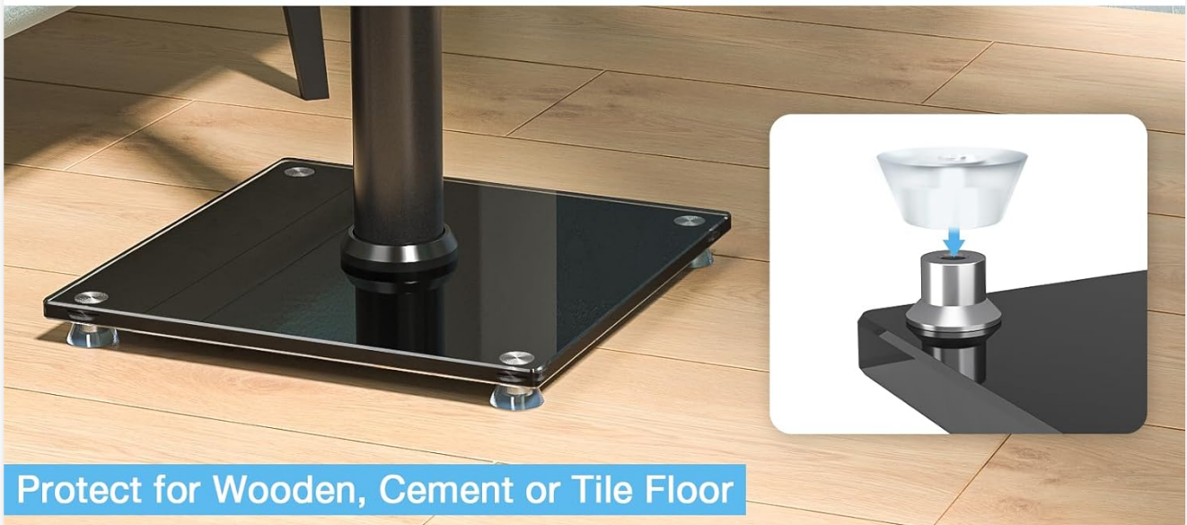
Figure 5: Floor Protection Options