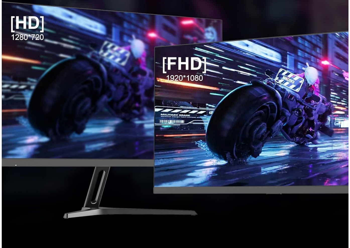
Image: A side-by-side comparison illustrating the enhanced image quality of the SANSUI monitor, showing the difference between HD (1280x720) and Full HD (1920x1080) resolution, along with features like 300cd/m 2 brightness, 16.7M color gamut, 100% sRGB, and HDR for true colors.