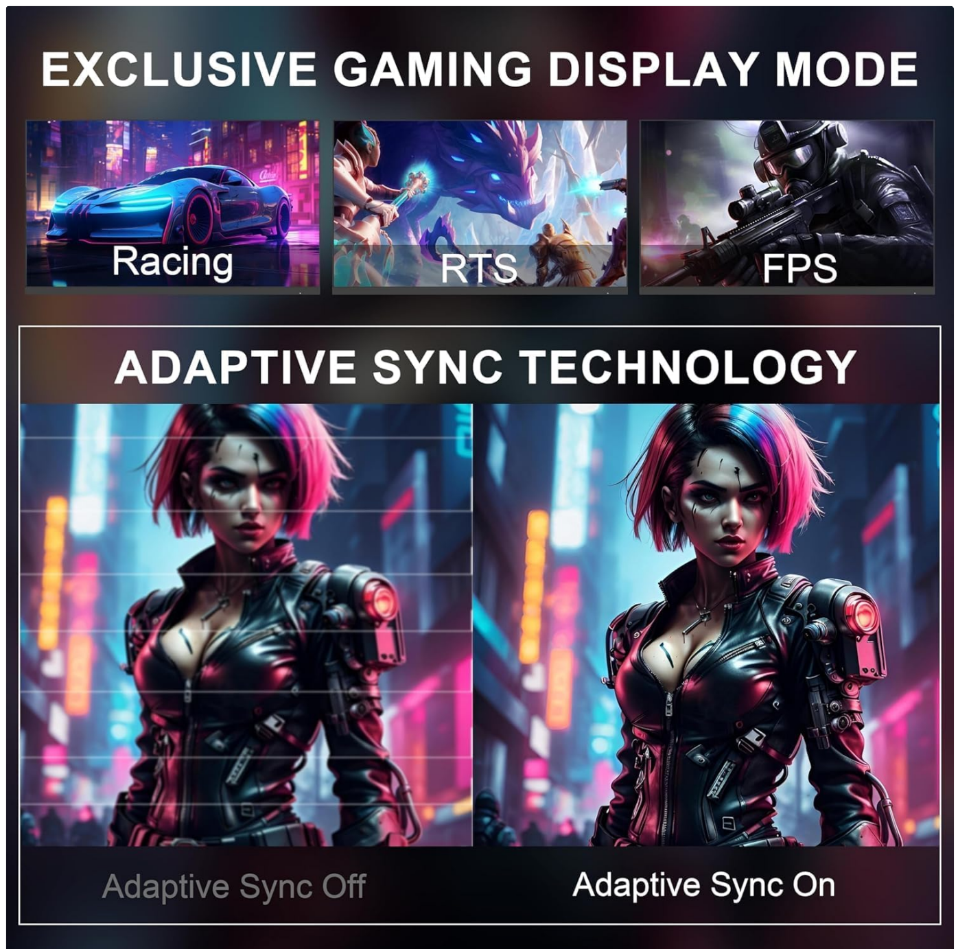
Image: The SANSUI monitor showcasing exclusive gaming display modes (Racing, RTS, FPS) and demonstrating the effect of Adaptive Sync technology, which eliminates screen tearing and stuttering for a smoother visual experience.