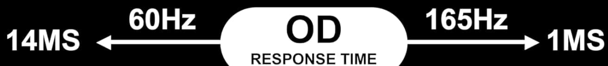
Image: A visual comparison demonstrating the difference between 14ms response time at 60Hz and 1ms response time at 165Hz on the SANSUI monitor, highlighting the improved clarity and reduced motion blur with faster response times.