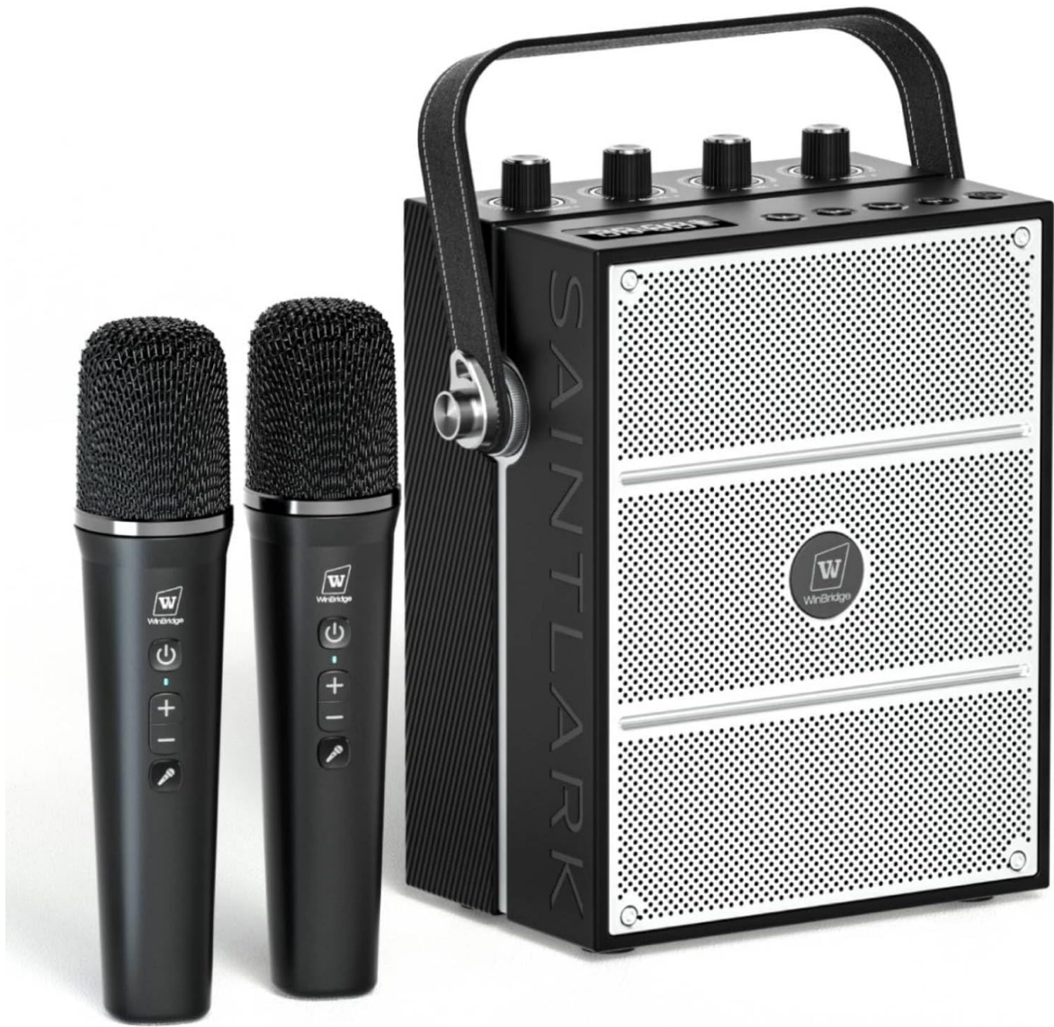
The S99 Voice Amplifier unit with its two accompanying wireless microphones.

The amplifier boasts a 100W output powered by a 6.5-inch woofer and a 2-inch tweeter for 360-degree omnidirectional sound.