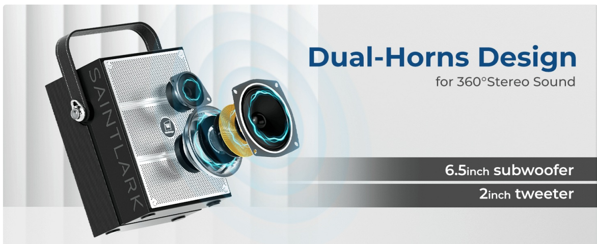
Internal view of the dual-speaker design for 360-degree stereo sound.

The amplifier boasts a 100W output powered by a 6.5-inch woofer and a 2-inch tweeter for 360-degree omnidirectional sound.