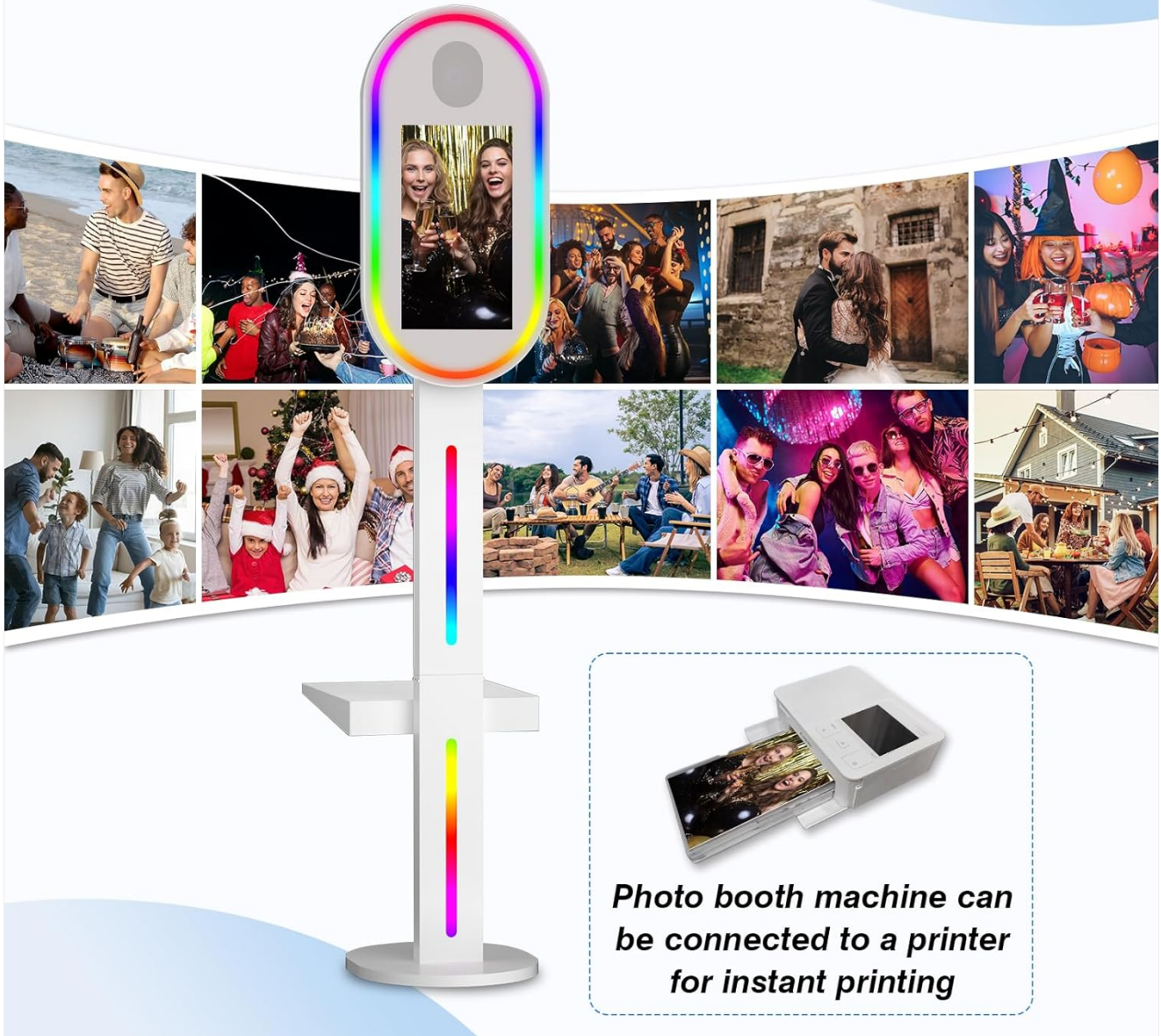
Figure 5: The photo booth unit demonstrating connectivity to a printer for instant photo printing, suitable for various events.