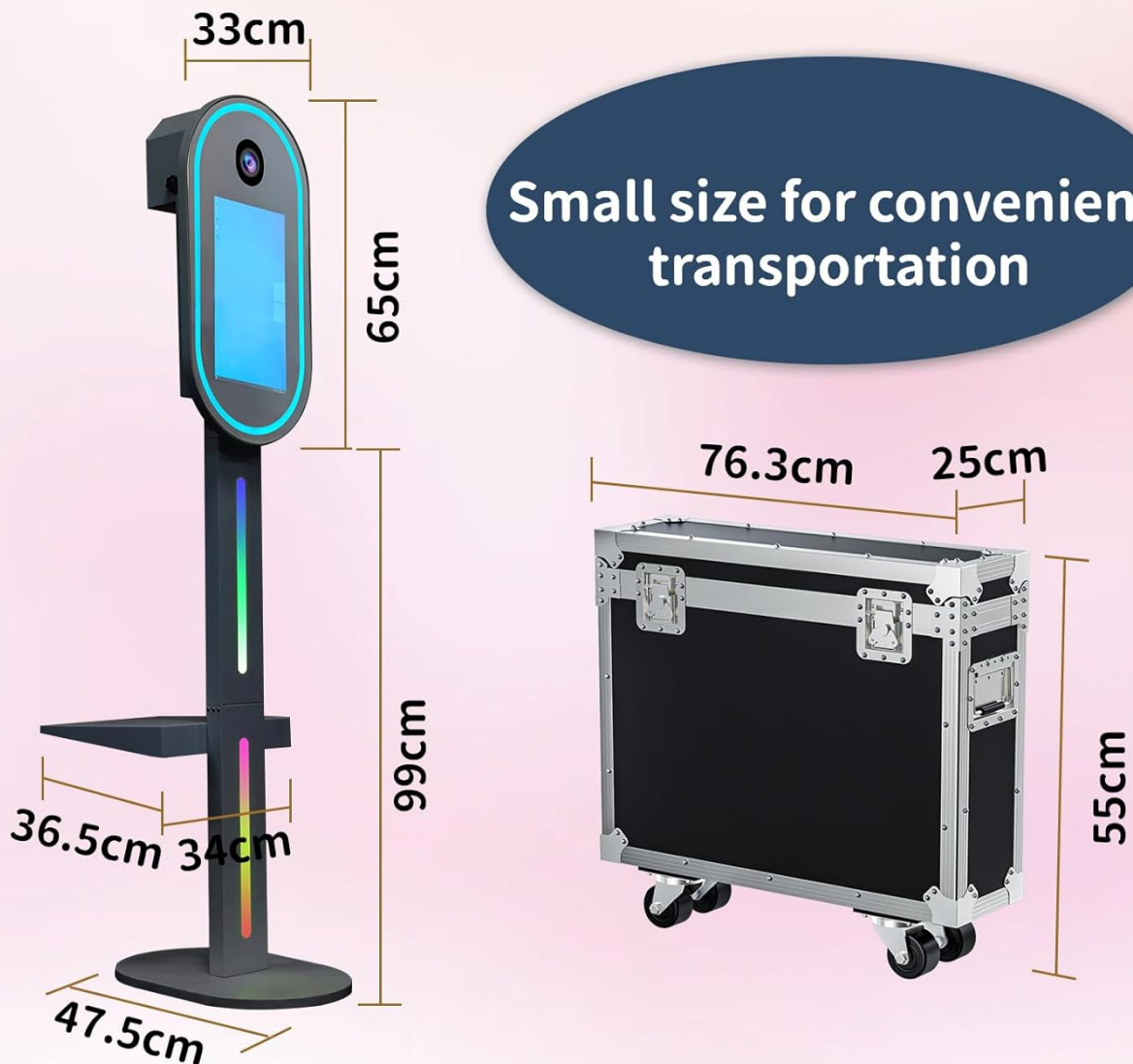
Figure 4: Product dimensions for the photo booth and its flight case, highlighting its compact size for transportation.