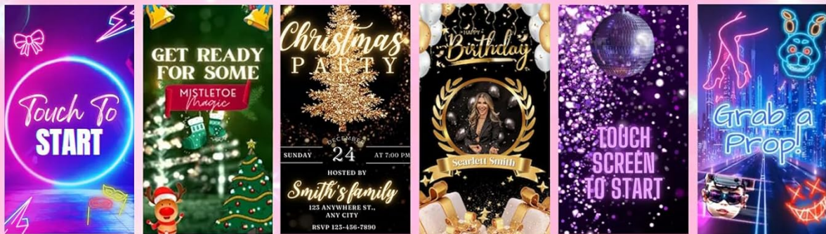
Figure 6: Various customization options including electronic animations, dynamic photo frames, multiple photo templates, and custom themes.