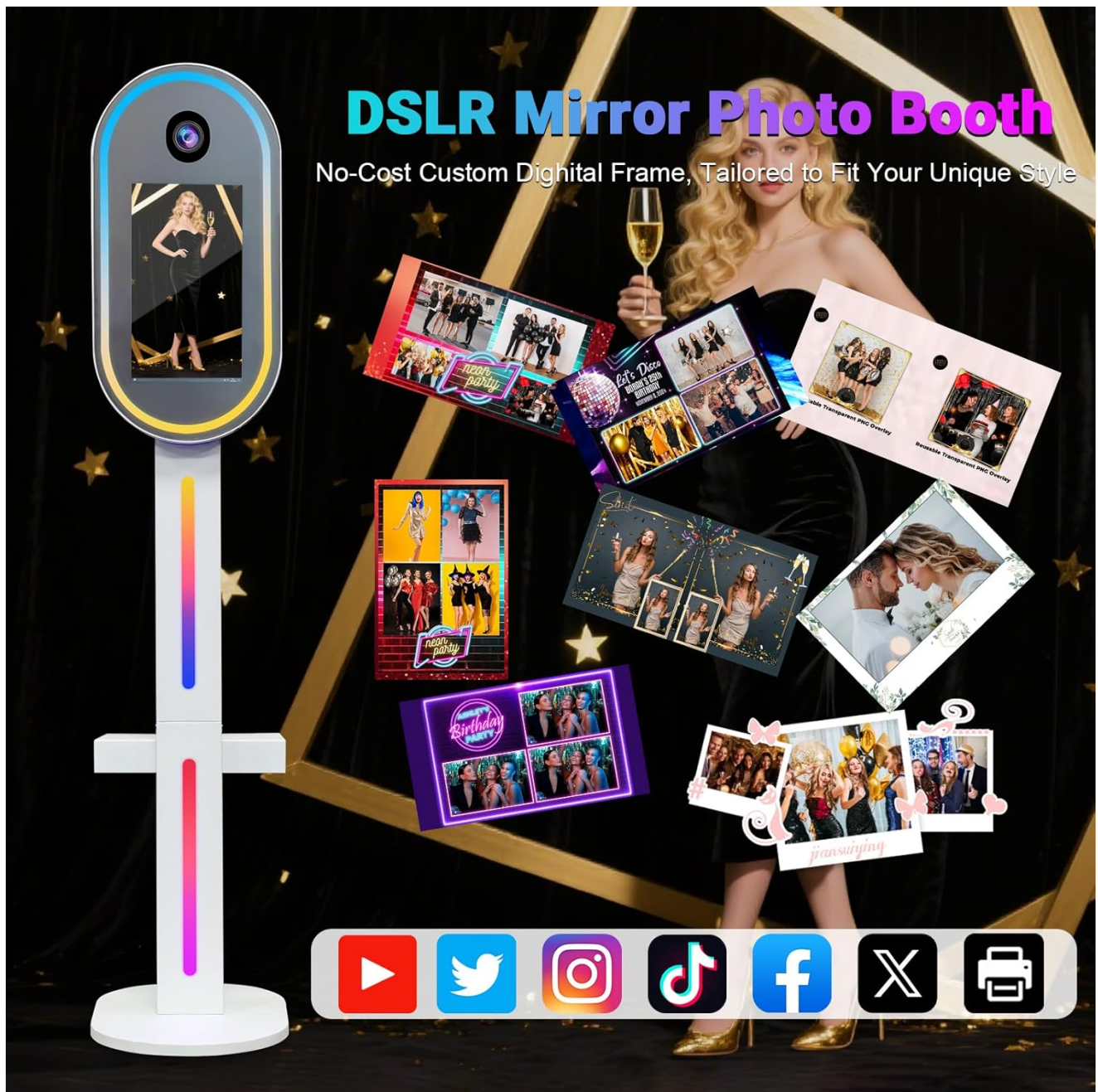
Figure 9: The photo booth displaying social media sharing options, allowing users to instantly share their photos online.