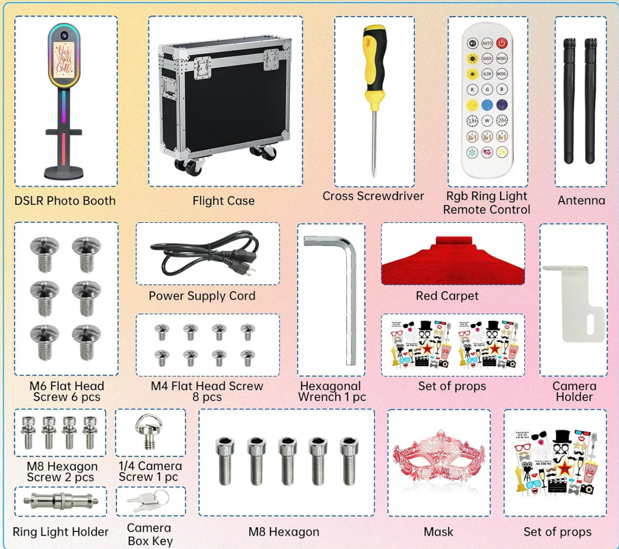
Figure 2: A visual representation of all accessories included in the package.