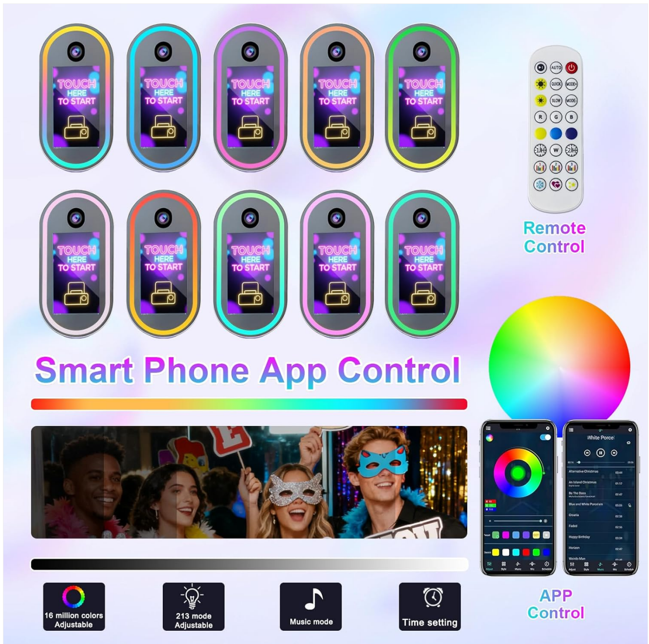
Figure 8: The smartphone app provides extensive control over RGB lighting, including 16 million colors, 213 modes, music synchronization, and time settings.