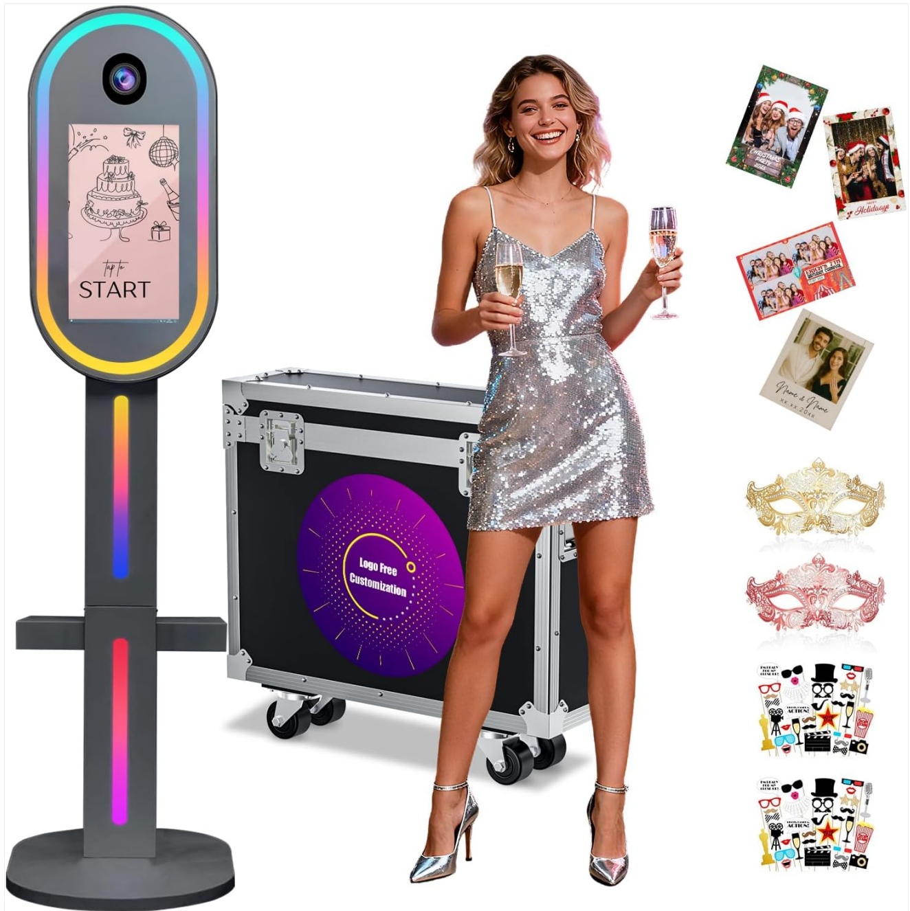
Figure 1: The Pikiu 15.6-inch Interactive Touchscreen Mirror Photo Booth, shown with its flight case and various event props.