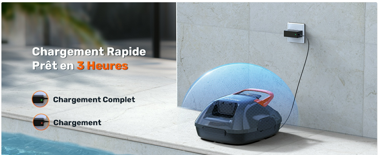
Image: The Gosvor LiteVac 800-GS connected to its charger, illustrating the fast charging process which takes 3 hours for a full battery.