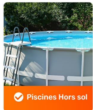
Image: Illustrates the compatibility of the Gosvor LiteVac 800-GS with various pool types, specifically above-ground and flat-bottom pools up to 80m 2 , while indicating unsuitability for pools over 80m 2 or with inclined bottoms.