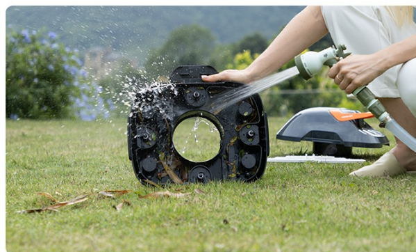
Image: Demonstrates the easy cleaning process: rinsing the filter basket and the main unit of the cleaner with a hose to remove debris.