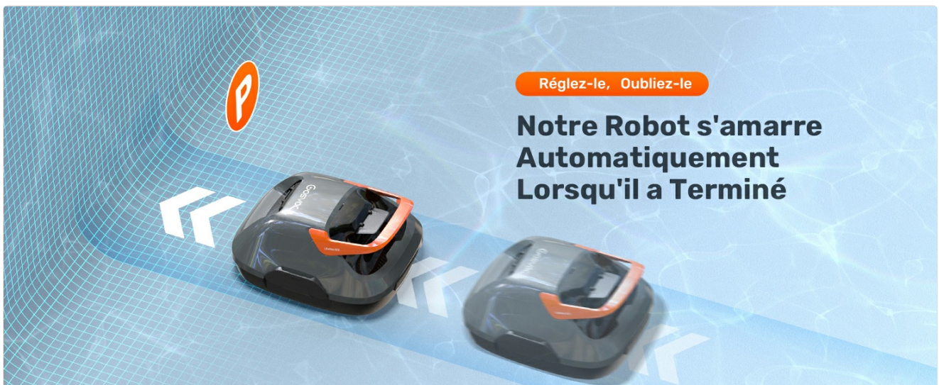
Image: Two Gosvor LiteVac 800-GS units demonstrating their automatic parking function, returning to the pool edge after completing their cleaning tasks.

Once the cleaning cycle is complete or the battery level is low, the LiteVac 800-GS will automatically navigate to the edge of the pool for easy retrieval.