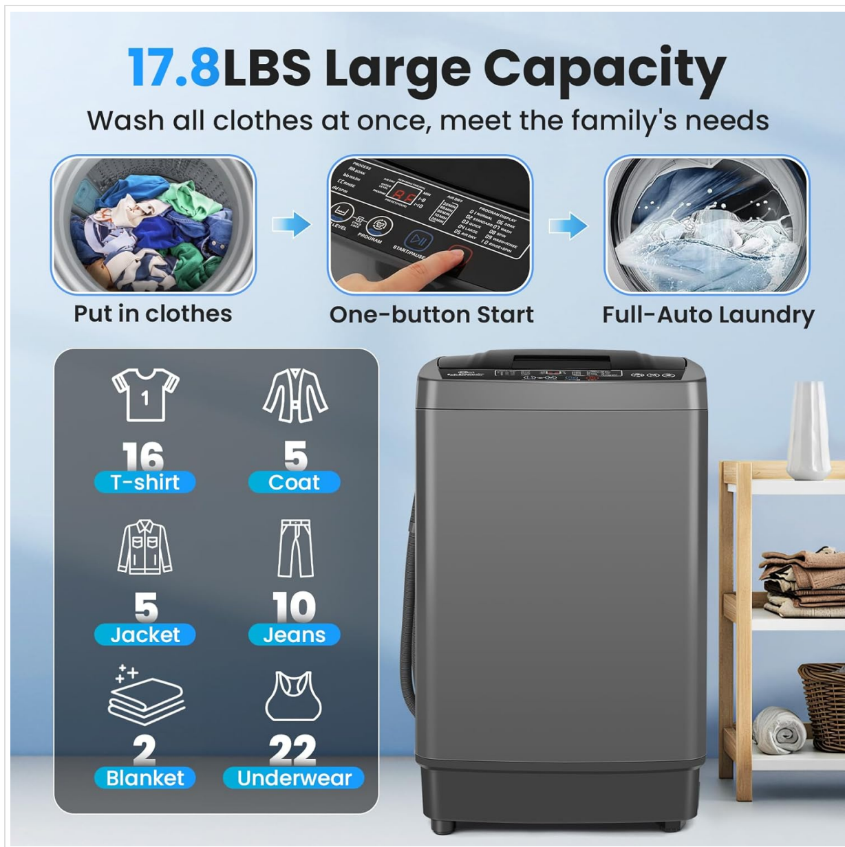
Image: The Nictemaw Portable Washing Machine in grey, showing its compact size and top-loading design. Clothes are visible inside the drum, and the control panel is highlighted.