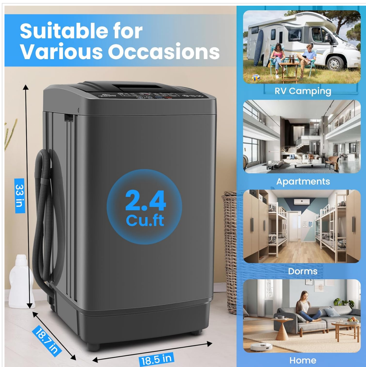
Image: A visual representation of the washing machine's dimensions (18.5" x 18.7" x 33") and examples of suitable locations such as RVs, apartments, dorms, and homes.