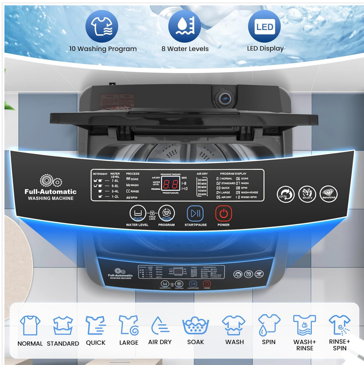
Image: A close-up of the washing machine's control panel, detailing the 10 wash programs, 8 water levels, and various function buttons including Power, Start/Pause, Water Level, and Program.