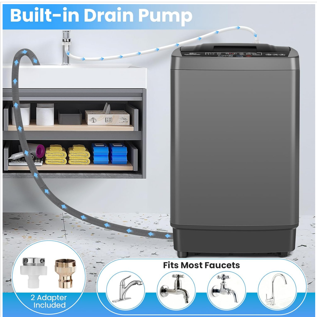
Image: The portable washing machine's drain hose is shown extending into a sink, illustrating the built-in drain pump feature and the included faucet adapters.