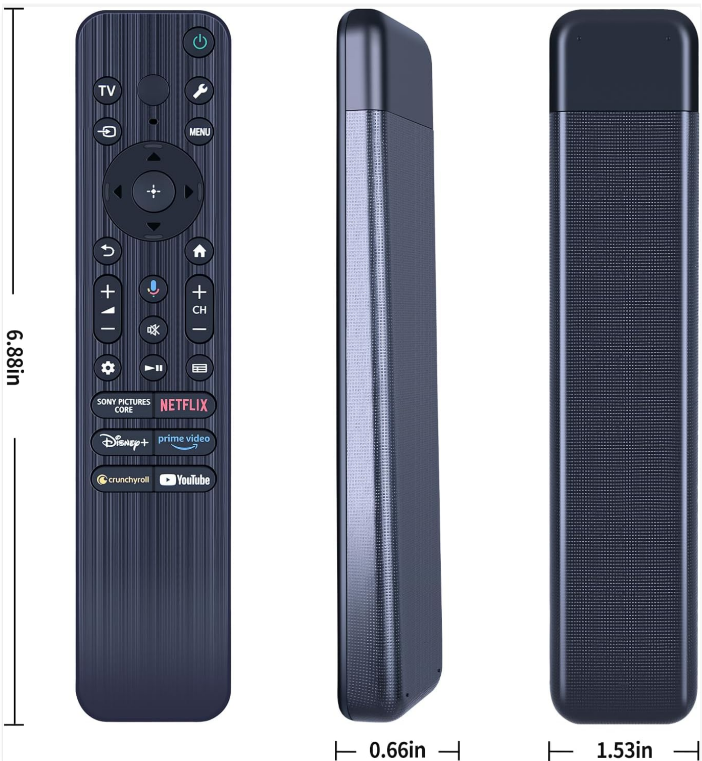
Figure 6: Detailed dimensions of the ZWP RMF-TX820U remote control.