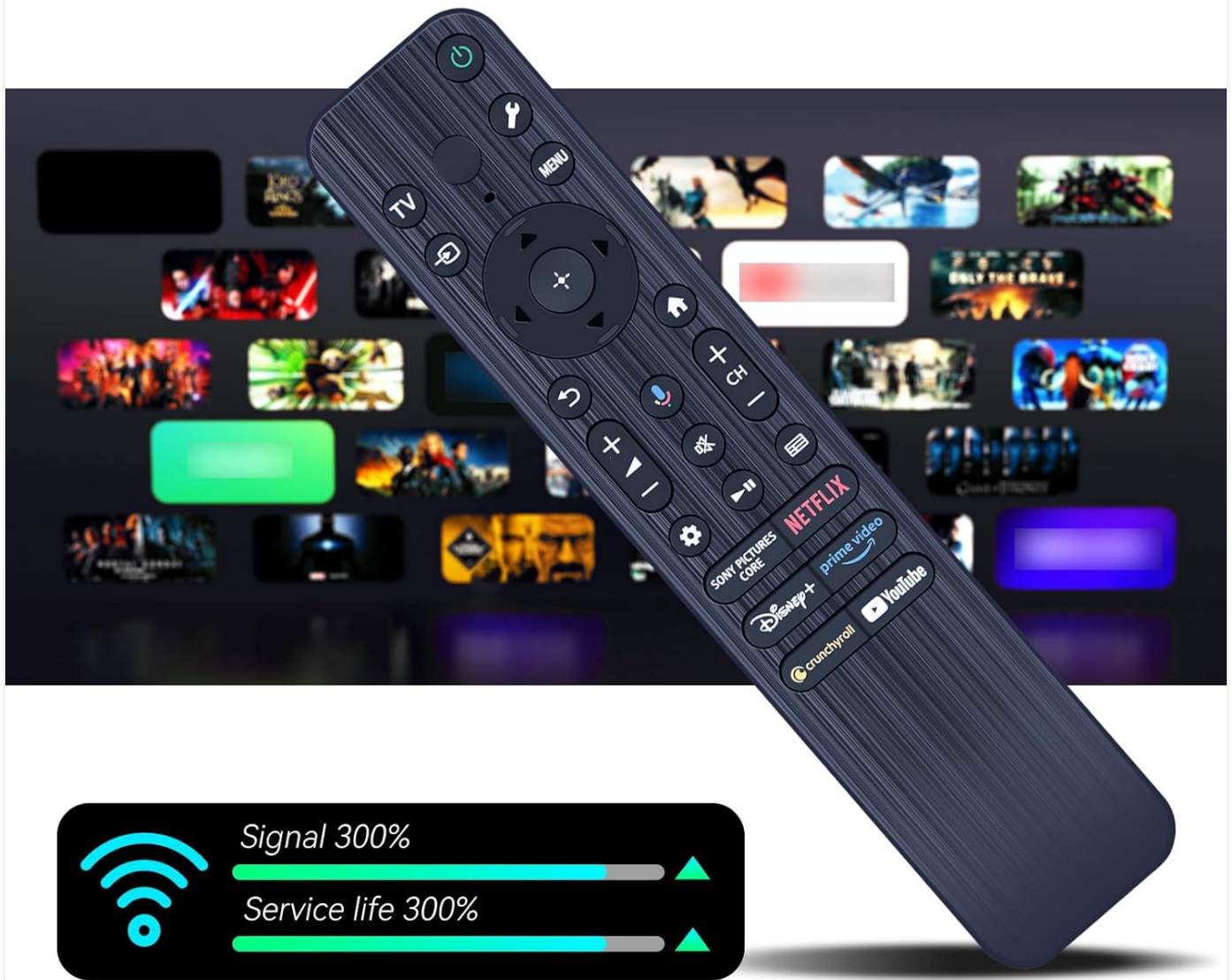
Figure 5: Depiction of the remote's quick response time and strong signal transmission.

Important Note: As stated in the product title, this RMF-TX820U replacement remote control does not include voice function capabilities. Any visual representations or buttons on the remote that might suggest voice control are non-functional for this specific model.