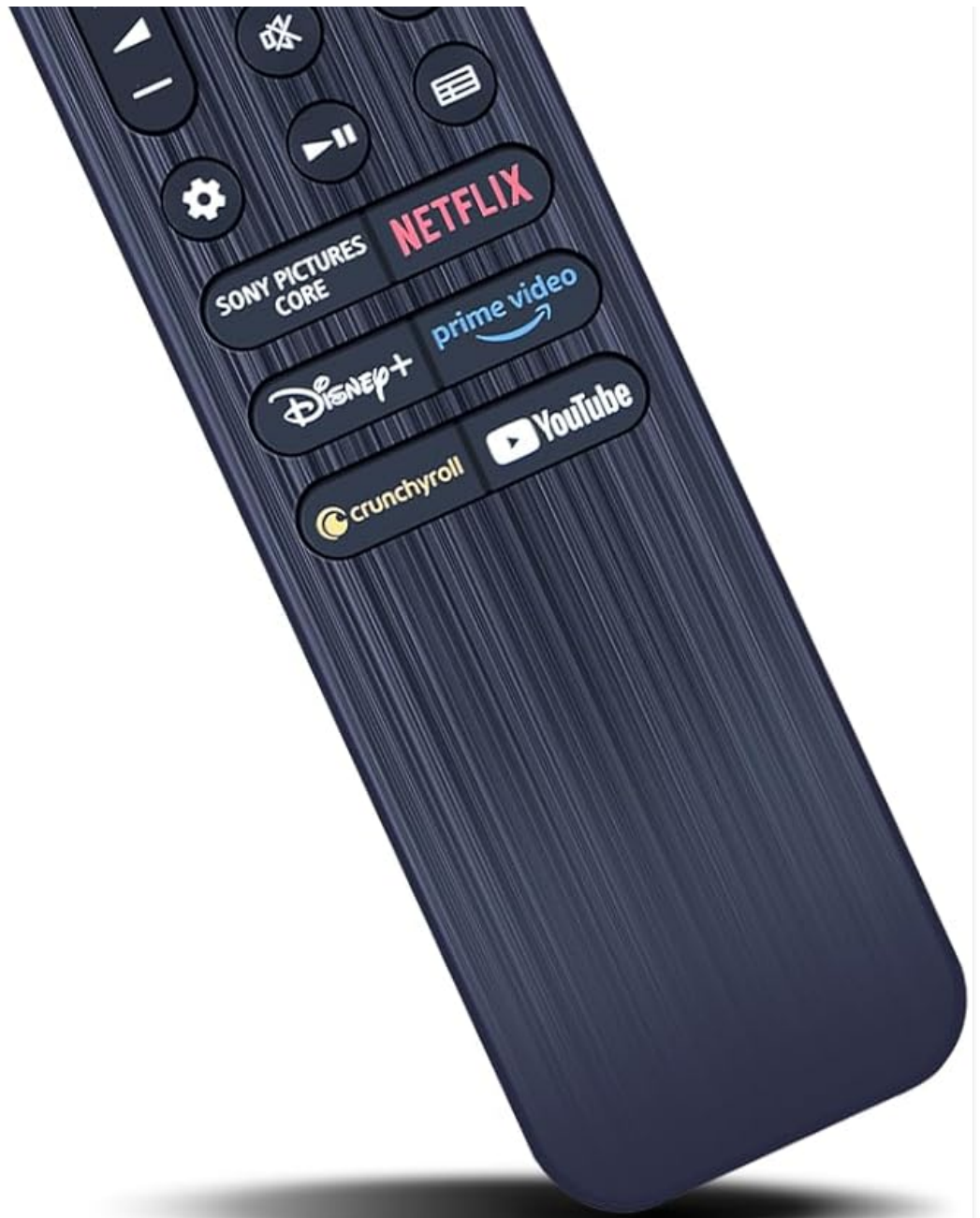
Figure 1: The ZWP RMF-TX820U Replacement Remote Control, showcasing its ergonomic design and button layout.