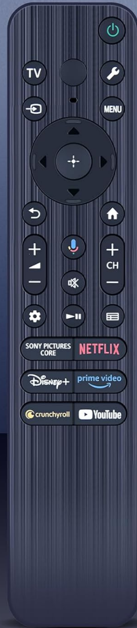
Figure 7: Key features of the remote, including long life, ABS material, comfortable feel, and quality assurance.