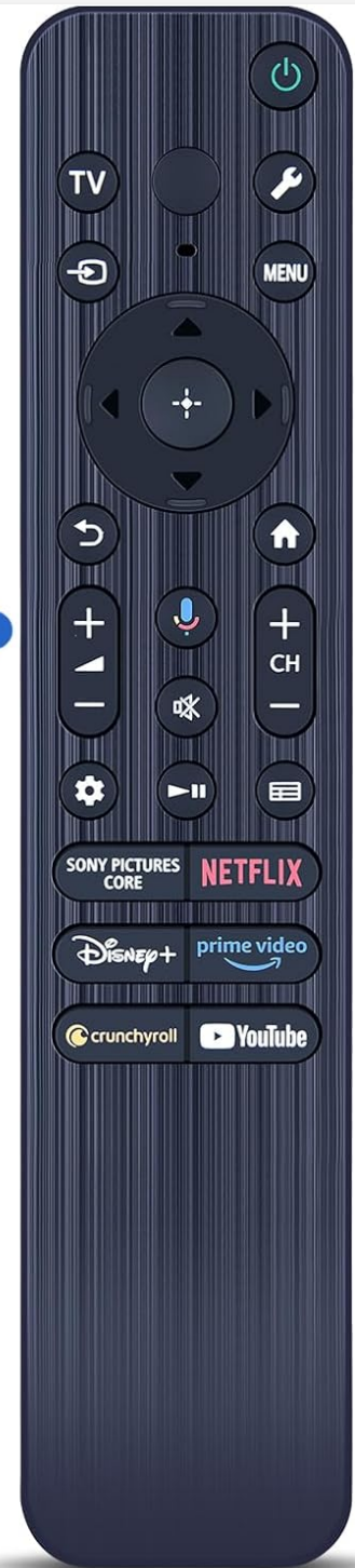
Figure 3: The remote control highlighting the dedicated shortcut buttons for popular streaming applications.