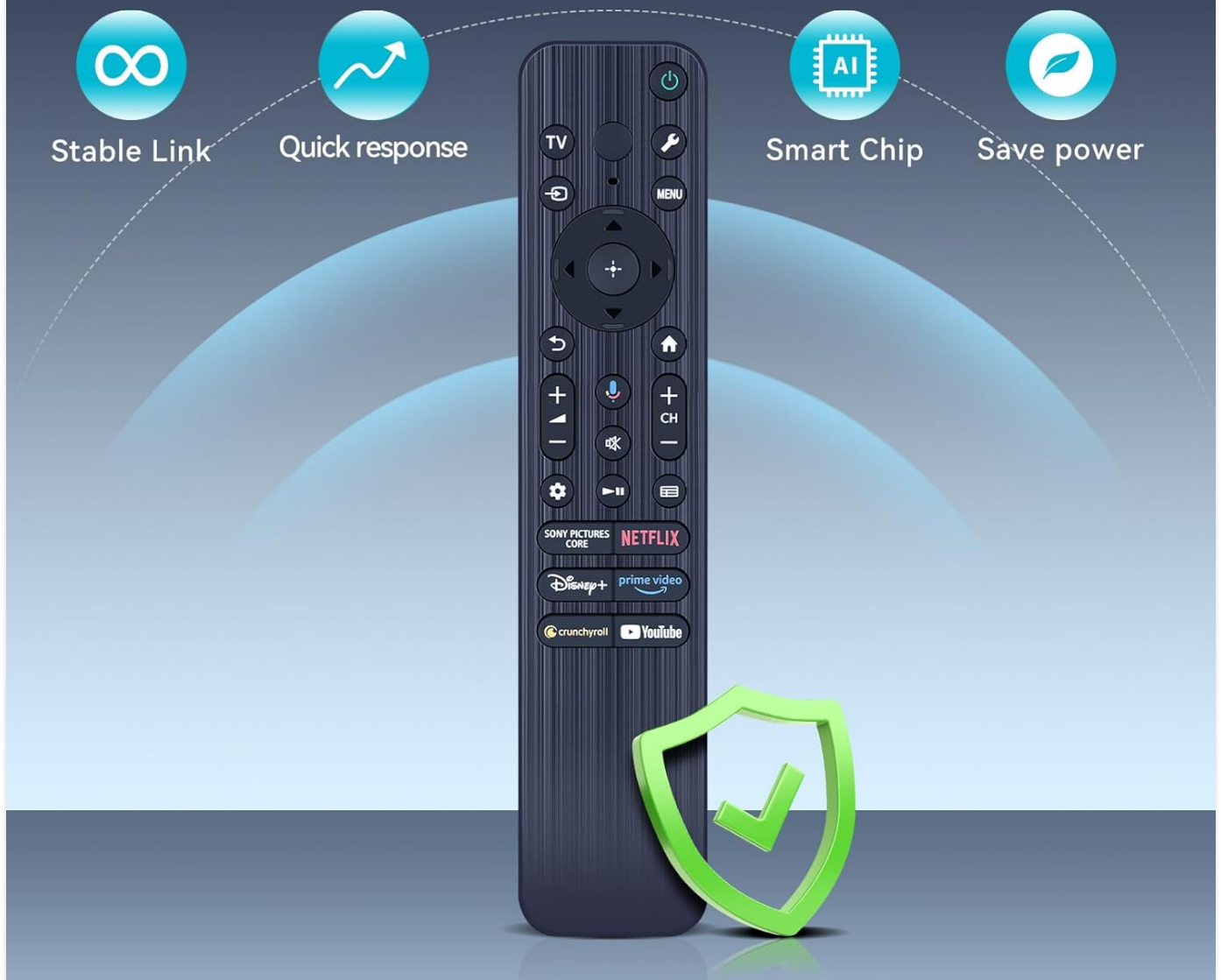
Figure 8: Overview of the remote's stable and smart performance, including stable link, quick response, smart chip, and power saving.