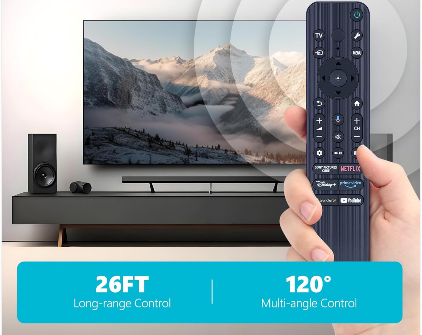
Figure 4: Visual representation of the remote's long-range (26ft shown, product states 40ft) and multi-angle (120°) control capabilities.