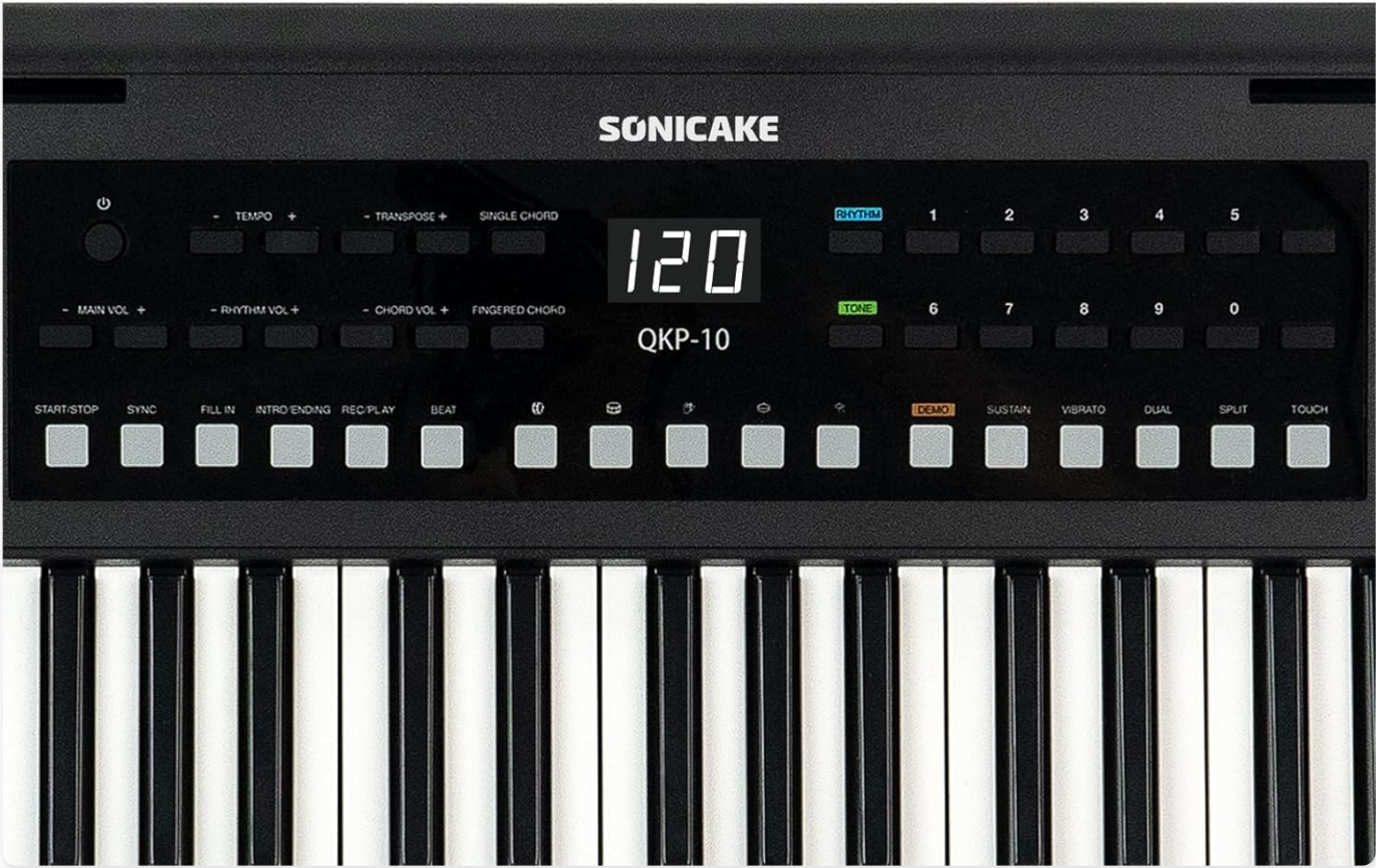
Figure 4.4: Detailed view of the control panel, showing buttons for various functions like Tempo, Transpose, Chord modes, Demo, Sustain, Vibrato, Dual, Split, and Touch.

Clear panel function indicators, with a built-in recording feature, making it easy for beginners to practice without barriers.