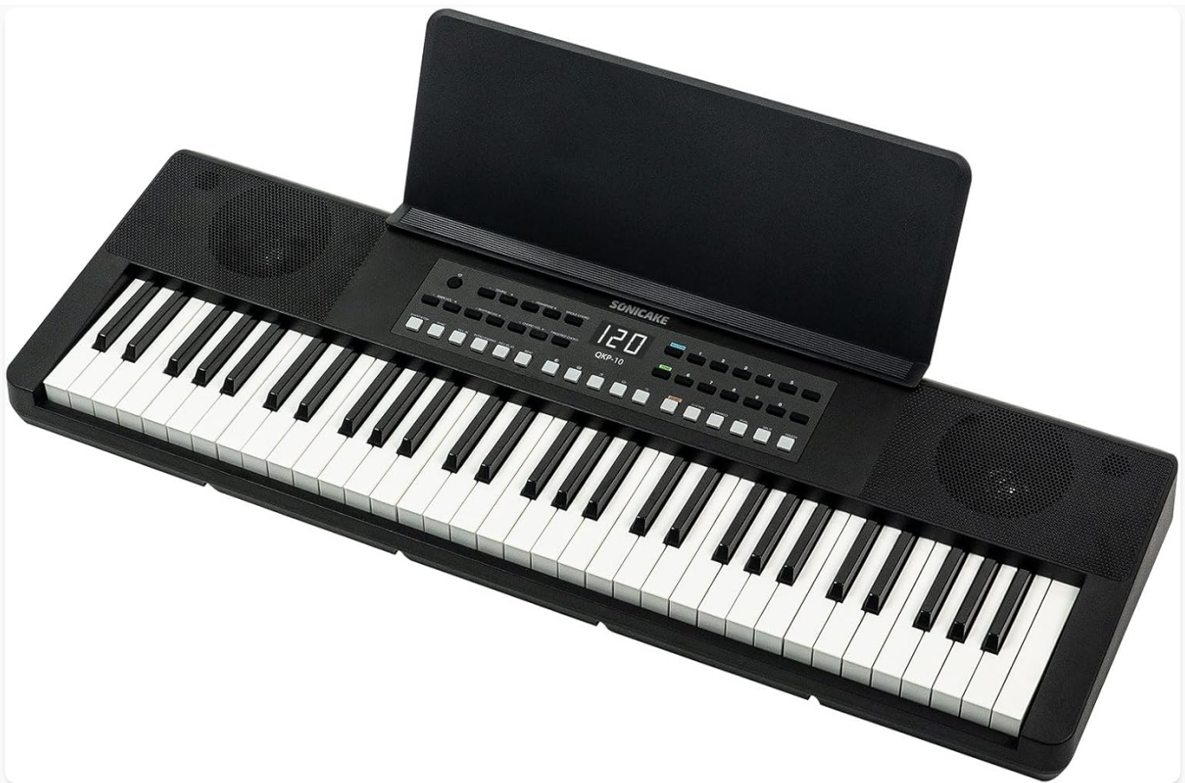
Figure 2.1: Overview of the SONICAKE QKP-10 Digital Electronic Piano Keyboard with music rest.