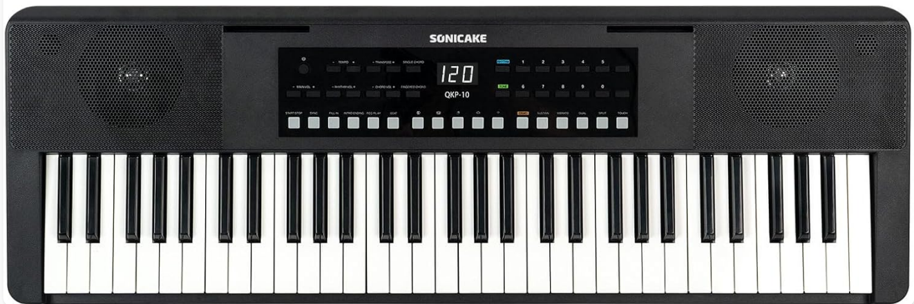
Figure 4.2: Control panel highlighting the 300 Tones, 300 Rhythms, and 80 Demo songs available.