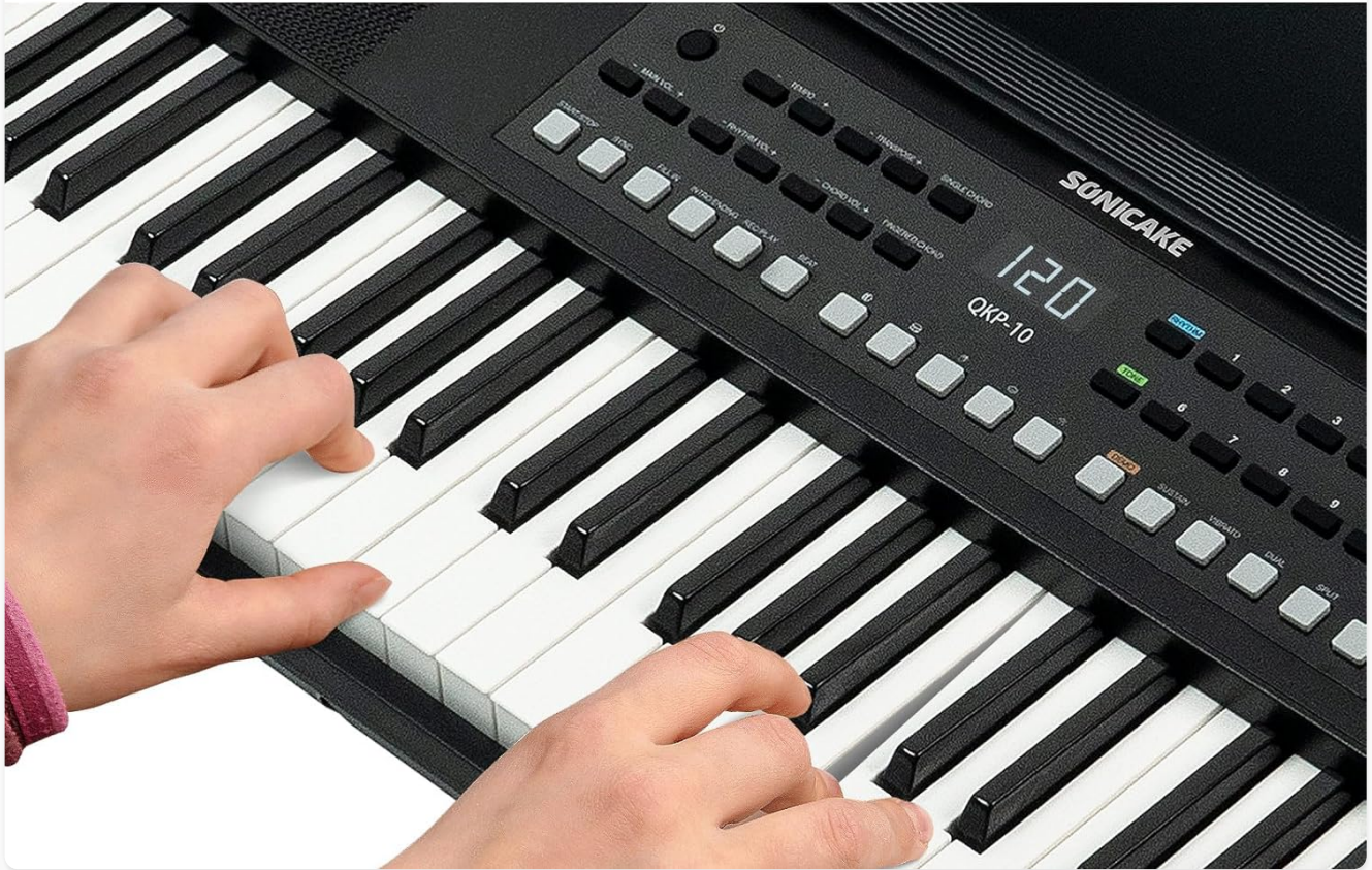
Figure 4.1: User interacting with the keyboard and its control panel.

Elevate your practice, performance, and music creation with Sonicake's innovative keyboard, crafted for musicians at every level.