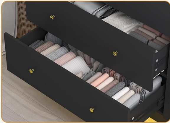
2 Deep drawers