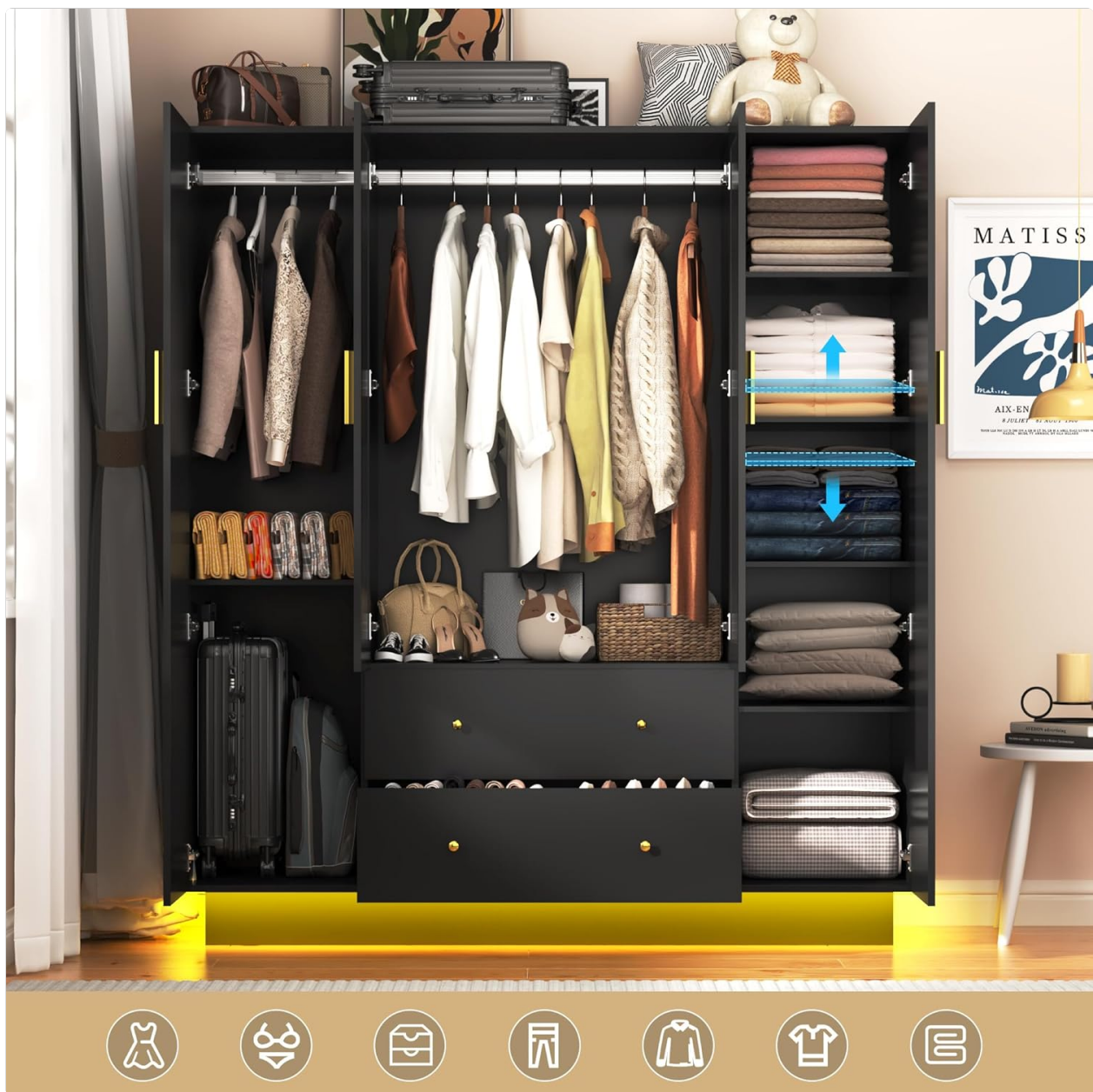
Figure 3.2: Interior view showcasing the hanging area, stacking area with adjustable shelves, and two deep drawers for organized storage.