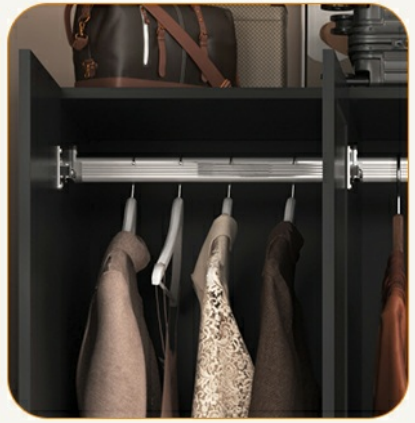
Removable hanging rod