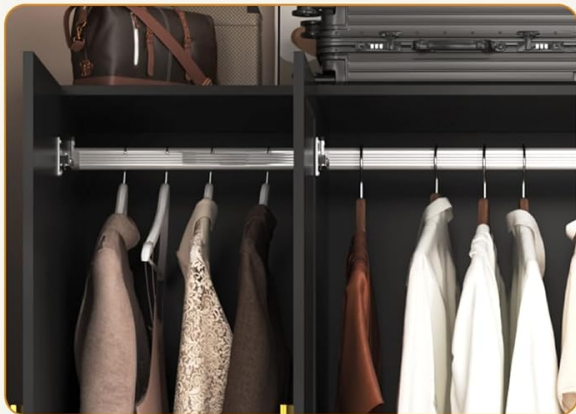
Removable hanging rod