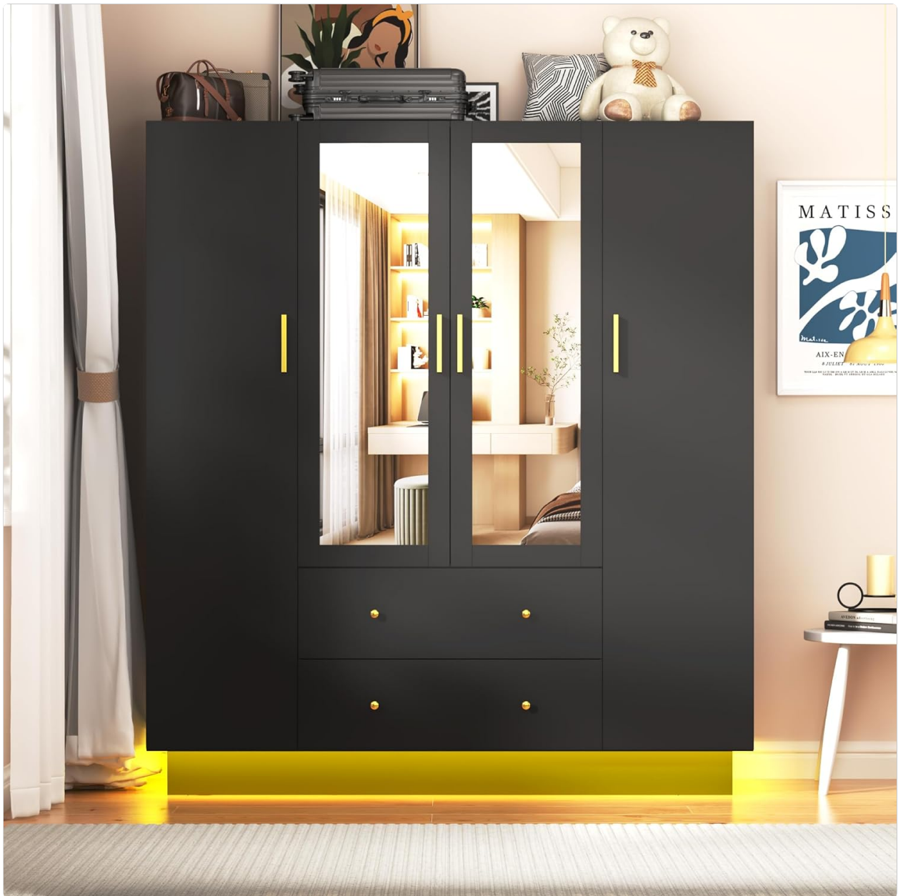
Figure 1.1: The chartustriable 4-Door Armoire Wardrobe Closet, featuring a black finish, four doors, two central mirrored doors, two lower drawers, and integrated LED lighting at the base.