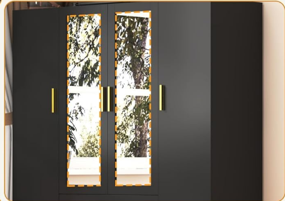
Clear half-length mirror