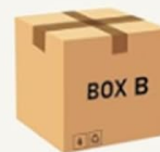
Figure 3.1: Detailed dimensions of the wardrobe: 19.7"D x 63"W x 70.1"H. Note that the product ships in two packages.