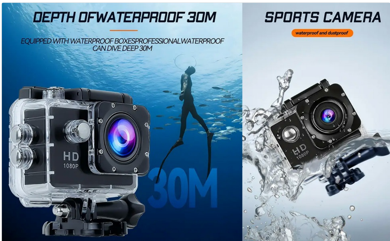
Image: The camera in its waterproof housing, demonstrating its capability for underwater use up to 30 meters.