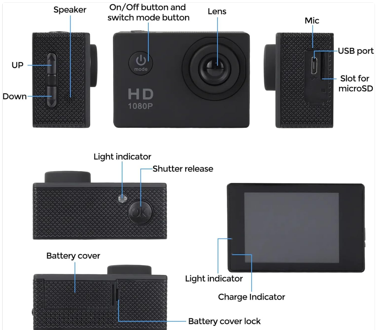
Image: Labeled diagram of the camera's external features, including the lens, speaker, USB port, microSD slot, power/mode button, up/down buttons, shutter release, light indicators, and battery cover.

Familiarize yourself with the camera's components and controls.