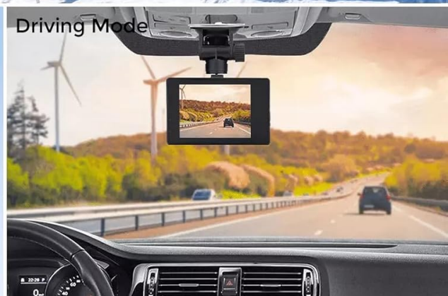
Image: Examples of various recording modes including Time Lapse, Dramashot for burst photos, Image Rotation, Loop Recording, and Driving Mode for dashcam functionality.