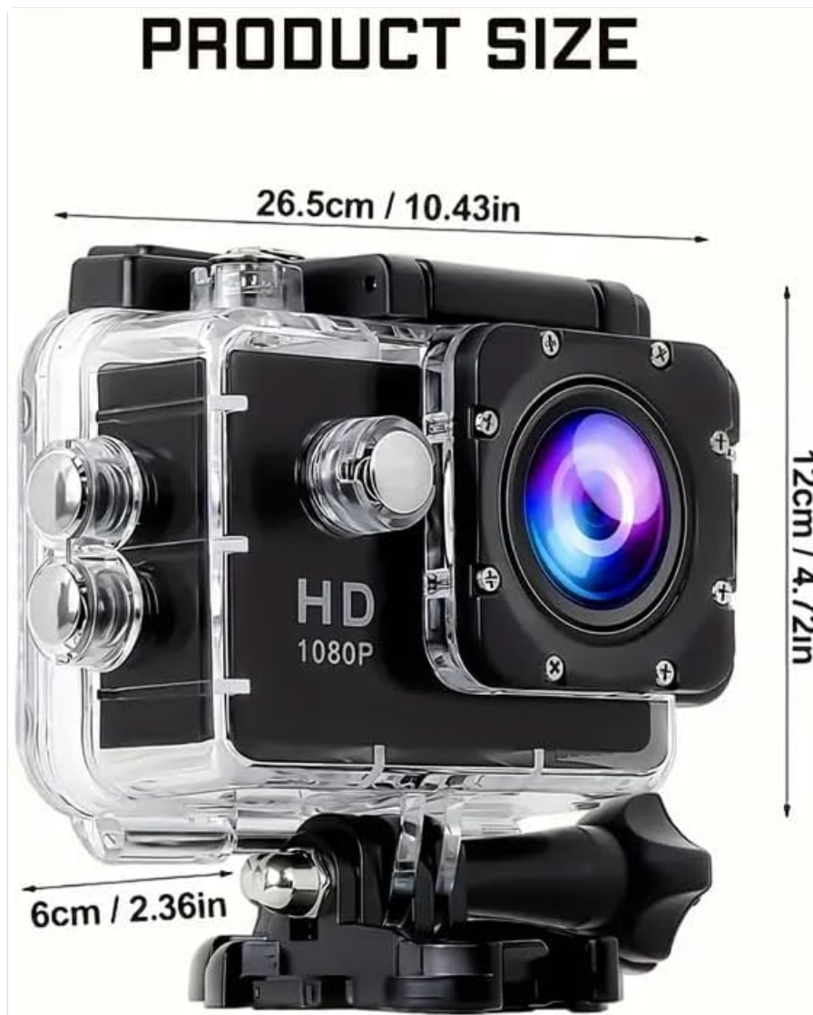
Image: Product dimensions of the camera, approximately 26.5cm (10.43in) wide, 12cm (4.72in) high, and 6cm (2.36in) deep.