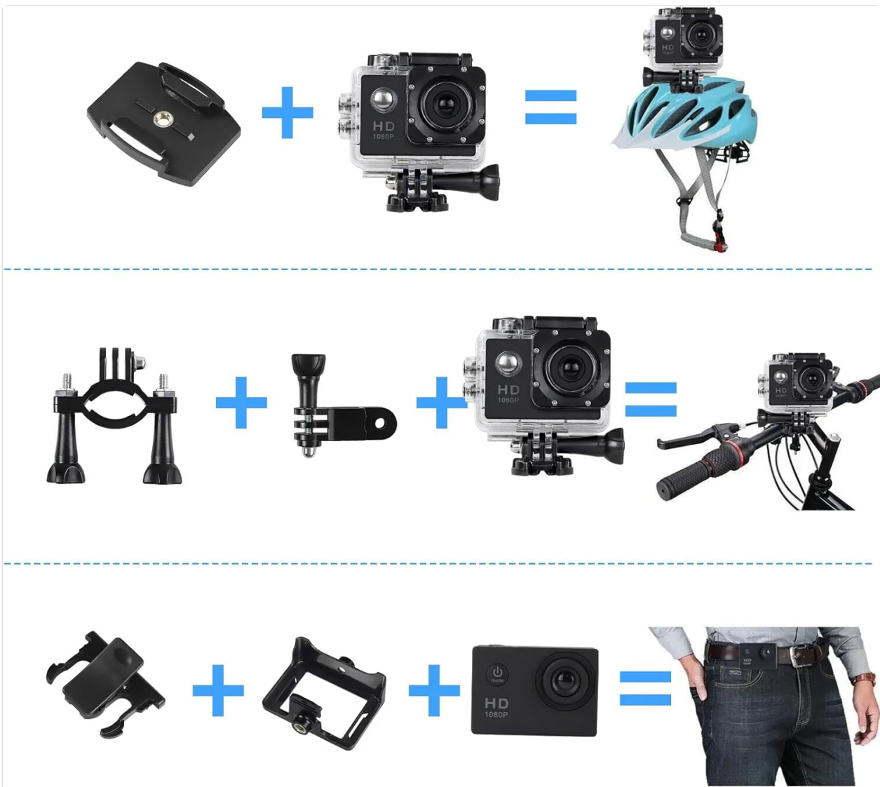
Image: Visual guide for attaching the camera to a helmet, bicycle, and belt using the provided mounting accessories.