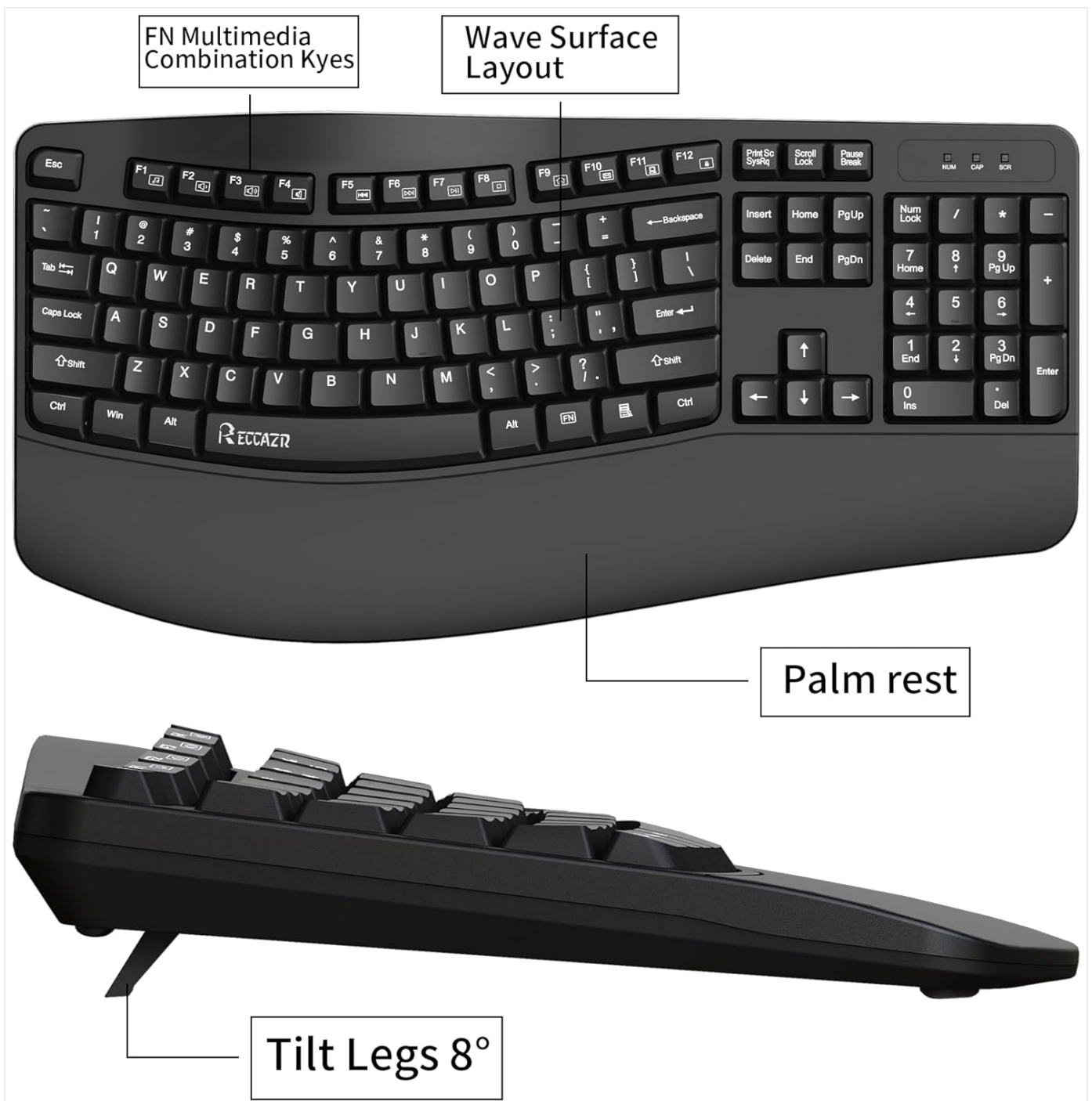
Figure 2: Demonstrates how the scientific wave keys and ergonomic curved surface are designed to fit each finger naturally, maximizing comfort during long typing sessions.