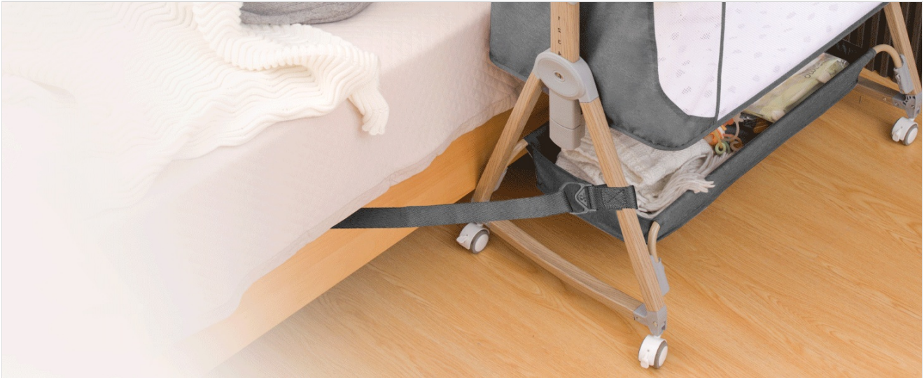
Image: A close-up view demonstrating the proper method for securing the bassinet to an adult bed using the attachment straps for co-sleeping safety.