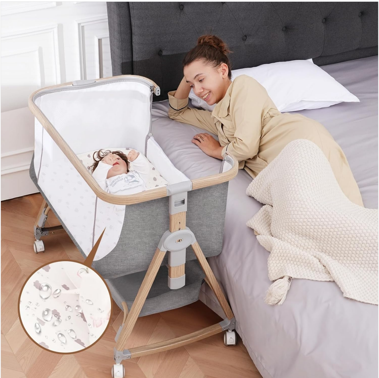
Image: The Jestonten Bassinet fully assembled and positioned next to an adult bed, demonstrating its bedside sleeper configuration. A baby is resting comfortably inside.