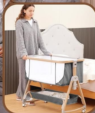
Standalone Baby Bassinet