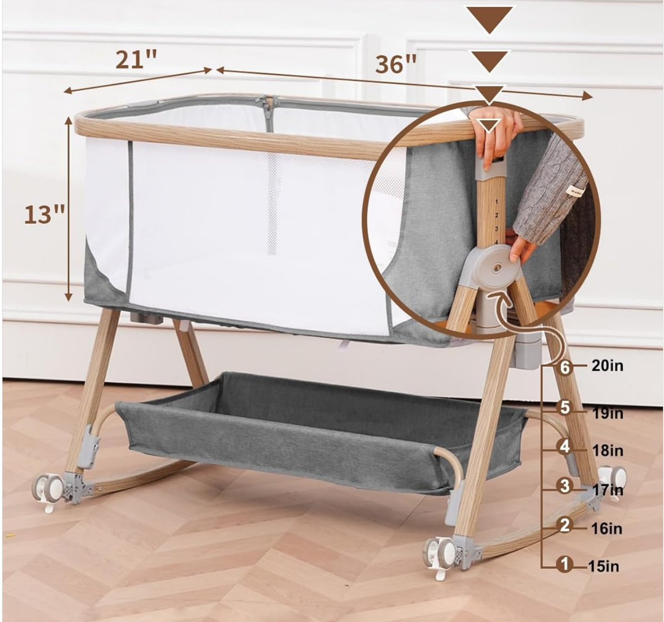
Image: A diagram detailing the six adjustable height settings of the bassinet, ranging from 15 inches to 20 inches, with overall dimensions of 36 inches long and 21 inches wide.