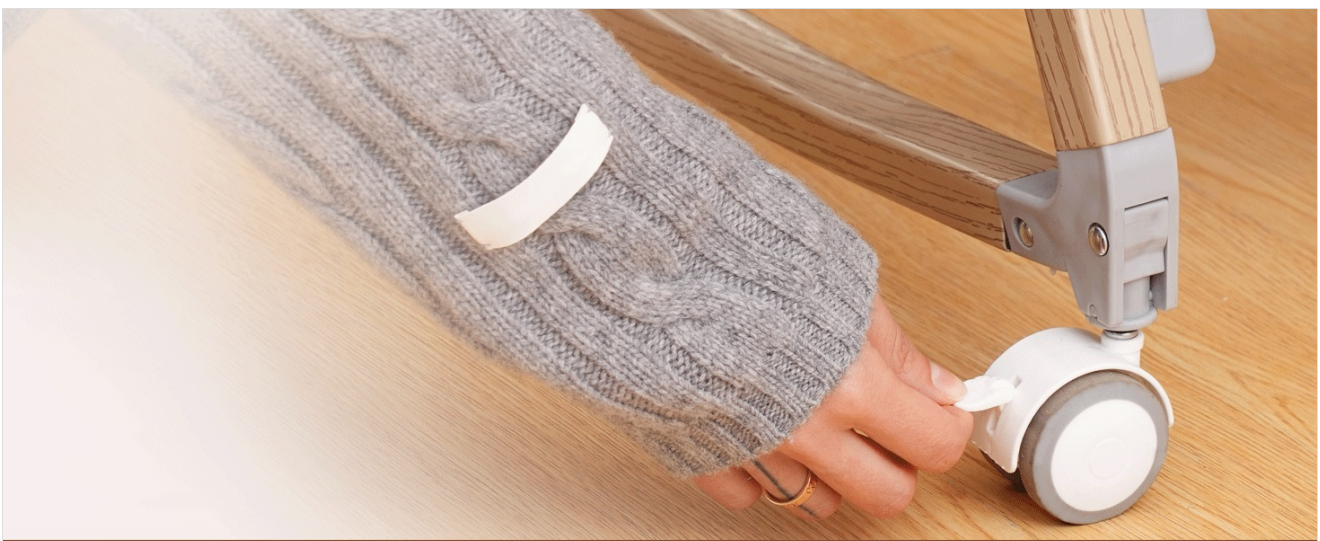
Image: A hand demonstrating how to engage the wheel lock mechanism on the bassinet for stability.