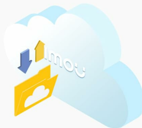
Image: Illustrates the various storage options available: MicroSD card (up to 512GB, not included), Network Video Recorder (NVR) for longer storage and multiple cameras, and Imou Cloud storage with a free 30-day trial.