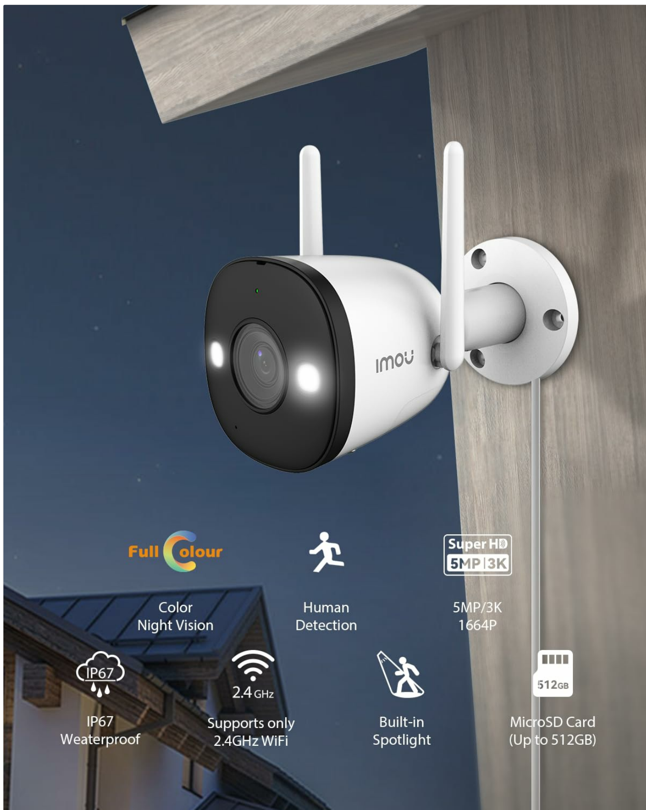
Image: Imou 5MP Outdoor Security Bullet Camera highlighting its key features including 5MP resolution, color night vision, human detection, IP67 weather resistance, 2.4GHz WiFi support, built-in spotlight, and up to 512GB MicroSD card support.