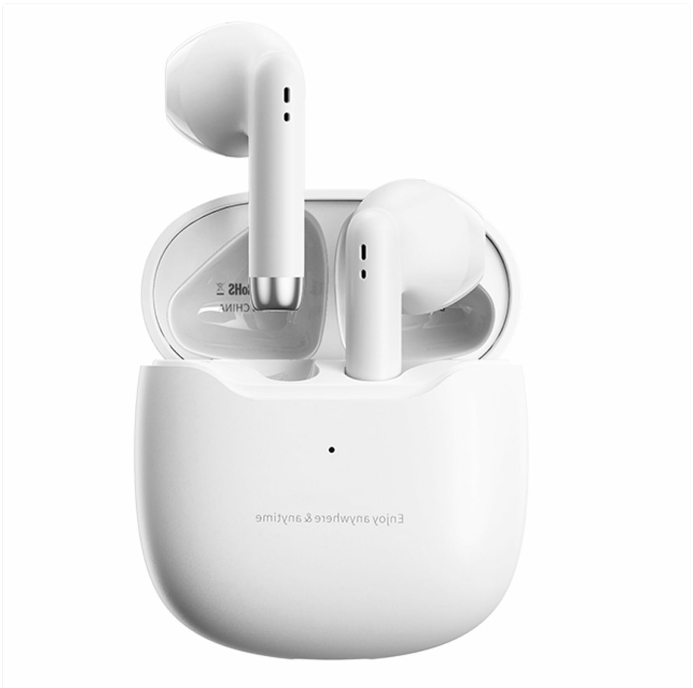
Image: The Tibesmi TWS-19 Wireless In-Ear Headphones, featuring the charging case and earbuds in white.