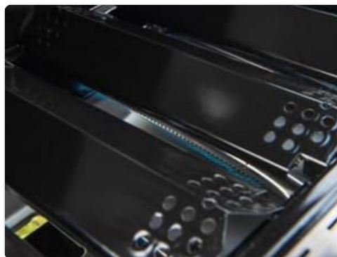
Image: Heat plates installed over burners.