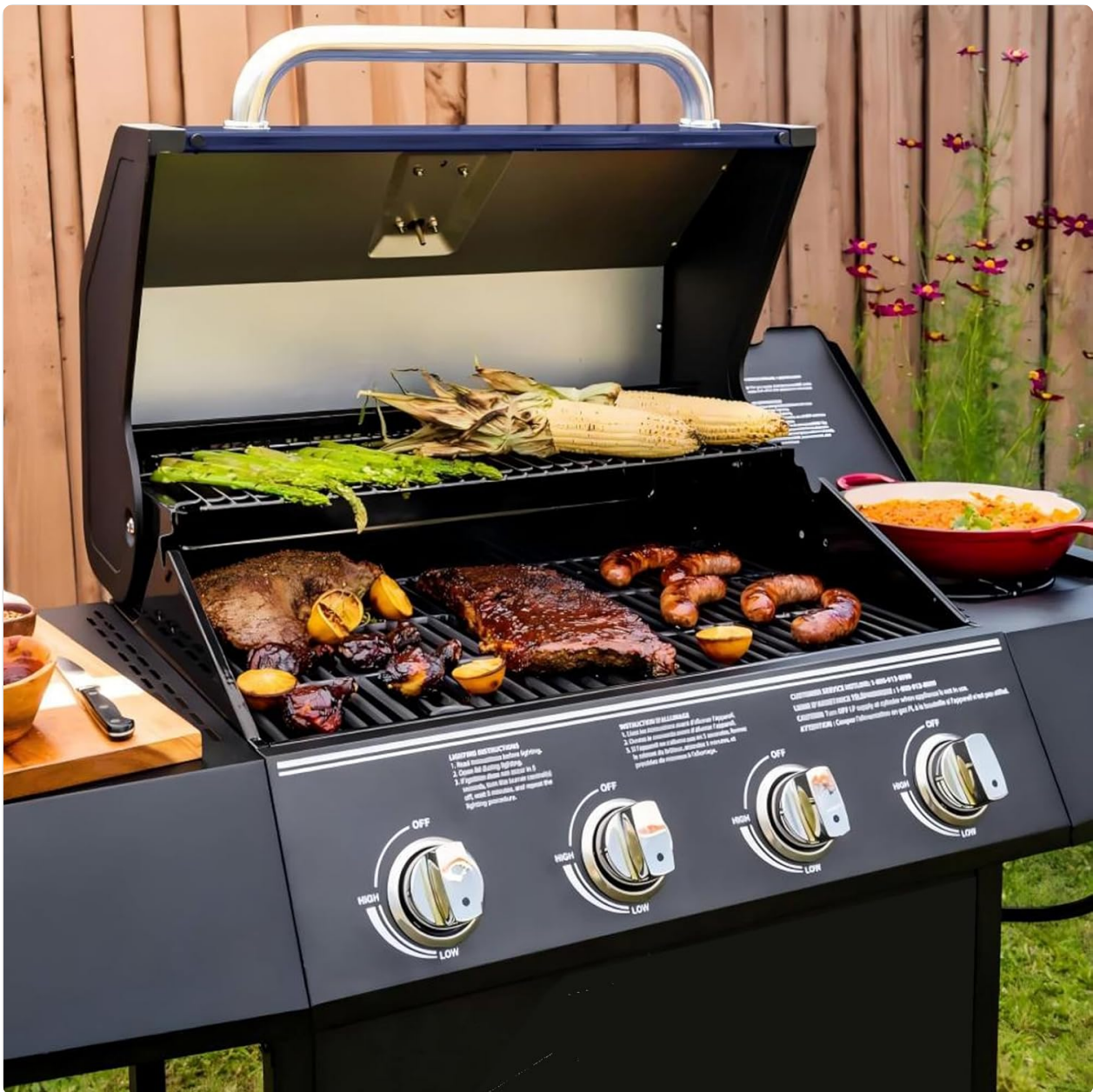
Image: Grill in operation with food.