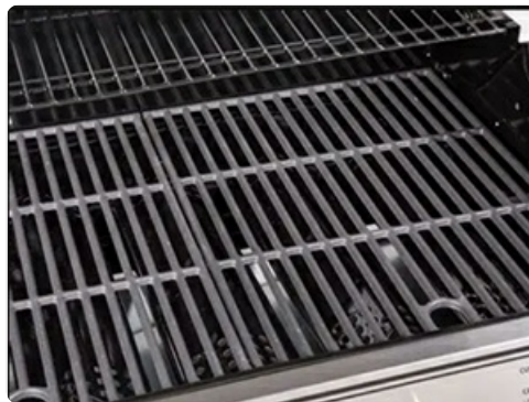
Image: Properly installed cooking grates.