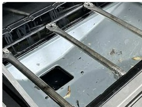
Image: Burners correctly installed.