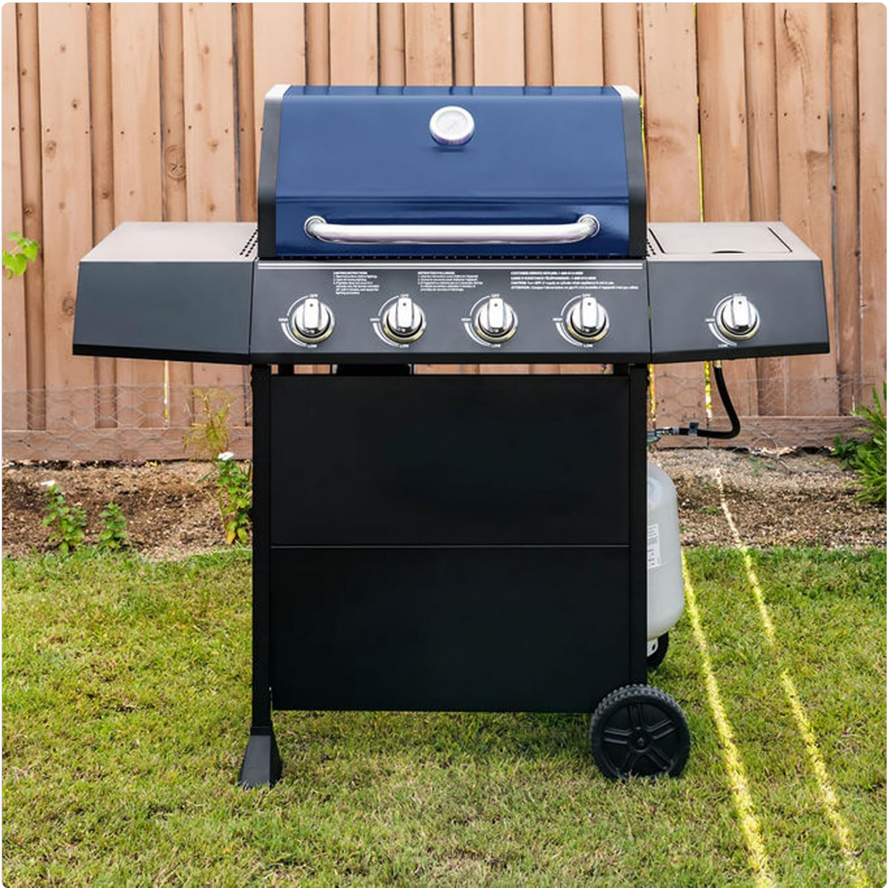
Image: Grill with new parts installed.