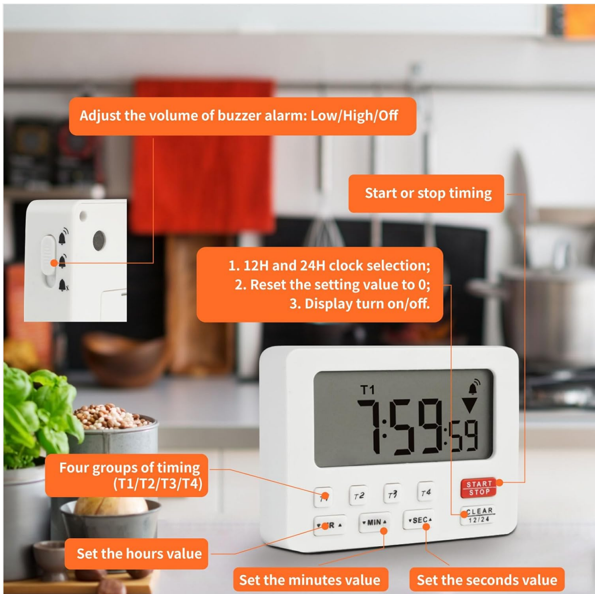
Detailed diagram illustrating the functions of the timer's buttons (HR, MIN, SEC, T1-T4, START/STOP, CLEAR) and the side switch for alarm volume adjustment.