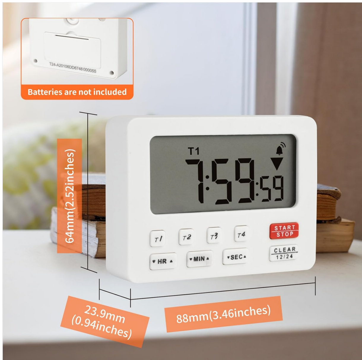
Rear view of the timer, indicating the battery compartment and overall dimensions. Batteries are not included.