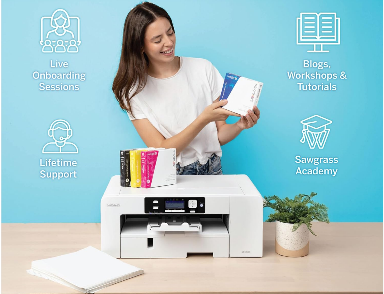
Figure 7.1: Sawgrass Lifetime Education & Support.