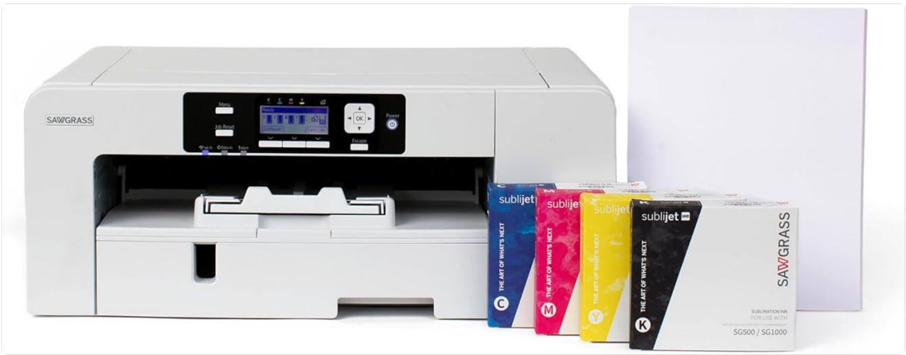
Figure 3.1: Sawgrass SG1000 Printer with accessories.

The printer's maximum color print resolution is 1200 x 1200 dpi, ensuring sharp and vibrant output for various sublimation projects.