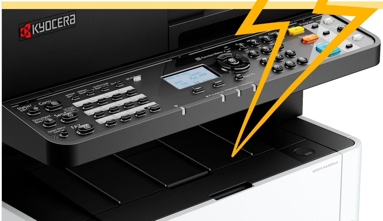
Image 5.4: The printer is compatible with Kyocera mobile apps and third-party mobile OS for enhanced flexibility.

Compatible with Kyocera mobile apps and third-party mobile OS.