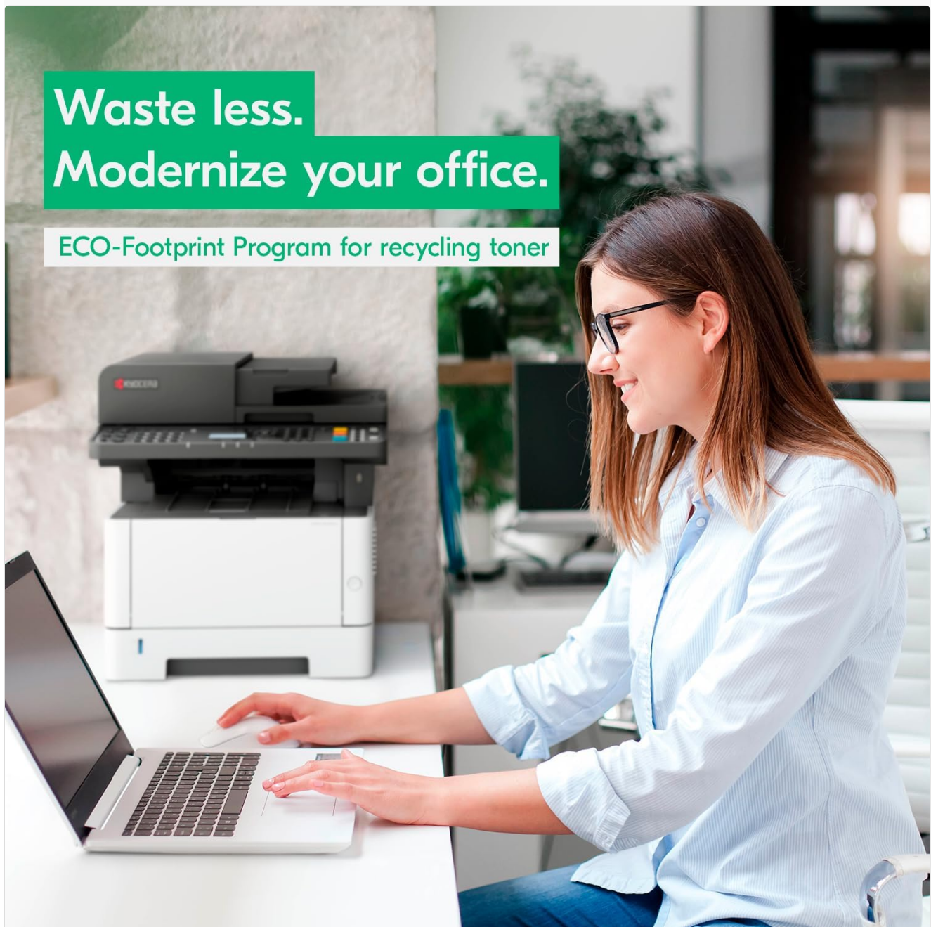
Figure 5.1: The ECO-Footprint Program supports recycling of toner cartridges to reduce waste.

KYOCERA is committed to environmental sustainability. Participate in the ECO-Footprint Program for responsible recycling of used toner cartridges. Information on how to return used cartridges can be found on the KYOCERA website.