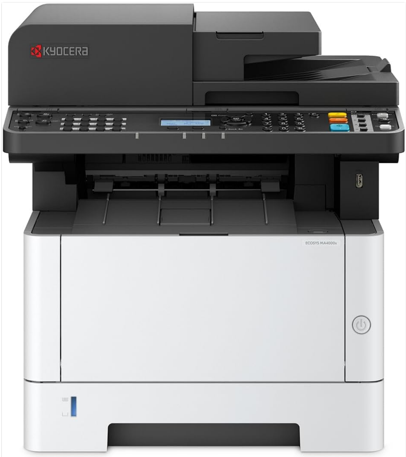
Figure 2.1: Front view of the KYOCERA ECOSYS MA4000x Multifunctional Laser Printer.