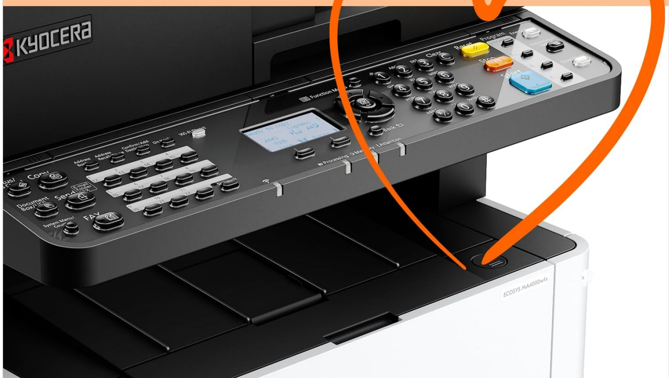
Figure 4.1: The printer's compatibility with mobile print applications and cloud services.

Compatible with Kyocera Mobile Print, MyPanel, and Kyocera Print Center.