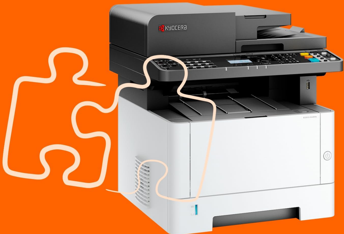
Figure 4.2: Enhanced compatibility with Kyocera Cloud Access, Net Viewer, Device Manager, and Fleet Services.

Kyocera Cloud Access Kyocera Net Viewer Kyocera Device Manager Kyocera Fleet Services